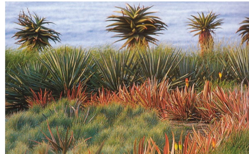
Colourful feature planting