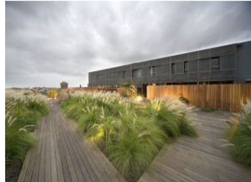
Timber decks and mass grass planting

Mass planting to minimize wind exposure and to soften edges of the space.