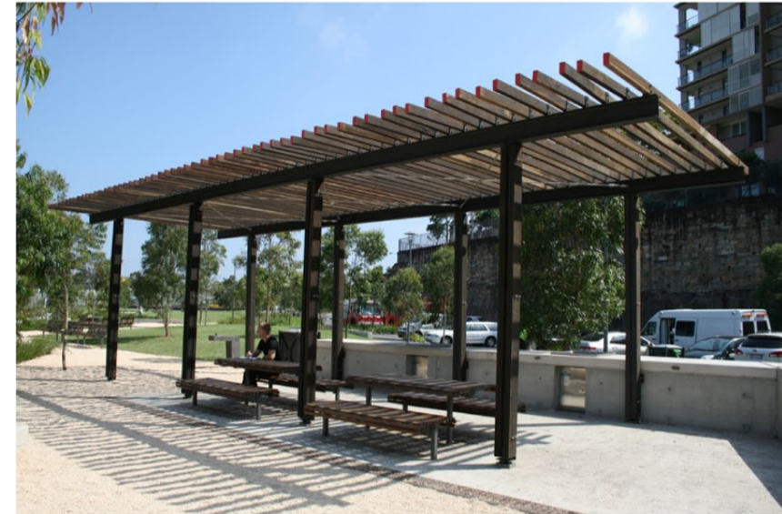
Timber pergola over BBQ and seating area