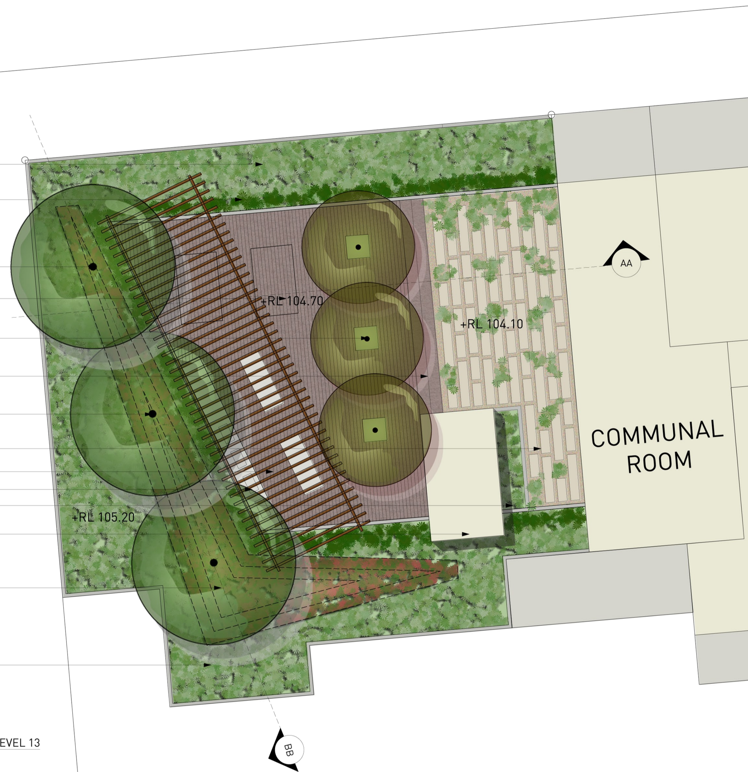
01 ROOFTOP TERRACE LANDSCAPE PLAN- LEVEL 13 1:100 @ A1

Mass planting in 1m high raised planter.