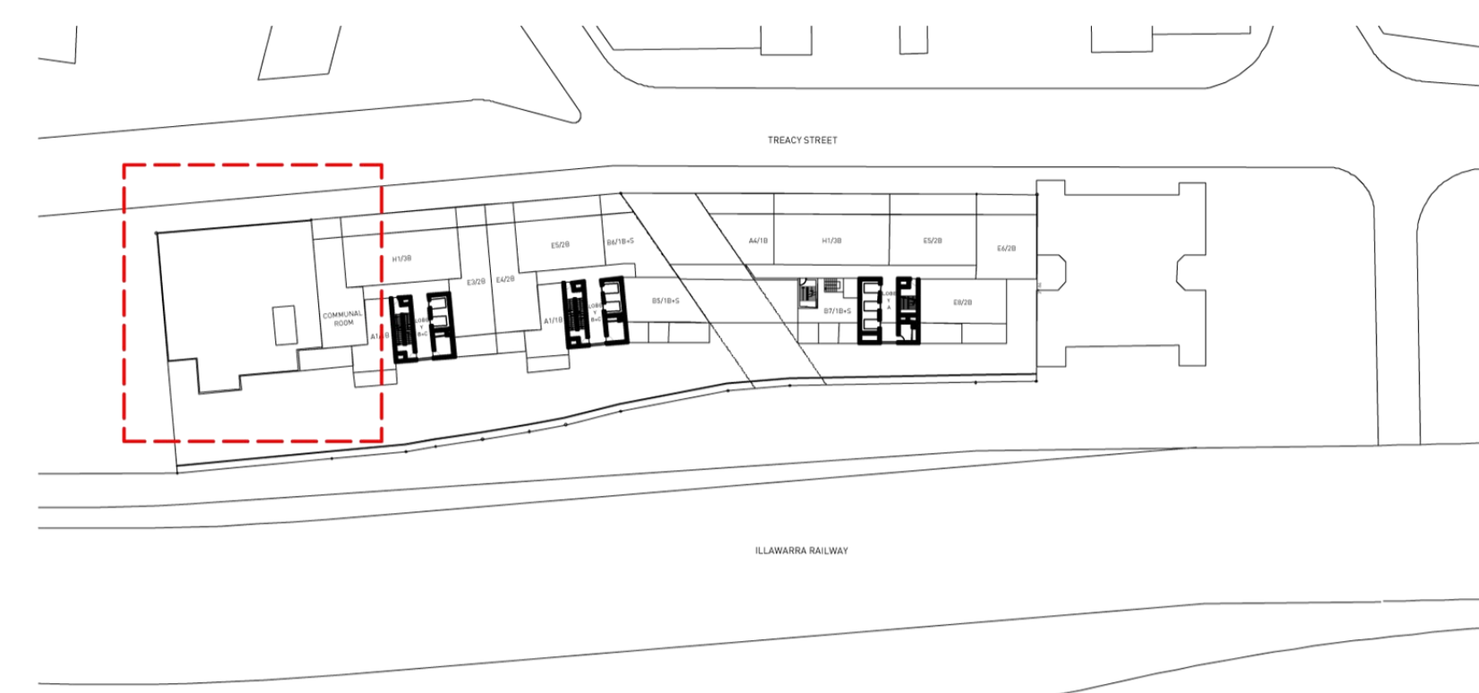
00 LOCATION PLAN 1:1000 @ A1