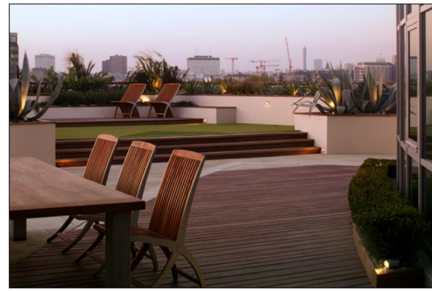
Timber deck and stairs