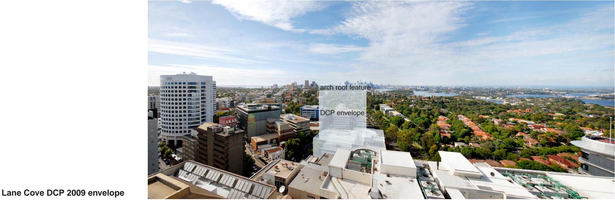
Lane Cove DCP 2009 envelope