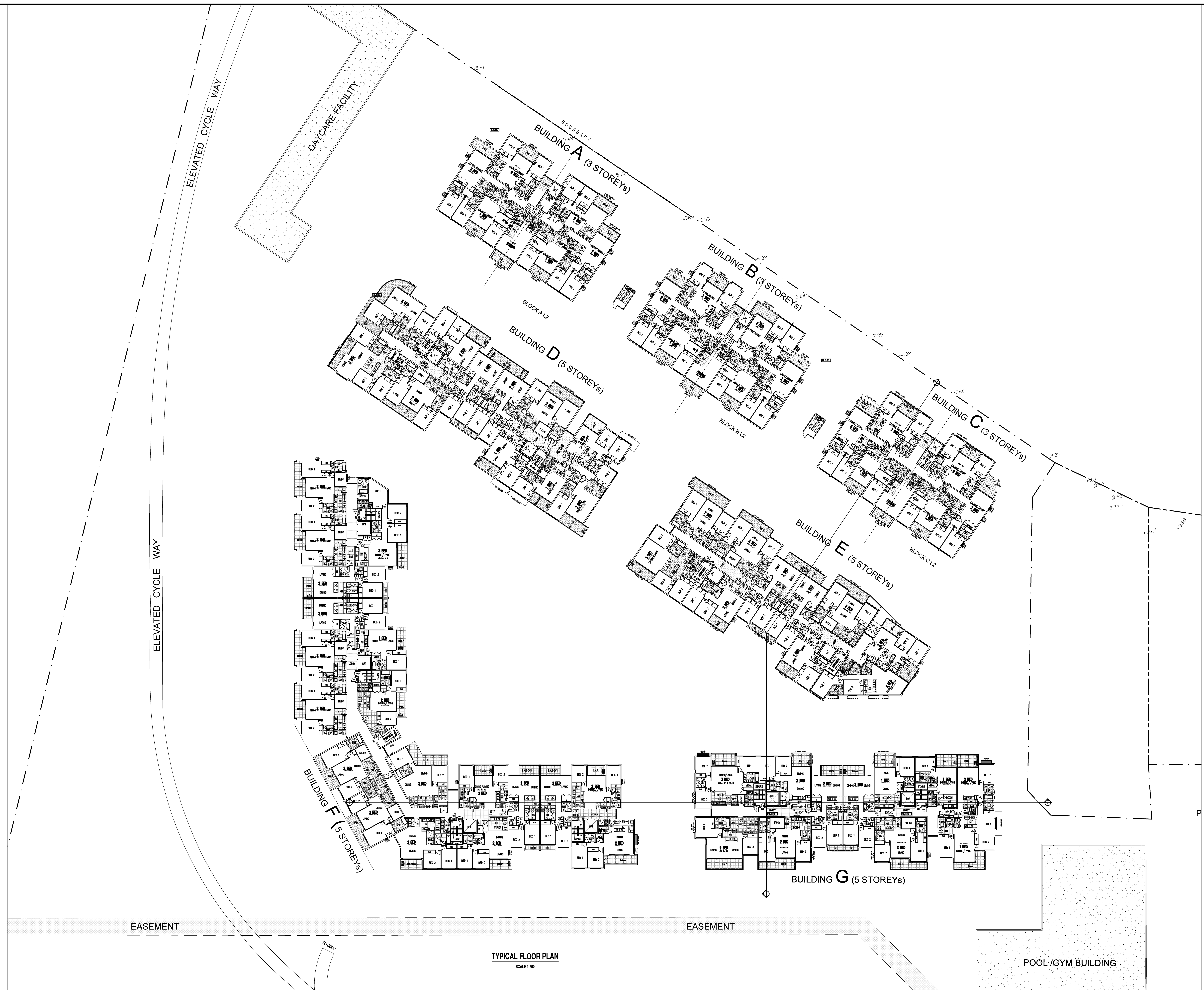
TYPICAL FLOOR PLAN SCALE 1:200