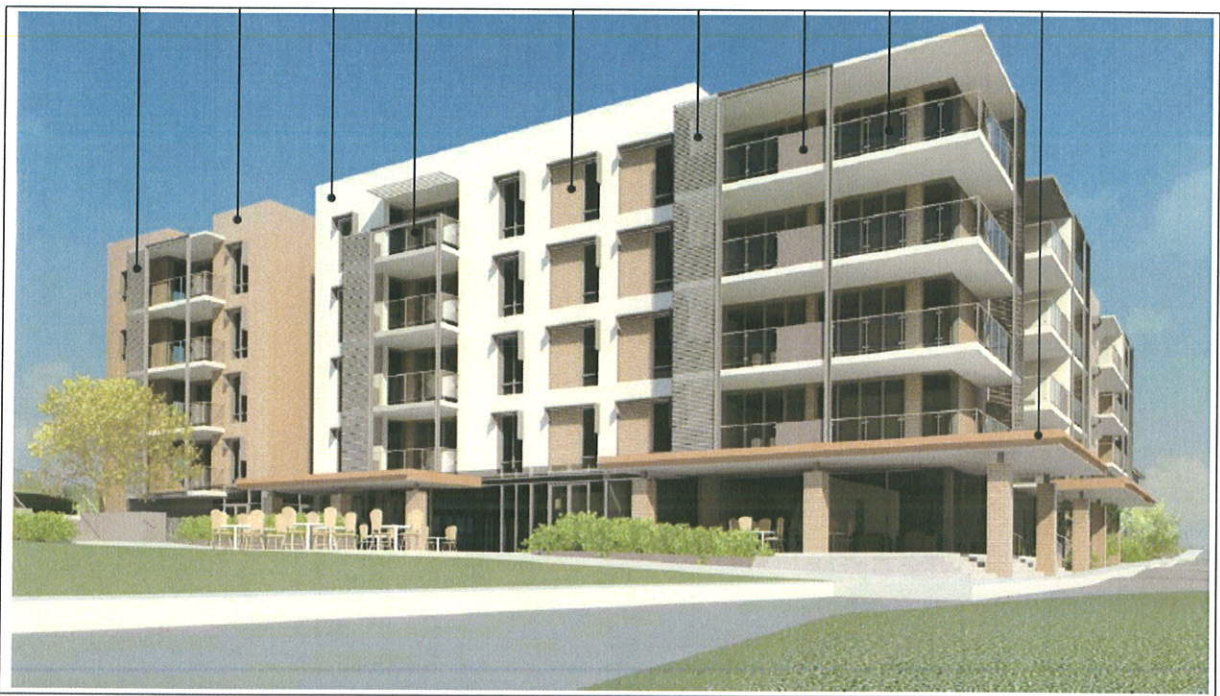
Figure 10: Indicative Image of the Village Green Precinct Buildings (Stage 1)