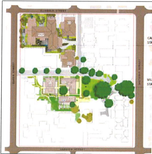
Figure 8: Stages 1 and 2

Figure 9 outlines those buildings (in blue) to be demolished during the 5 stage redevelopment of the village.