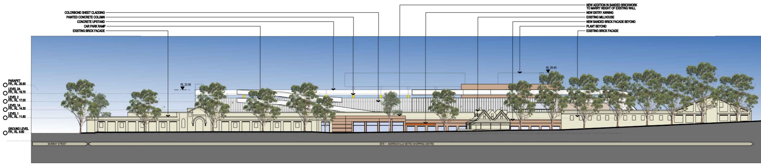
PROPOSED NORTH ELEVATION - VICTORIA RD

*TREES NOT SHOWN FOR CLARITY. REFER TO LANDSCAPE DRAWINGS FOR DETAILS.