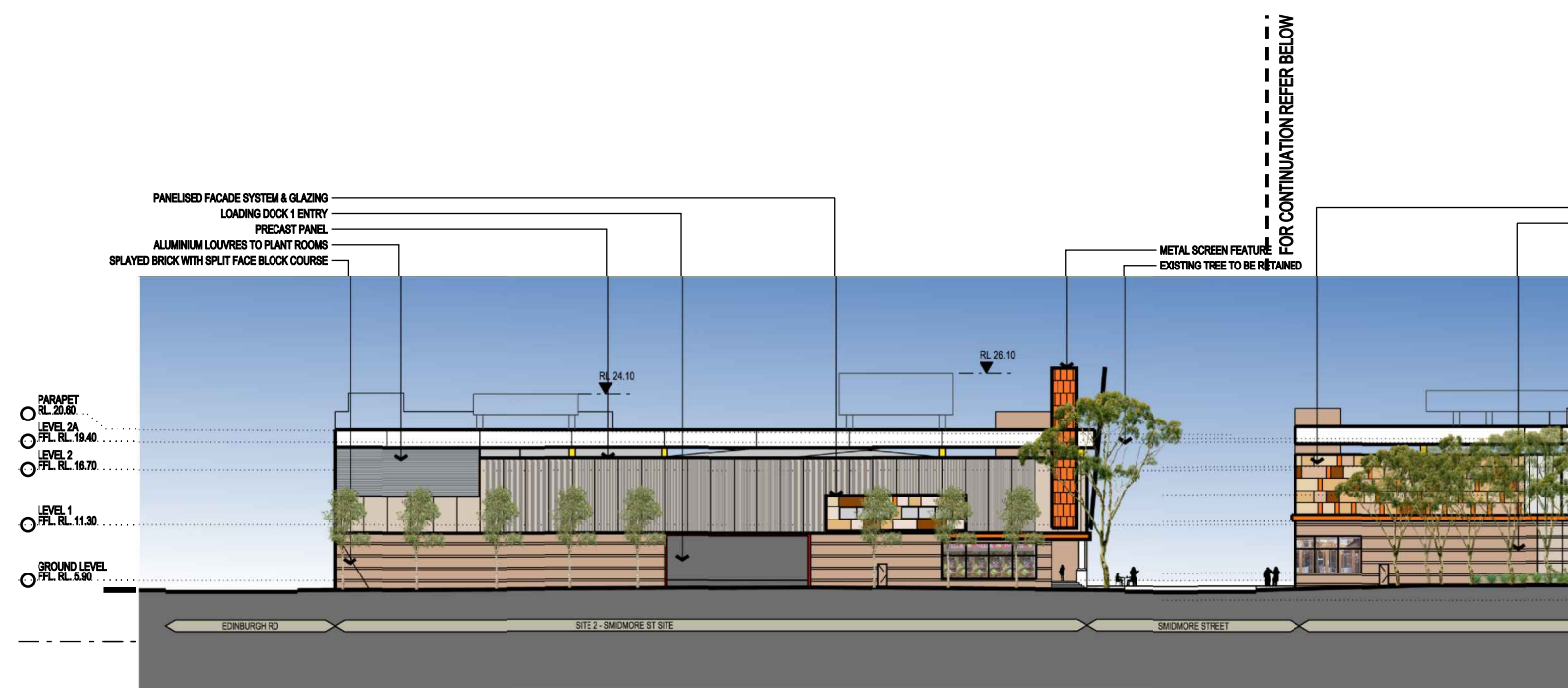
PROPOSED EAST ELEVATION - MURRAY STREET (SITE 2)