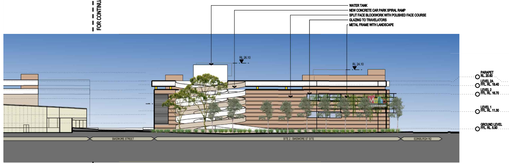
PROPOSED WEST ELEVATION - FROM EDINBURGH ROAD (SITE 2)