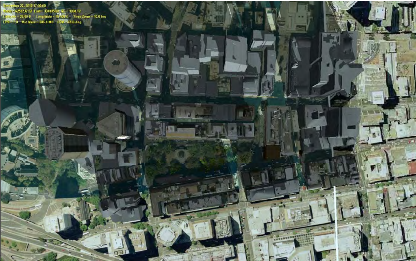
17:00:00 DECEMBER 22, 2010 CURRENT BUILDING SHADOWS