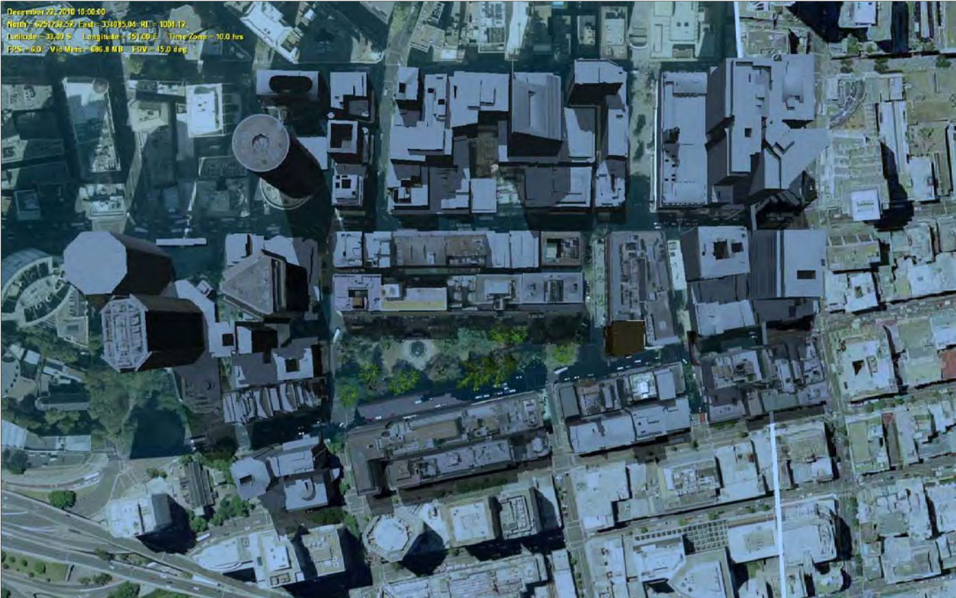
10:00:00 DECEMBER 22, 2010 CURRENT BUILDING SHADOWS