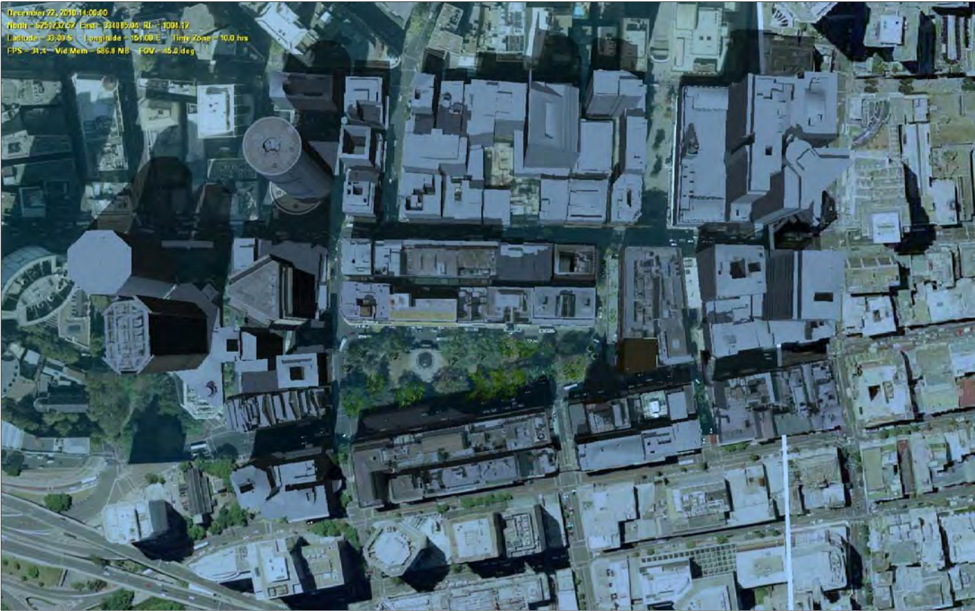
14:00:00 DECEMBER 22, 2010 CURRENT BUILDING SHADOWS