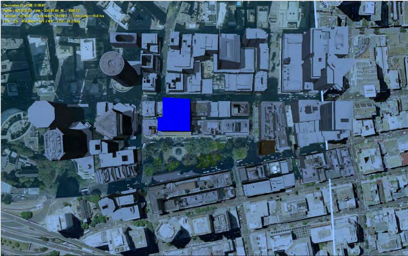
12:00:00 DECEMBER 22, 2010 SHADOW ANALYSIS 6 METRE SETBACK ABOVE RL 62 AHD FOR CARRINGTON STREET FRONTAGE PROPOSED CITY ONE PROJECT