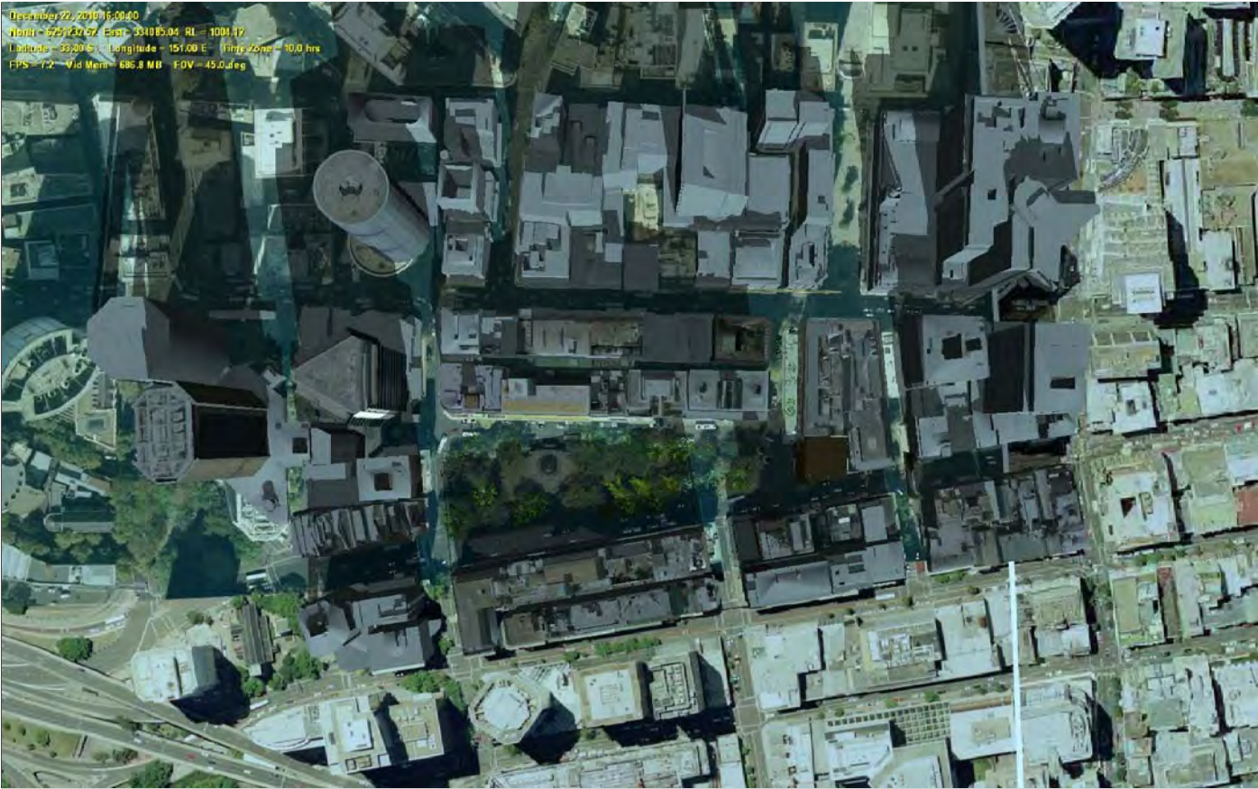
16:00:00 DECEMBER 22, 2010 CURRENT BUILDING SHADOWS