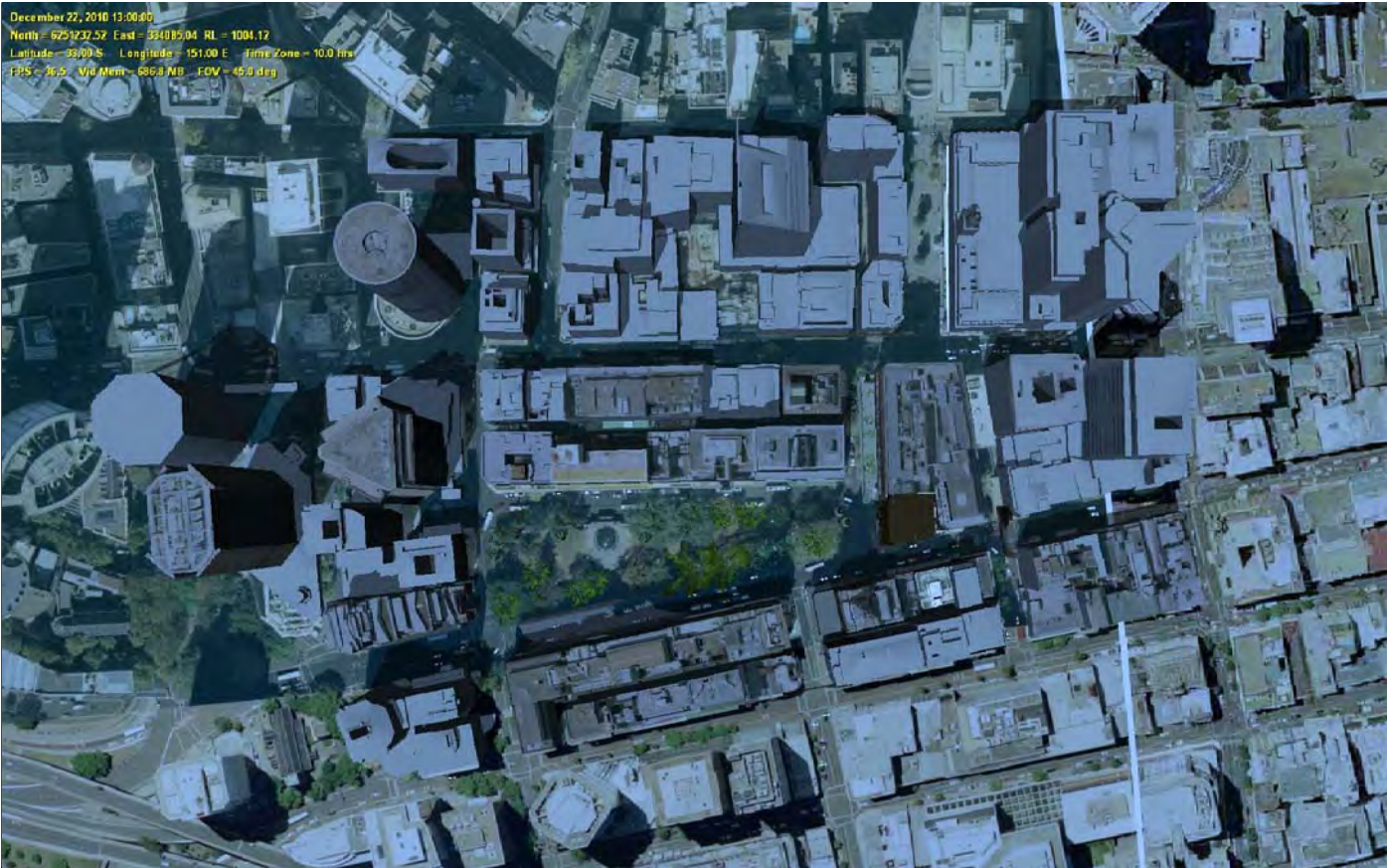
13:00:00 DECEMBER 22, 2010 CURRENT BUILDING SHADOWS