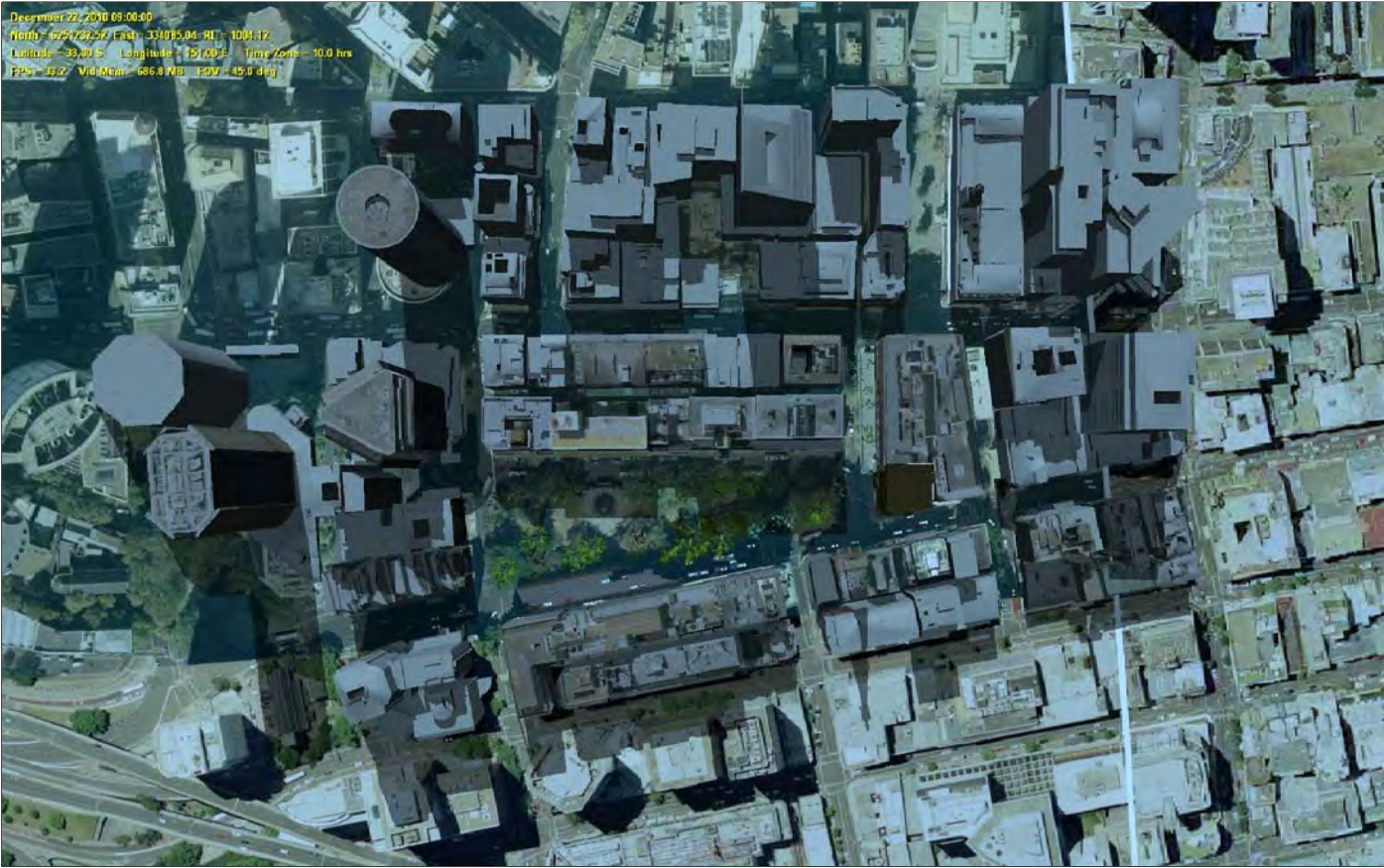
09:00:00 DECEMBER 22, 2010 CURRENT BUILDING SHADOWS