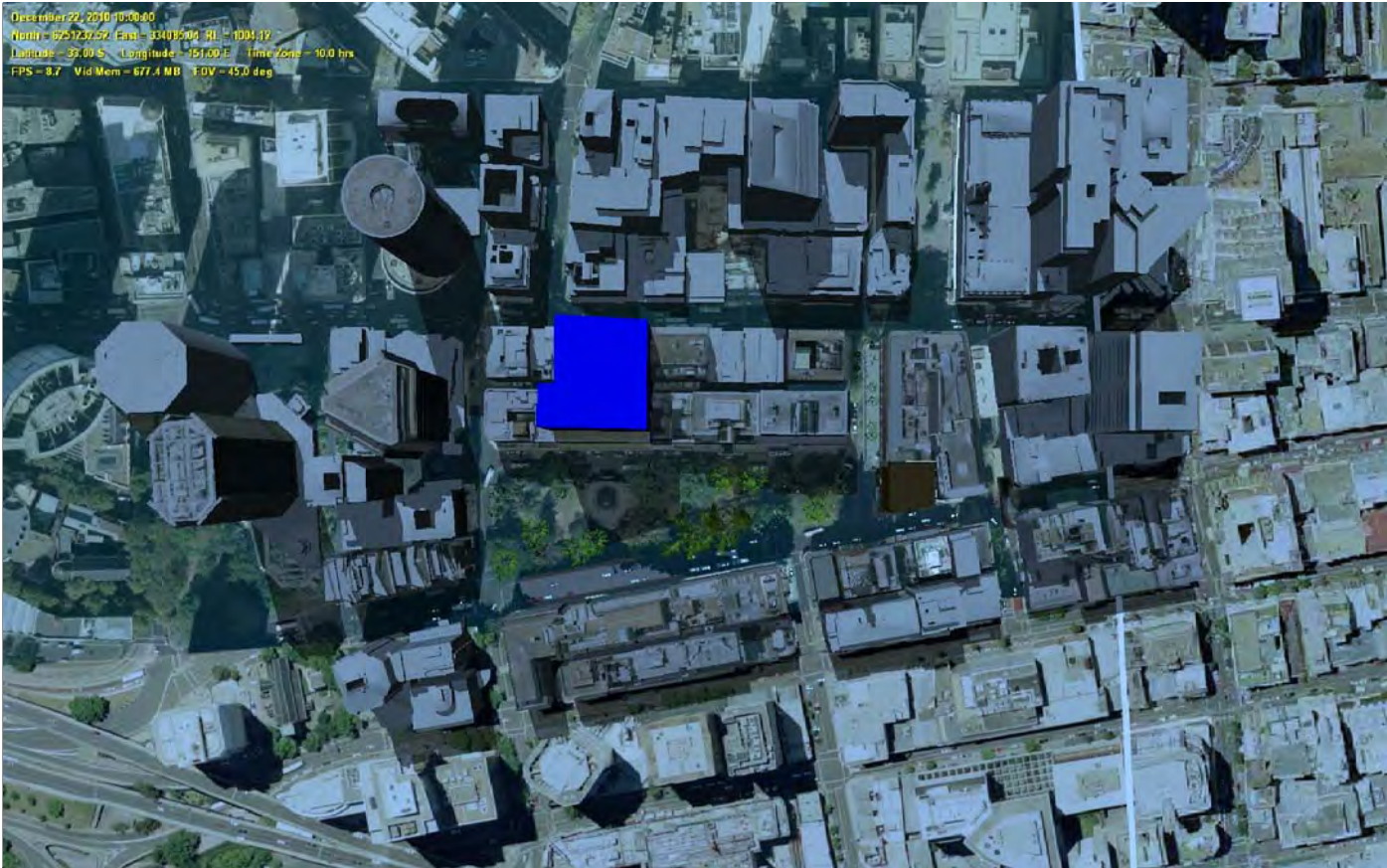
10:00:00 DECEMBER 22, 2010 SHADOW ANALYSIS 6 METRE SETBACK ABOVE RL 62 AHD FOR CARRINGTON STREET FRONTAGE PROPOSED CITY ONE PROJECT