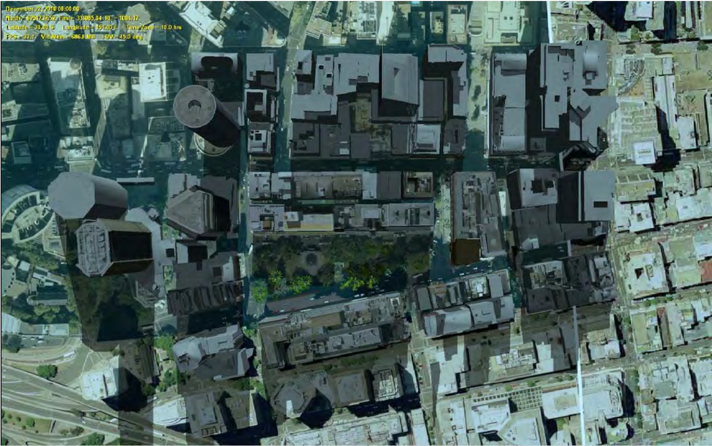
08:00:00 DECEMBER 22, 2010 CURRENT BUILDING SHADOWS