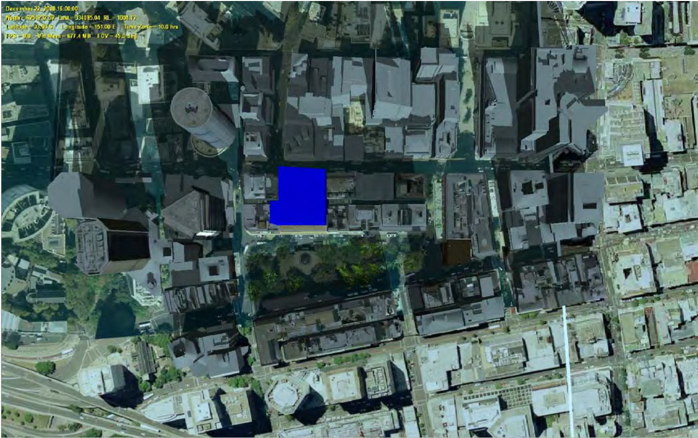
16:00:00 DECEMBER 22, 2010 SHADOW ANALYSIS 6 METRE SETBACK ABOVE RL 62 AHD FOR CARRINGTON STREET FRONTAGE PROPOSED CITY ONE PROJECT