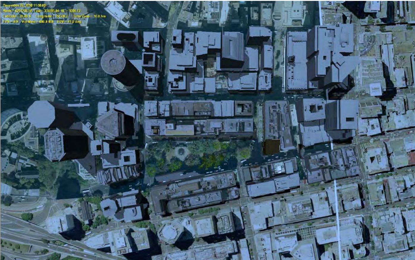
11:00:00 DECEMBER 22, 2010 CURRENT BUILDING SHADOWS