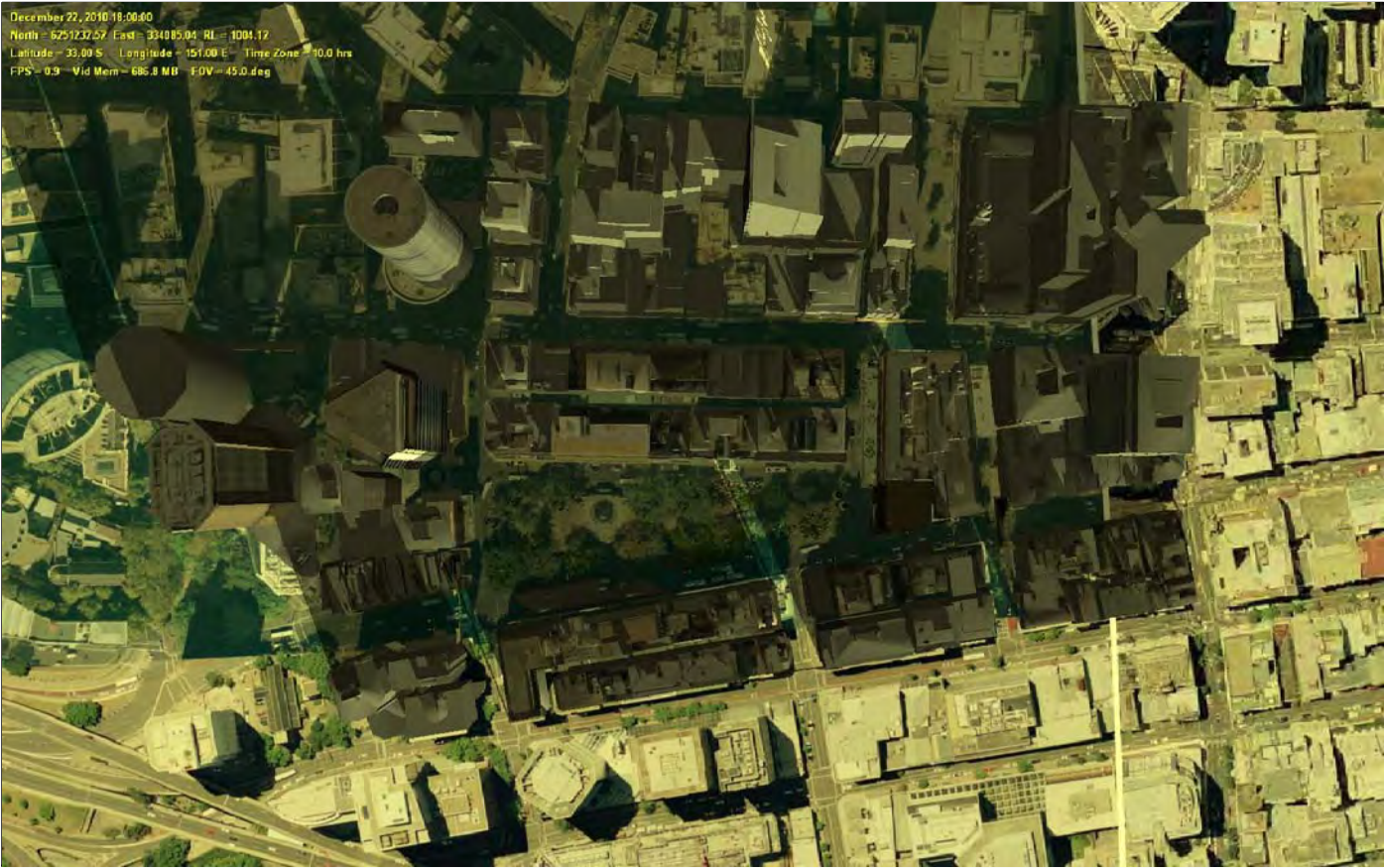
18:00:00 DECEMBER 22, 2010 CURRENT BUILDING SHADOWS