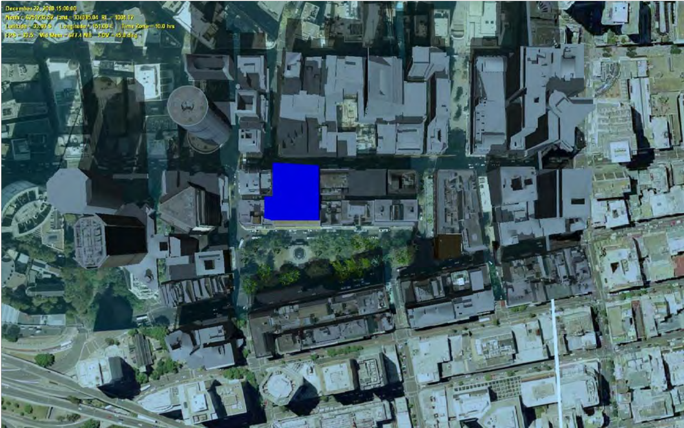
15:00:00 DECEMBER 22, 2010 SHADOW ANALYSIS 6 METRE SETBACK ABOVE RL 62 AHD FOR CARRINGTON STREET FRONTAGE PROPOSED CITY ONE PROJECT