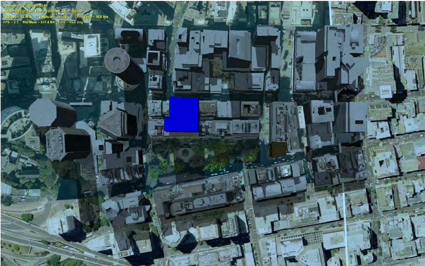
09:00:00 DECEMBER 22, 2010 SHADOW ANALYSIS 6 METRE SETBACK ABOVE RL 62 AHD FOR CARRINGTON STREET FRONTAGE PROPOSED CITY ONE PROJECT