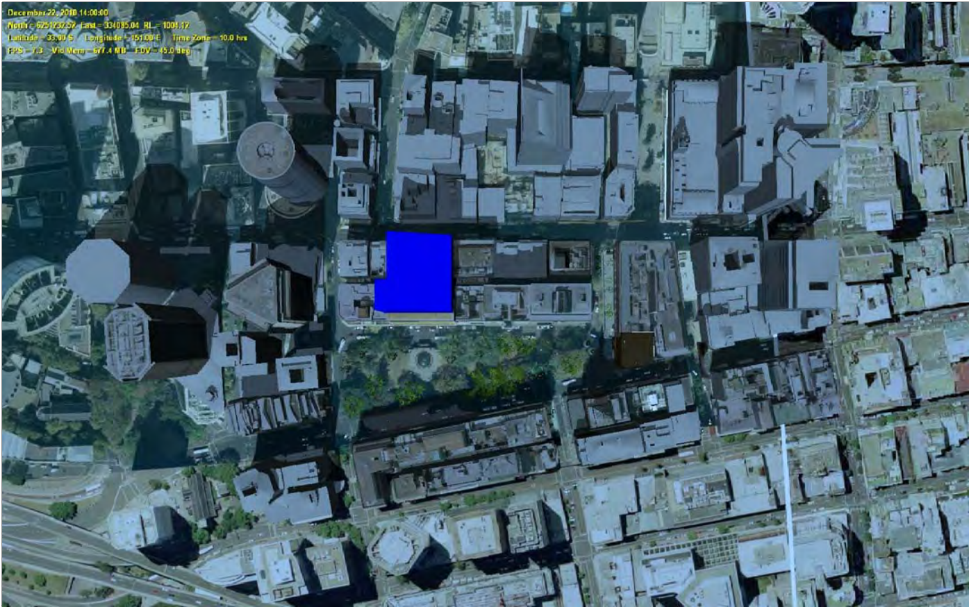
14:00:00 DECEMBER 22, 2010 SHADOW ANALYSIS 6 METRE SETBACK ABOVE RL 62 AHD FOR CARRINGTON STREET FRONTAGE PROPOSED CITY ONE PROJECT