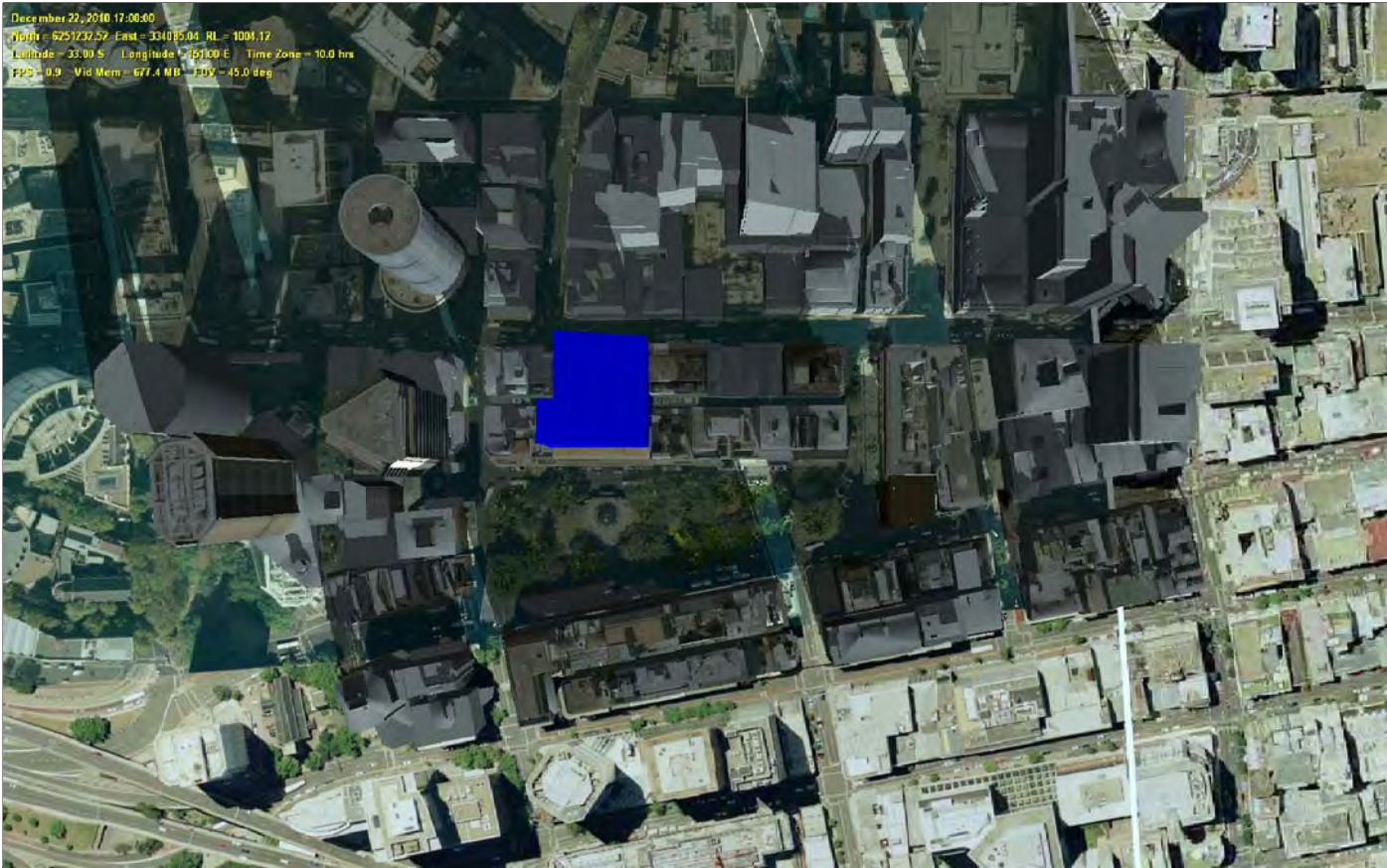
17:00:00 DECEMBER 22, 2010 SHADOW ANALYSIS 6 METRE SETBACK ABOVE RL 62 AHD FOR CARRINGTON STREET FRONTAGE PROPOSED CITY ONE PROJECT