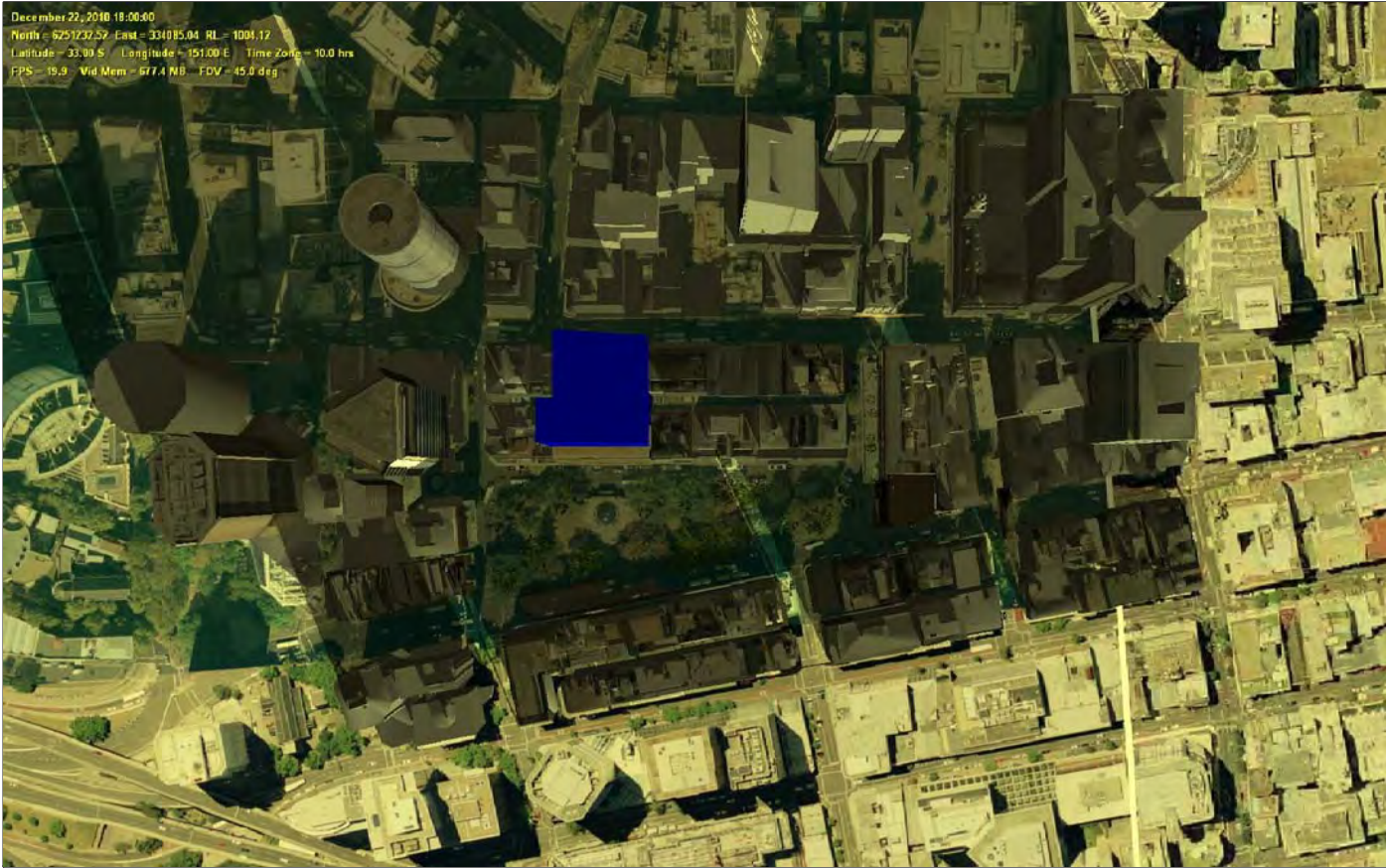
18:00:00 DECEMBER 22, 2010 SHADOW ANALYSIS 6 METRE SETBACK ABOVE RL 62 AHD FOR CARRINGTON STREET FRONTAGE PROPOSED CITY ONE PROJECT