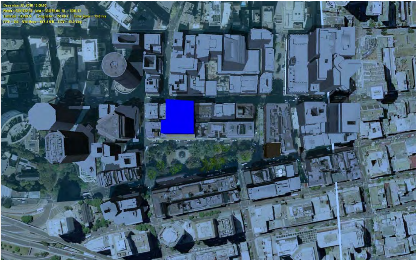
13:00:00 DECEMBER 22, 2010 SHADOW ANALYSIS 6 METRE SETBACK ABOVE RL 62 AHD FOR CARRINGTON STREET FRONTAGE PROPOSED CITY ONE PROJECT