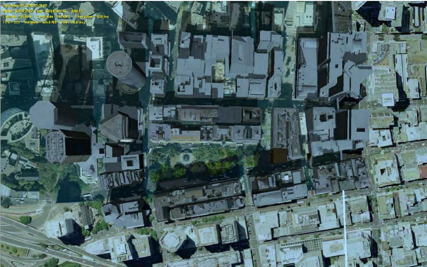
15:00:00 DECEMBER 22, 2010 CURRENT BUILDING SHADOWS