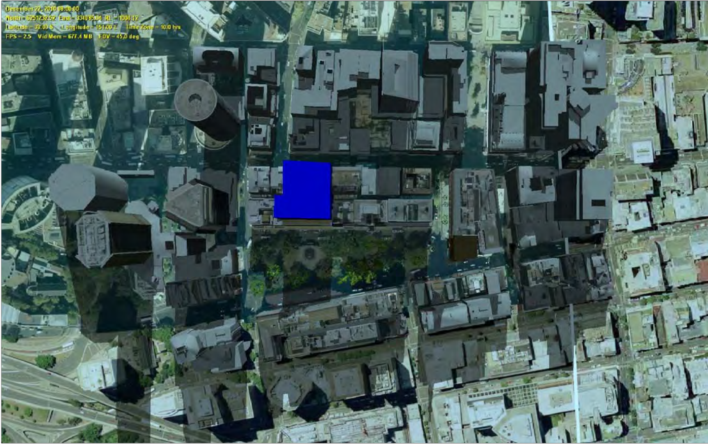
08:00:00 DECEMBER 22, 2010 SHADOW ANALYSIS 6 METRE SETBACK ABOVE RL 62 AHD FOR CARRINGTON STREET FRONTAGE PROPOSED CITY ONE PROJECT