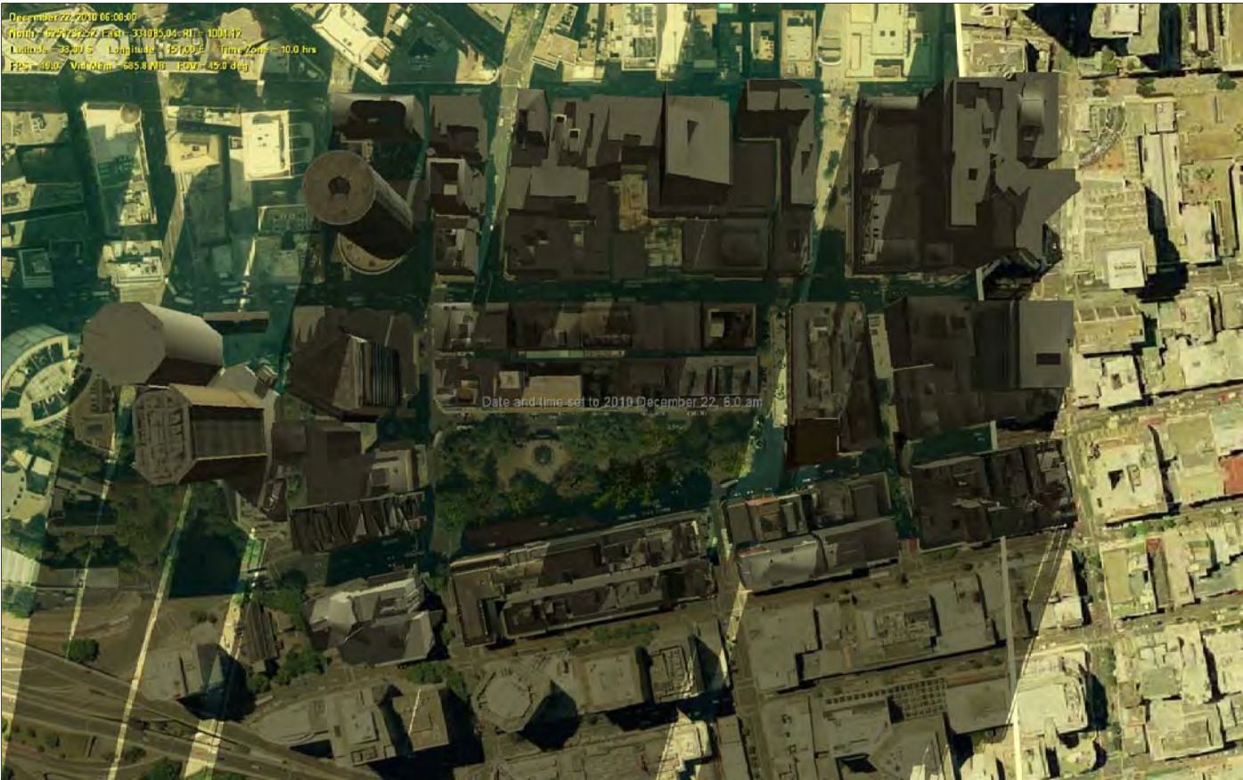
06:00:00 DECEMBER 22, 2010 CURRENT BUILDING SHADOWS