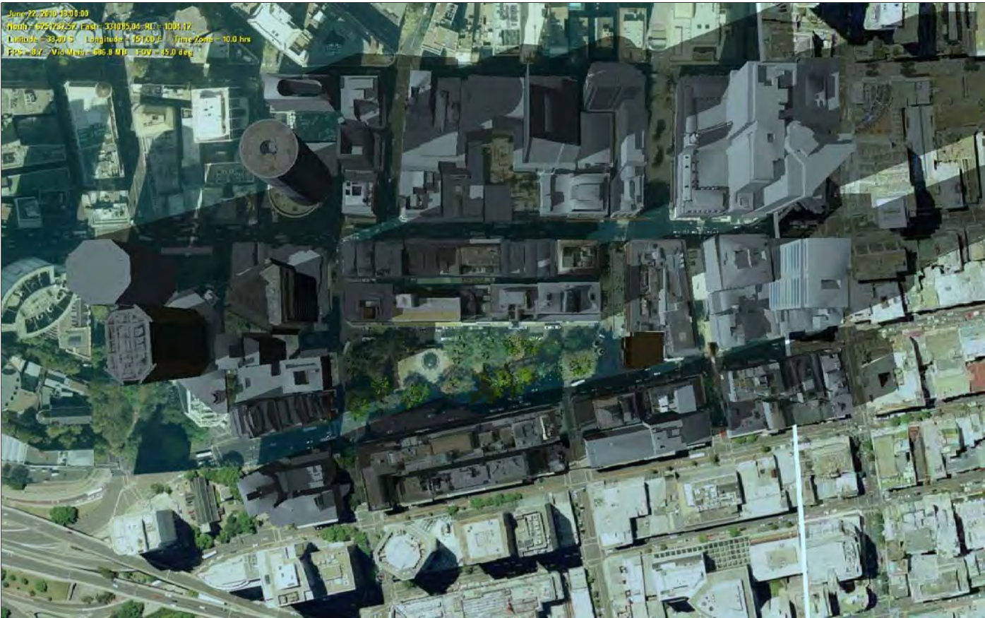
13:00:00 JUNE 22, 2010 CURRENT BUILDING SHADOWS