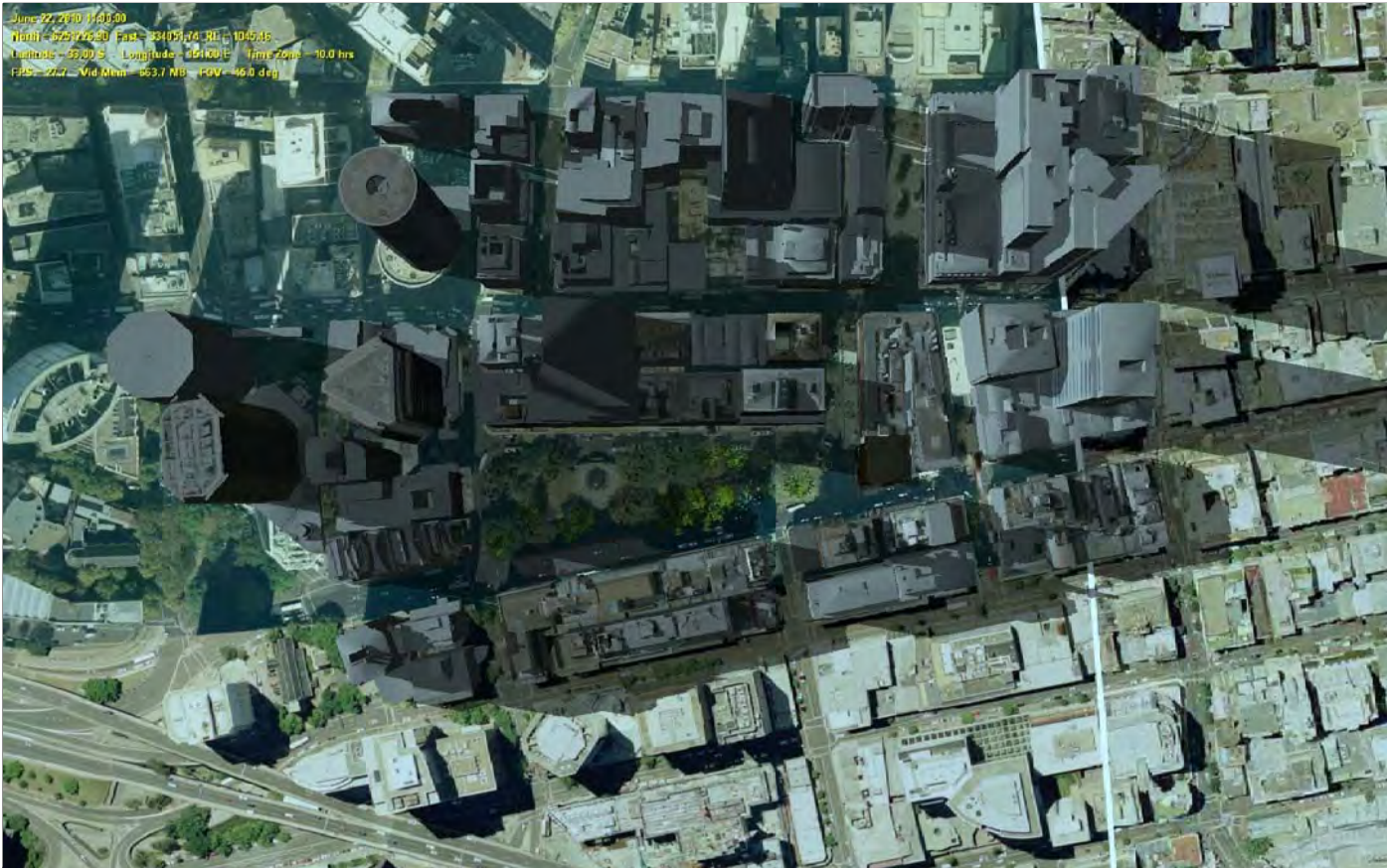
11:00:00 JUNE 22, 2010 SHADOW ANALYSIS FOLLOWING COMPLETION OF PROPOSED CITY ONE PROJECT