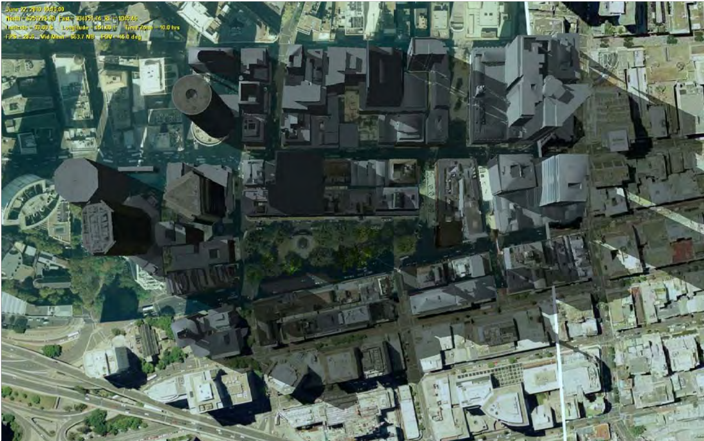
10:00:00 JUNE 22, 2010 SHADOW ANALYSIS FOLLOWING COMPLETION OF PROPOSED CITY ONE PROJECT