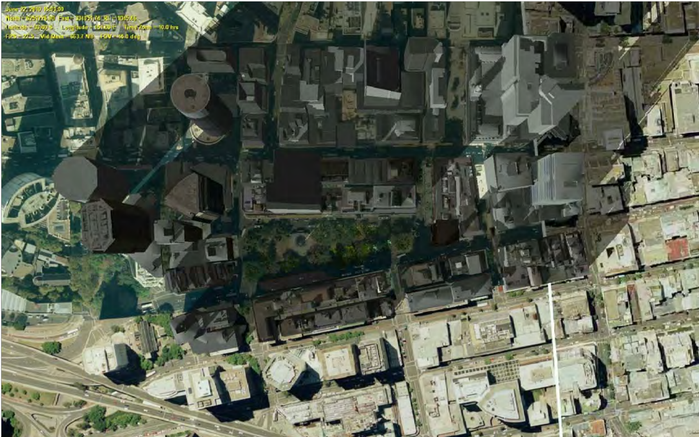
15:00:00 JUNE 22, 2010 SHADOW ANALYSIS FOLLOWING COMPLETION OF PROPOSED CITY ONE PROJECT