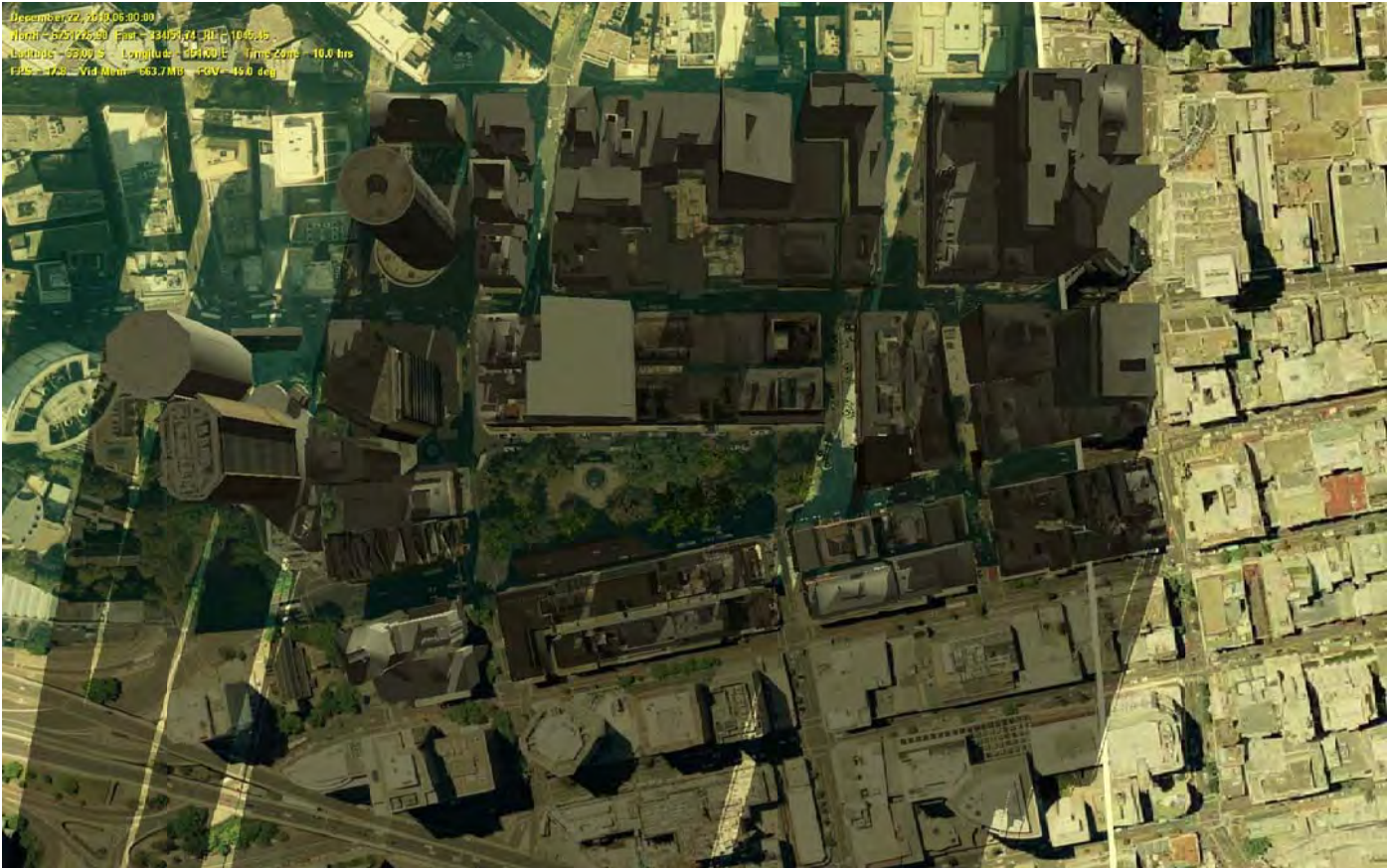
06:00:00 DECEMBER 22, 2010 SHADOW ANALYSIS FOLLOWING COMPLETION OF PROPOSED CITY ONE PROJECT