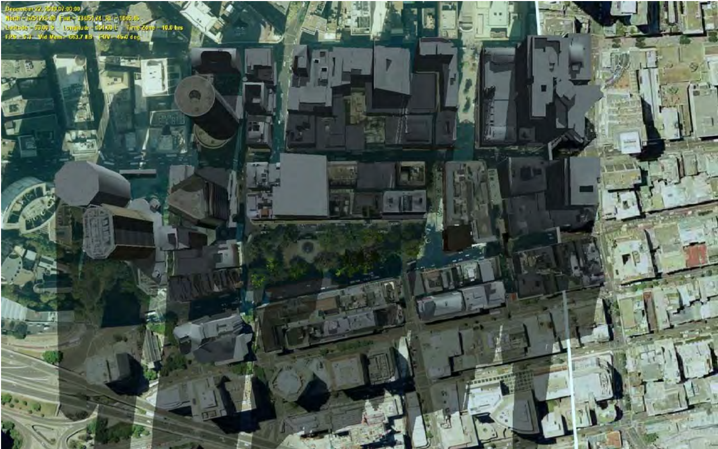
07:00:00 DECEMBER 22, 2010 SHADOW ANALYSIS FOLLOWING COMPLETION OF PROPOSED CITY ONE PROJECT