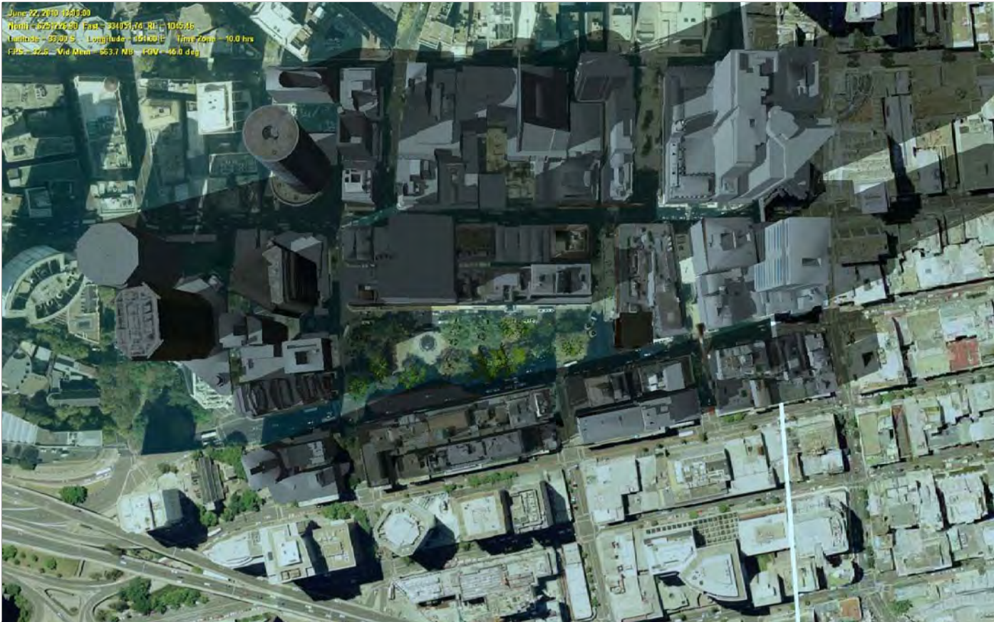
13:00:00 JUNE 22, 2010 SHADOW ANALYSIS FOLLOWING COMPLETION OF PROPOSED CITY ONE PROJECT