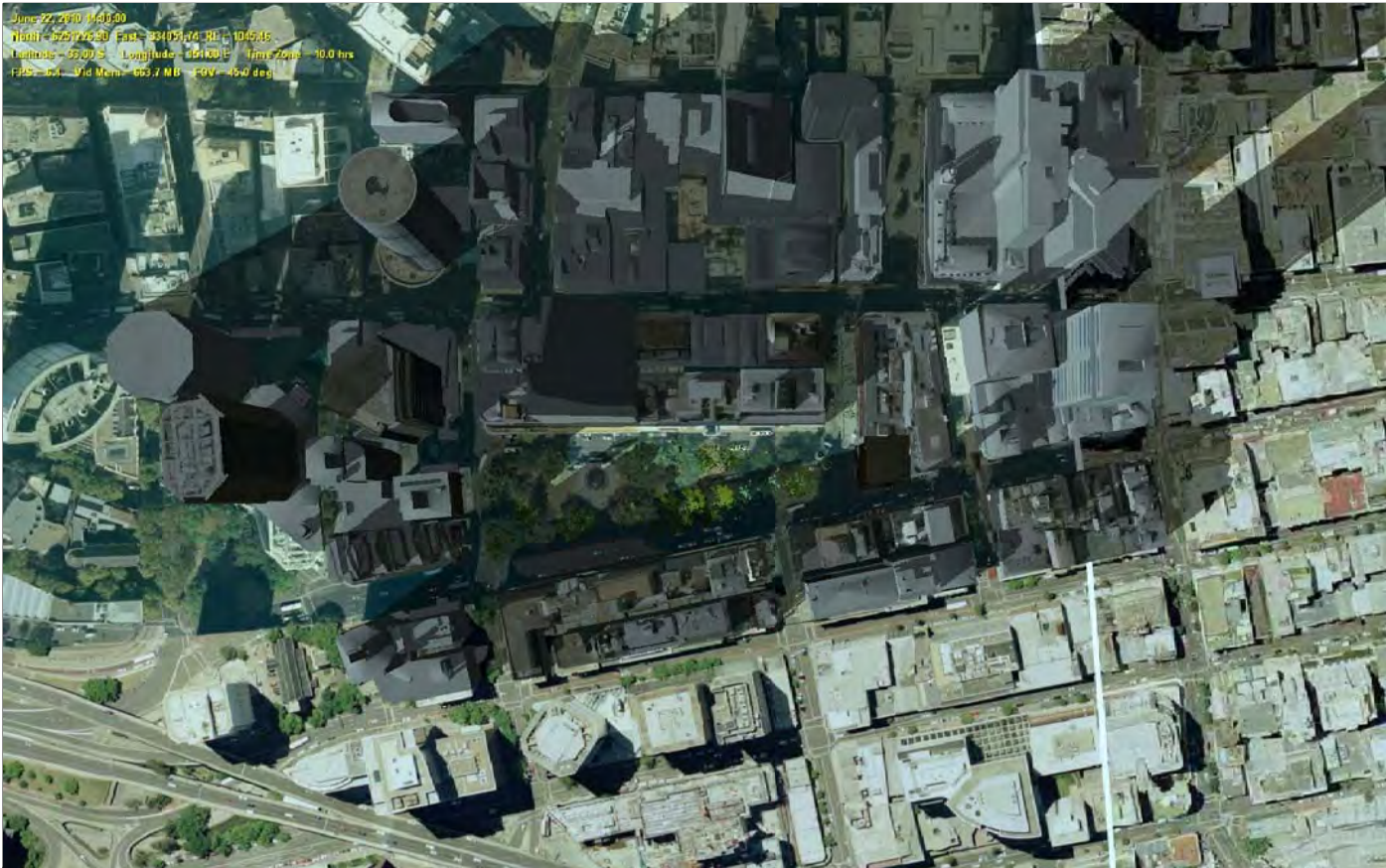
14:00:00 JUNE 22, 2010 SHADOW ANALYSIS FOLLOWING COMPLETION OF PROPOSED CITY ONE PROJECT