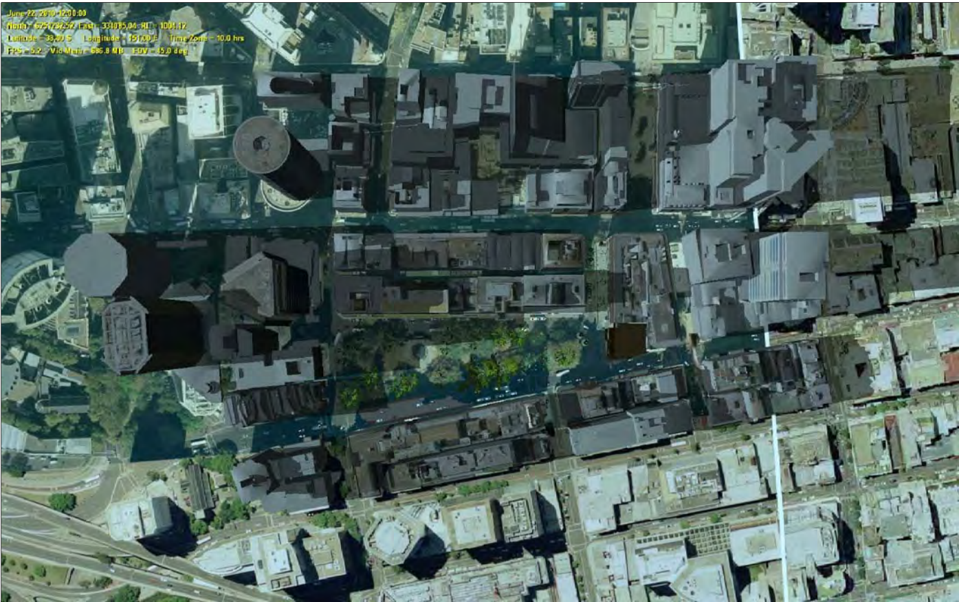
12:00:00 JUNE 22, 2010 CURRENT BUILDING SHADOWS