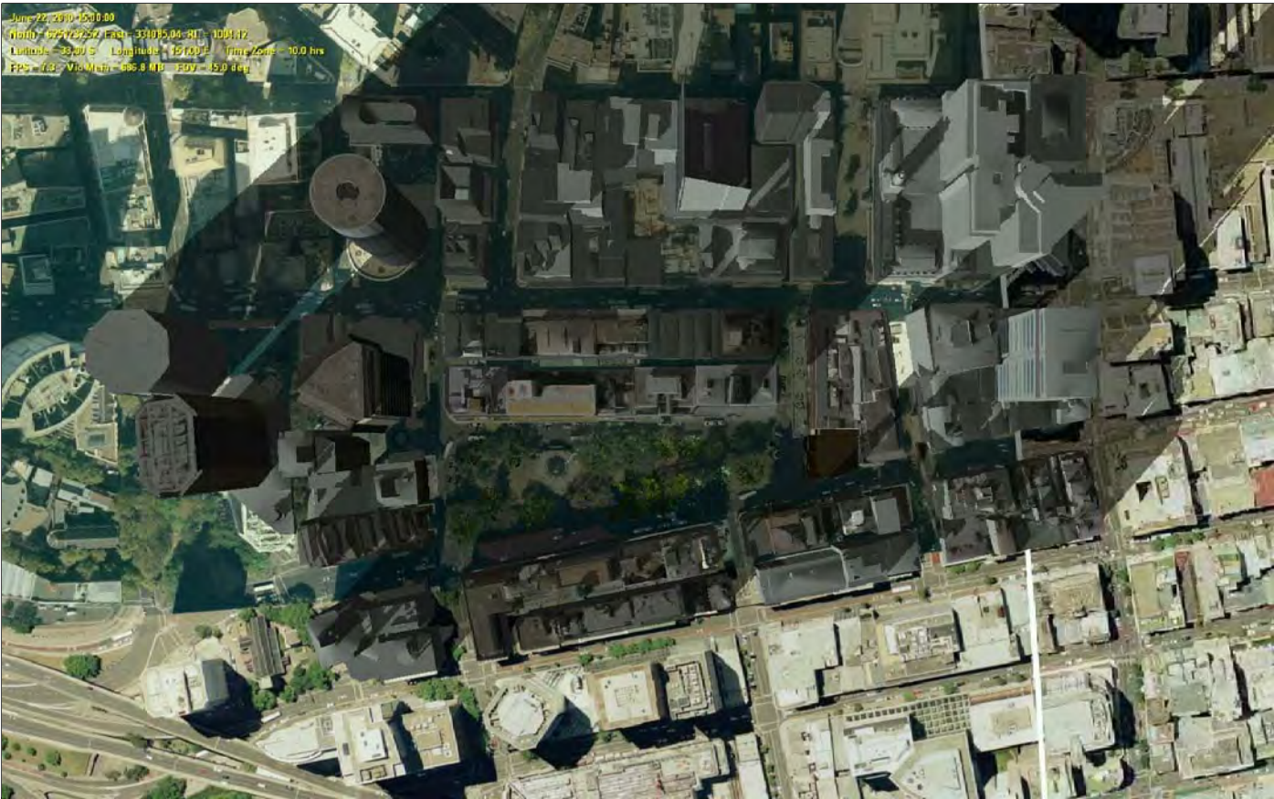
15:00:00 JUNE 22, 2010 CURRENT BUILDING SHADOWS