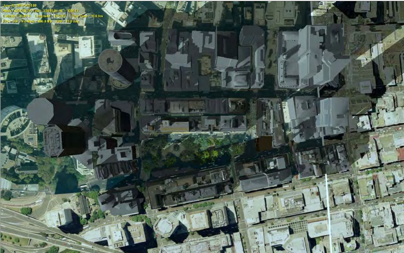
14:00:00 JUNE 22, 2010 CURRENT BUILDING SHADOWS