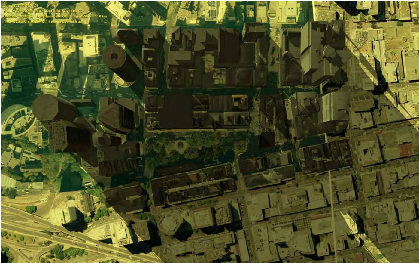
08:00:00 JUNE 22, 2010 SHADOW ANALYSIS FOLLOWING COMPLETION OF PROPOSED CITY ONE PROJECT