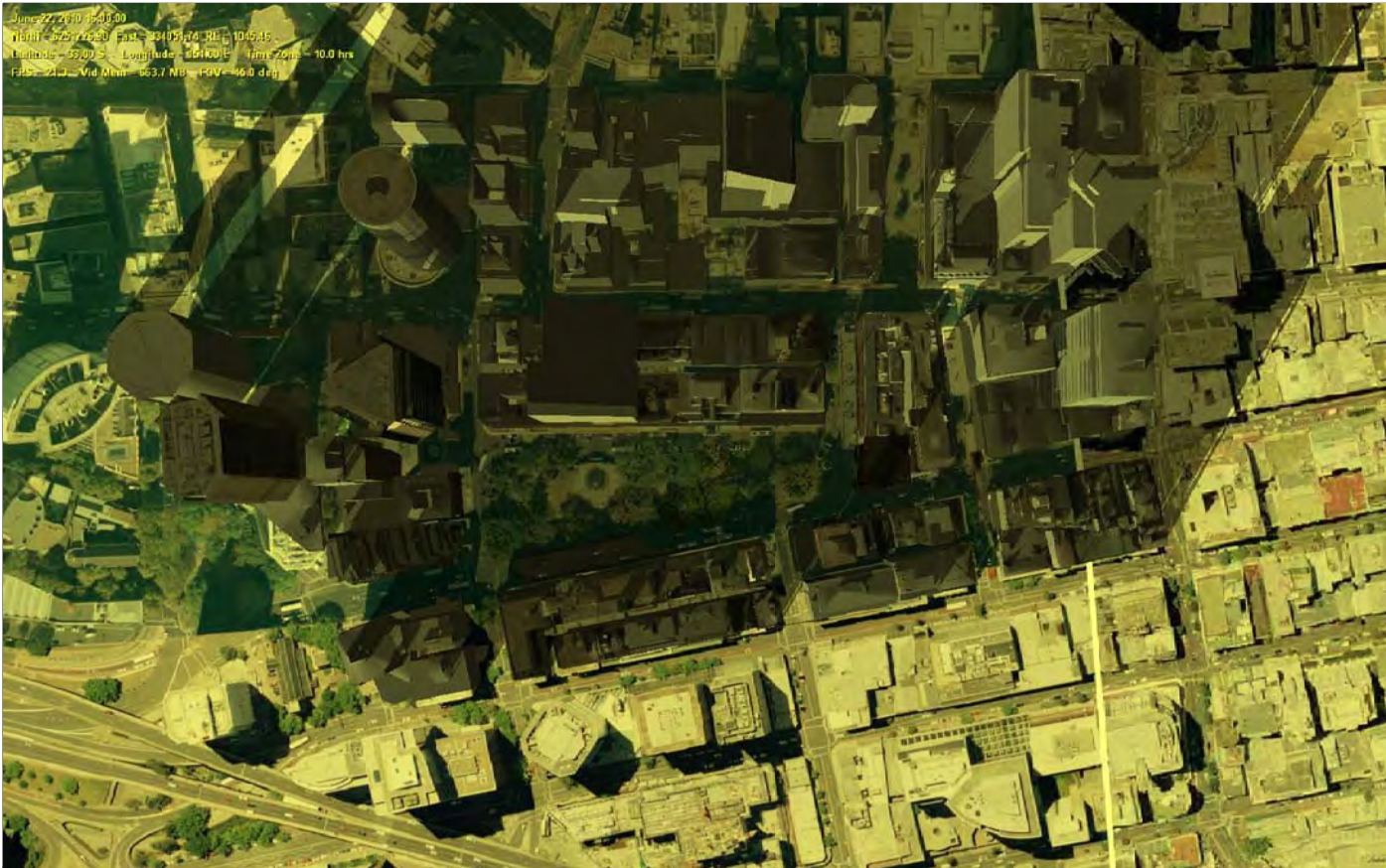
16:00:00 JUNE 22, 2010 SHADOW ANALYSIS FOLLOWING COMPLETION OF PROPOSED CITY ONE PROJECT