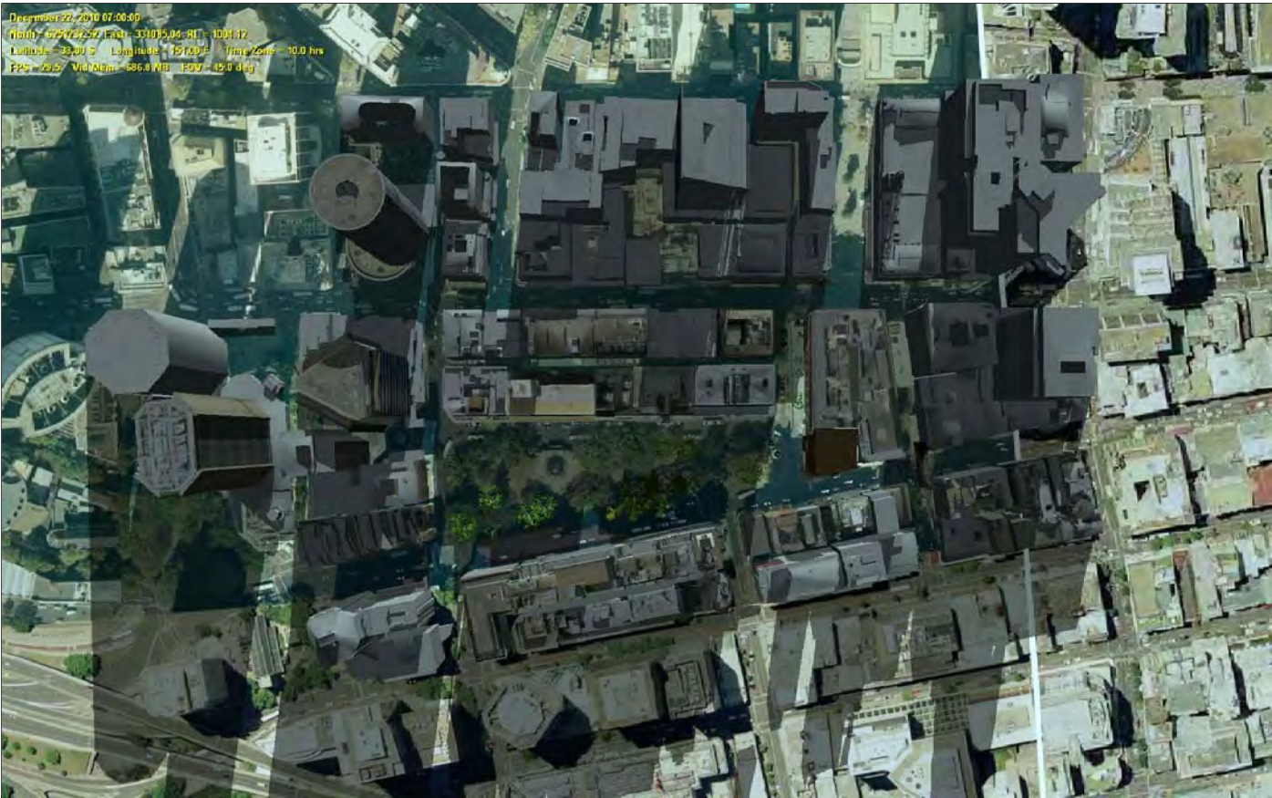
07:00:00 DECEMBER 22, 2010 CURRENT BUILDING SHADOWS