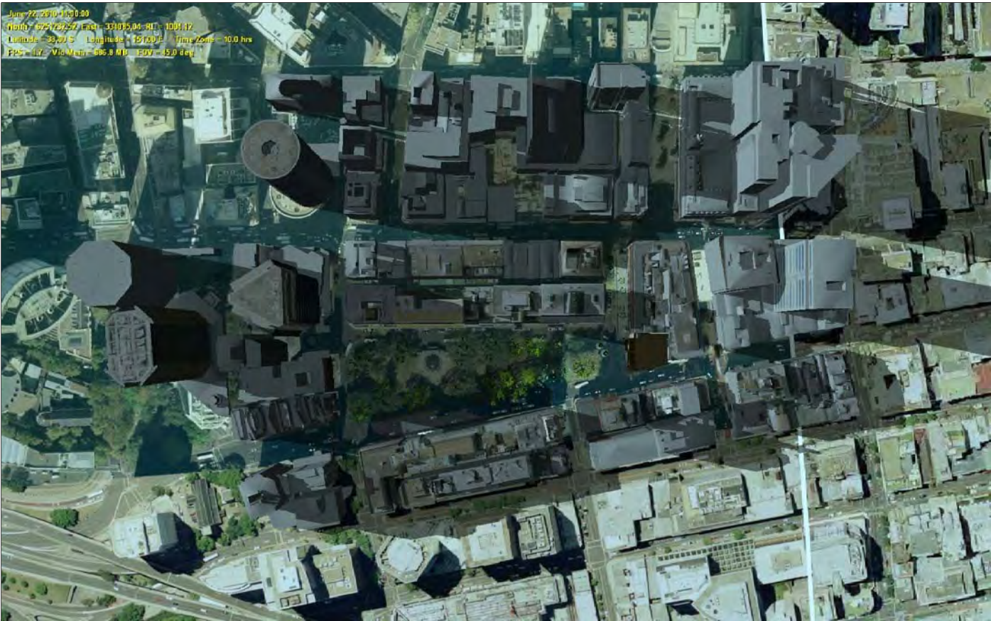
11:00:00 JUNE 22, 2010 CURRENT BUILDING SHADOWS