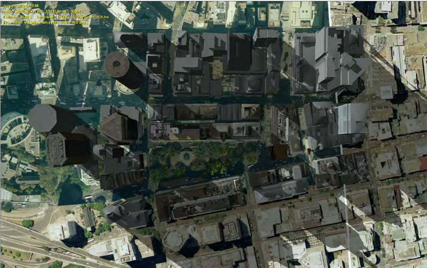
09:00:00 JUNE 22, 2010 CURRENT BUILDING SHADOWS