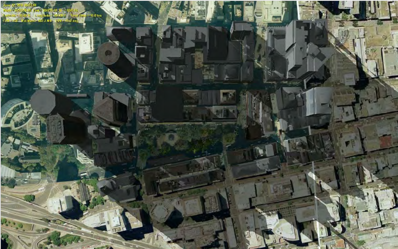
09:00:00 JUNE 22, 2010 SHADOW ANALYSIS FOLLOWING COMPLETION OF PROPOSED CITY ONE PROJECT