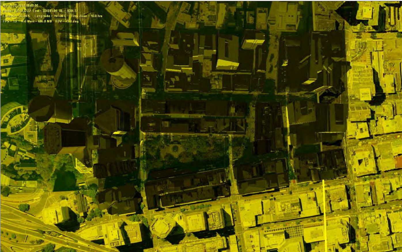
18:00:00 MARCH 22, 2010 CURRENT BUILDING SHADOWS