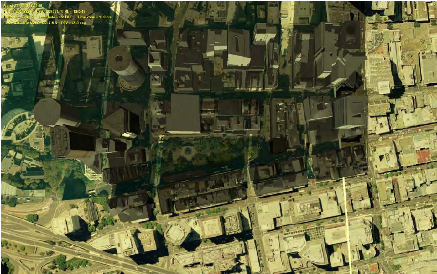
17:00:00 MARCH 22, 2010 SHADOW ANALYSIS FOLLOWING COMPLETION OF PROPOSED CITY ONE PROJECT