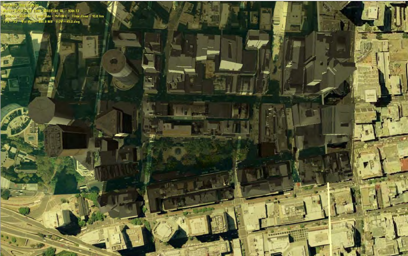
17:00:00 MARCH 22, 2010 CURRENT BUILDING SHADOWS