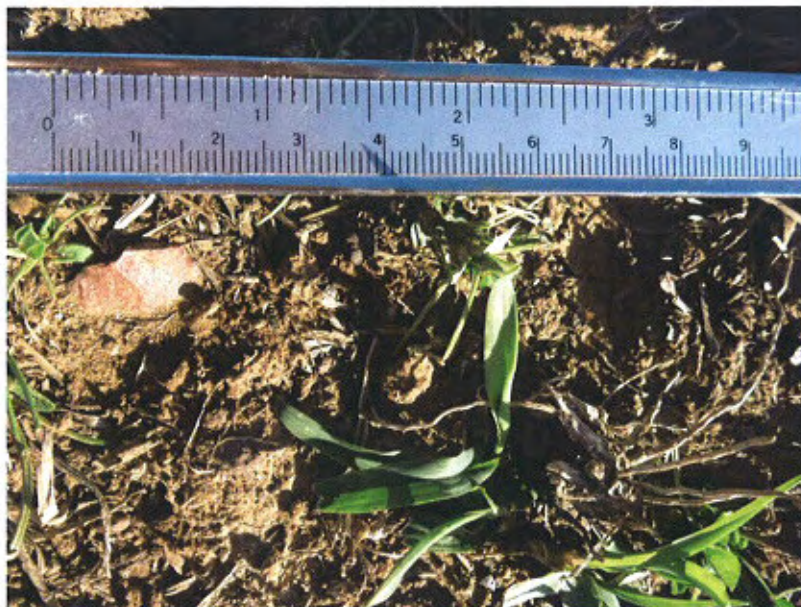
Red silcrete flake located next the vehicle track on the south side of the large dam bank.