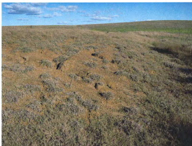
Eroded dam bank close to the where the silcrete flake was located.