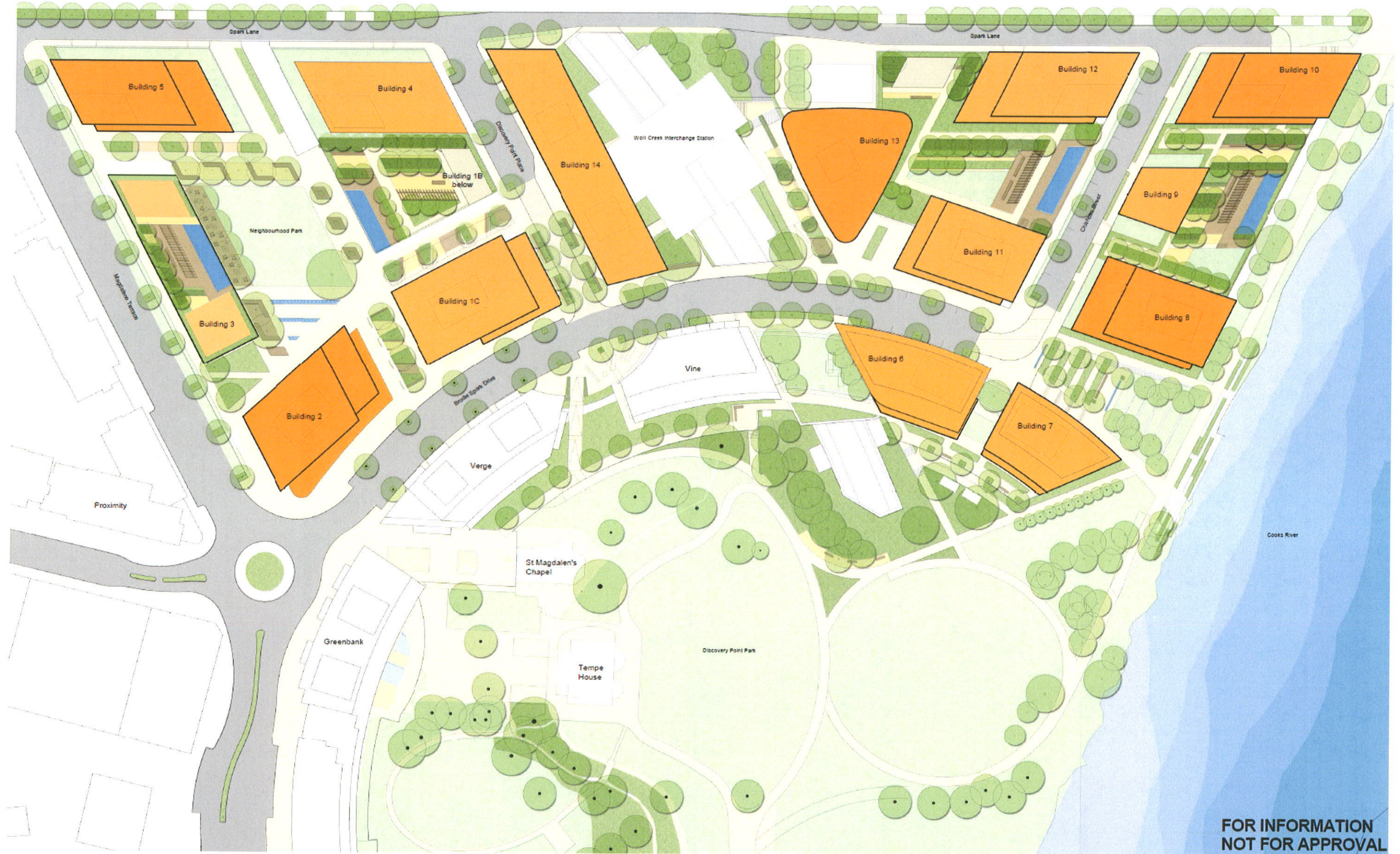
Figure 4: Proposed indicative design and open space scheme as contained in the PPR (orange shaded buildings included in Part 3A application).