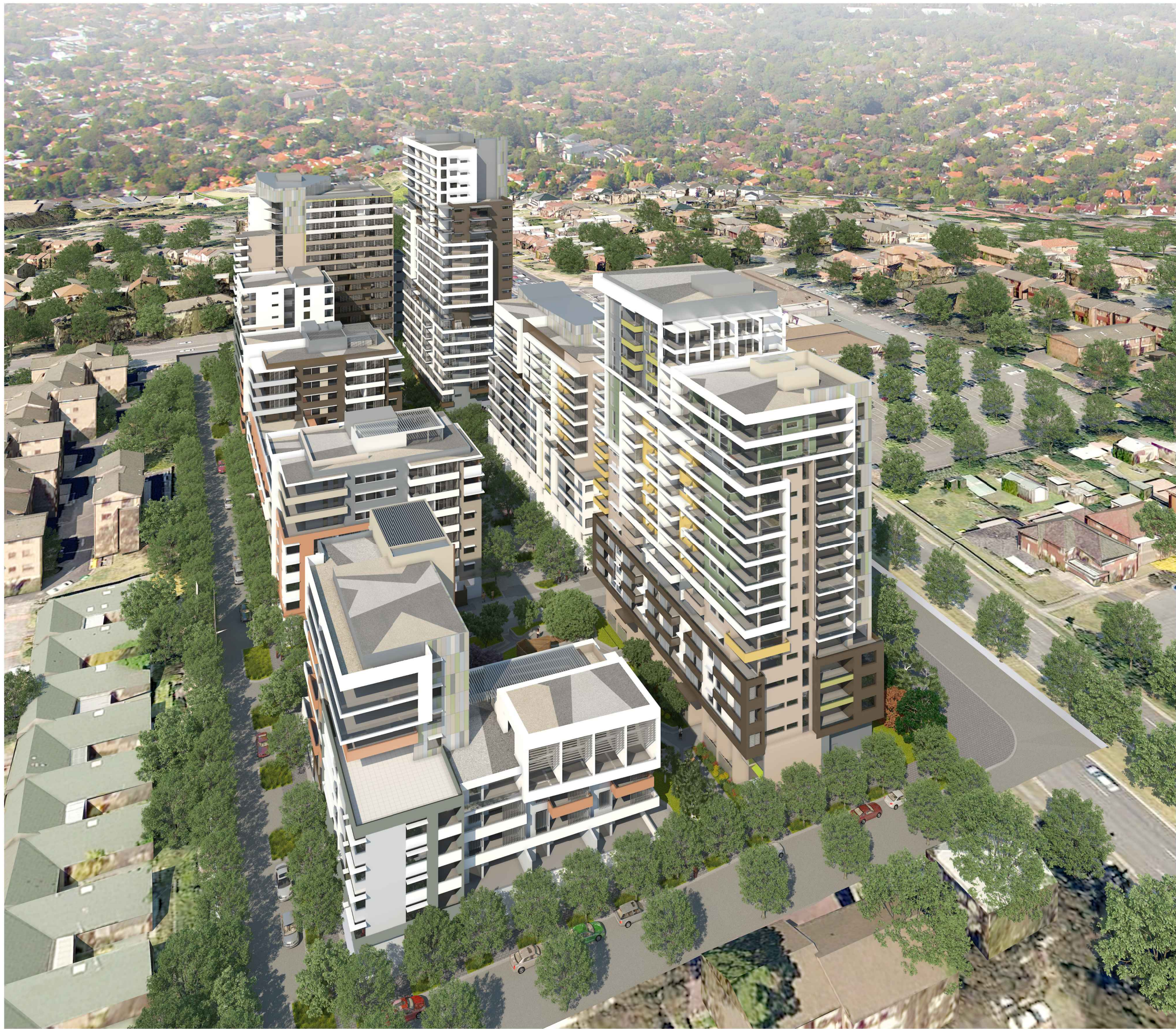
2 VIEW FROM NORTH WEST NTS