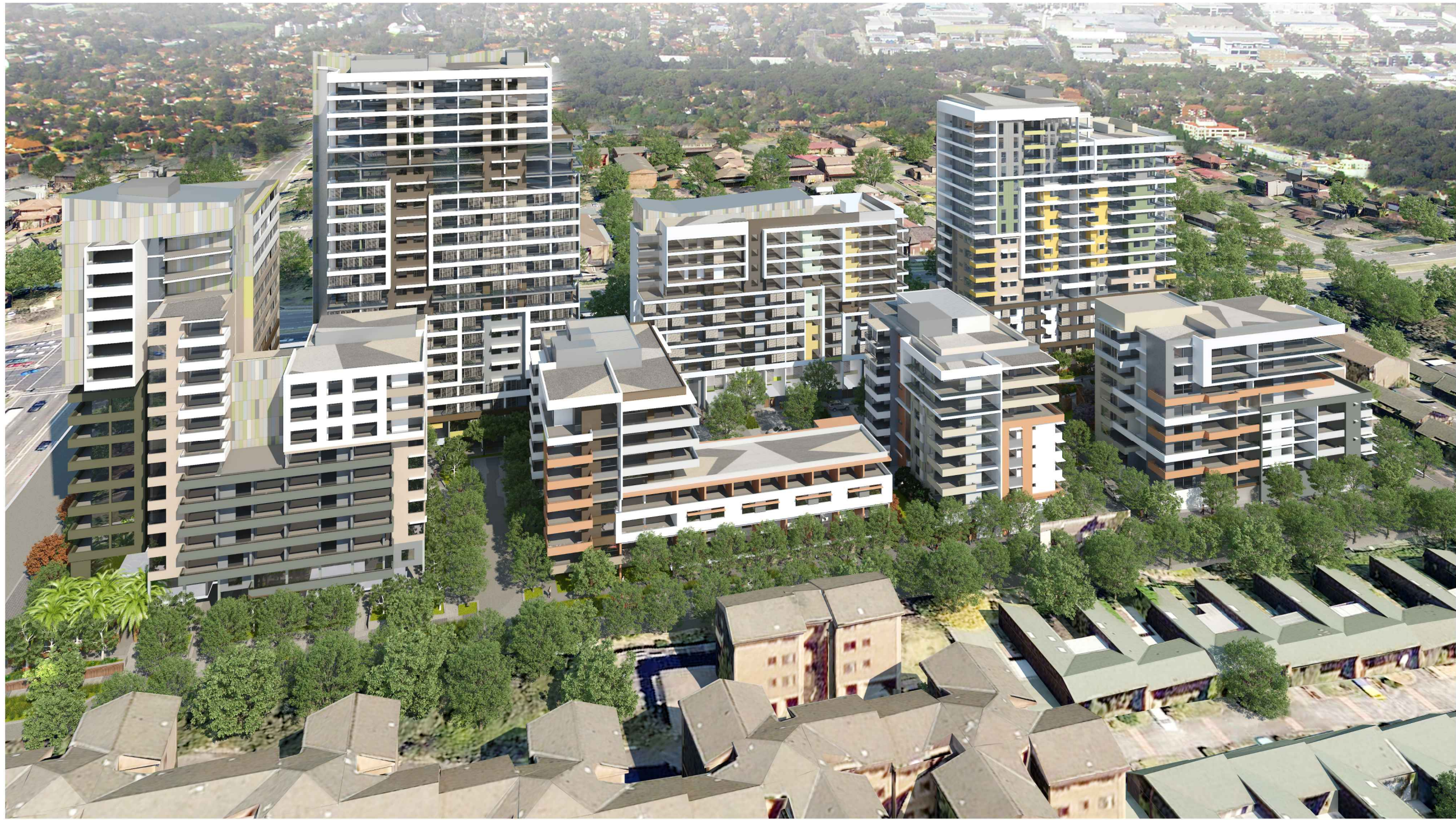
1 VIEW FROM NORTH EAST NTS