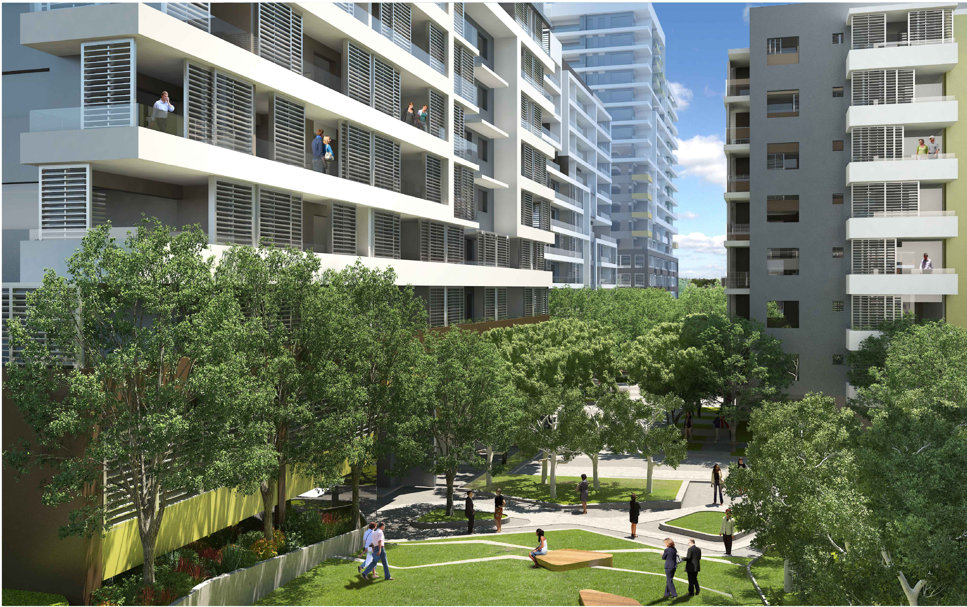
6 INTERNAL VIEW LOOKING NORTH WEST NTS