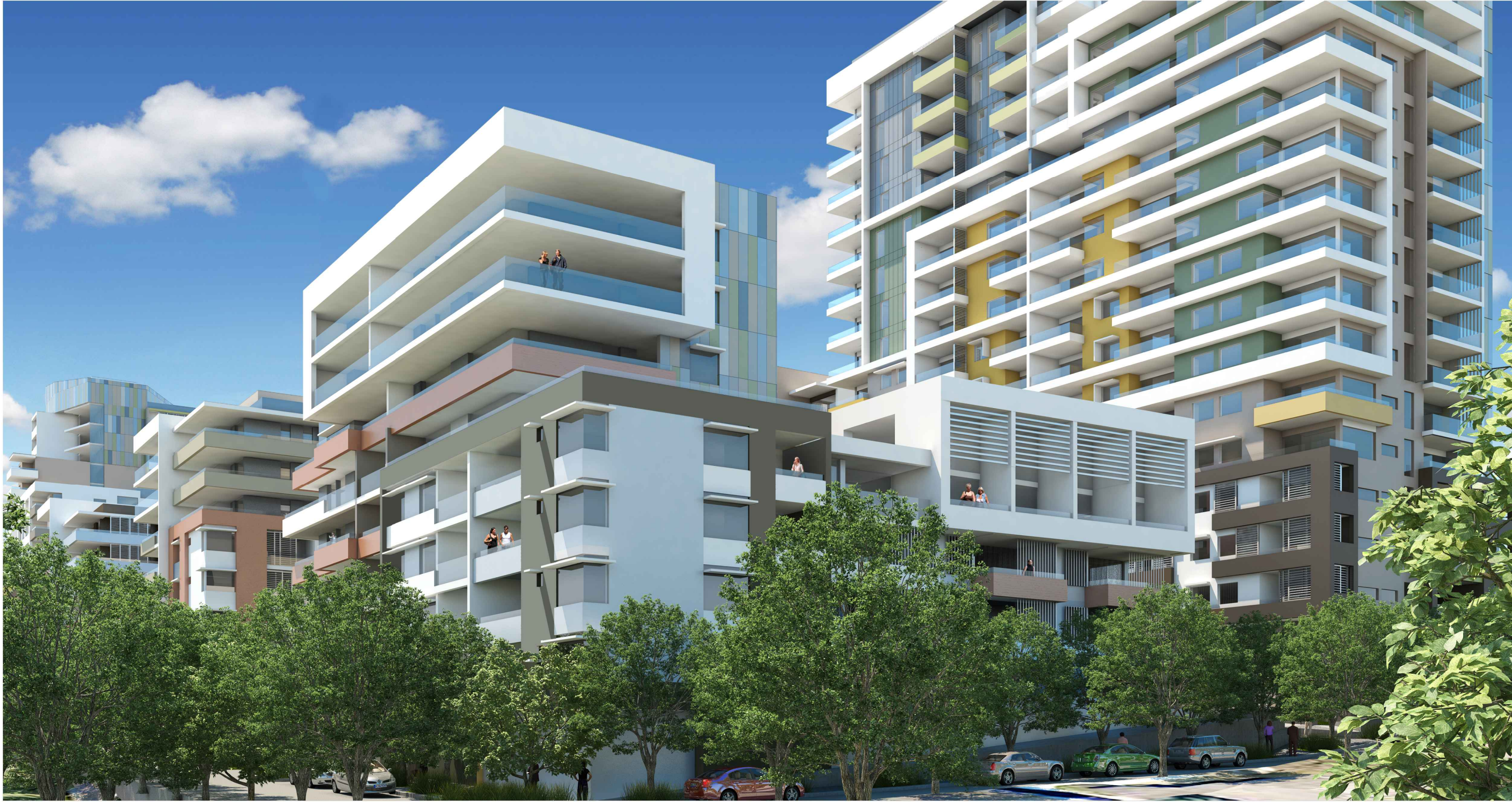
5 VIEW FROM NORTH WEST CORNER NTS