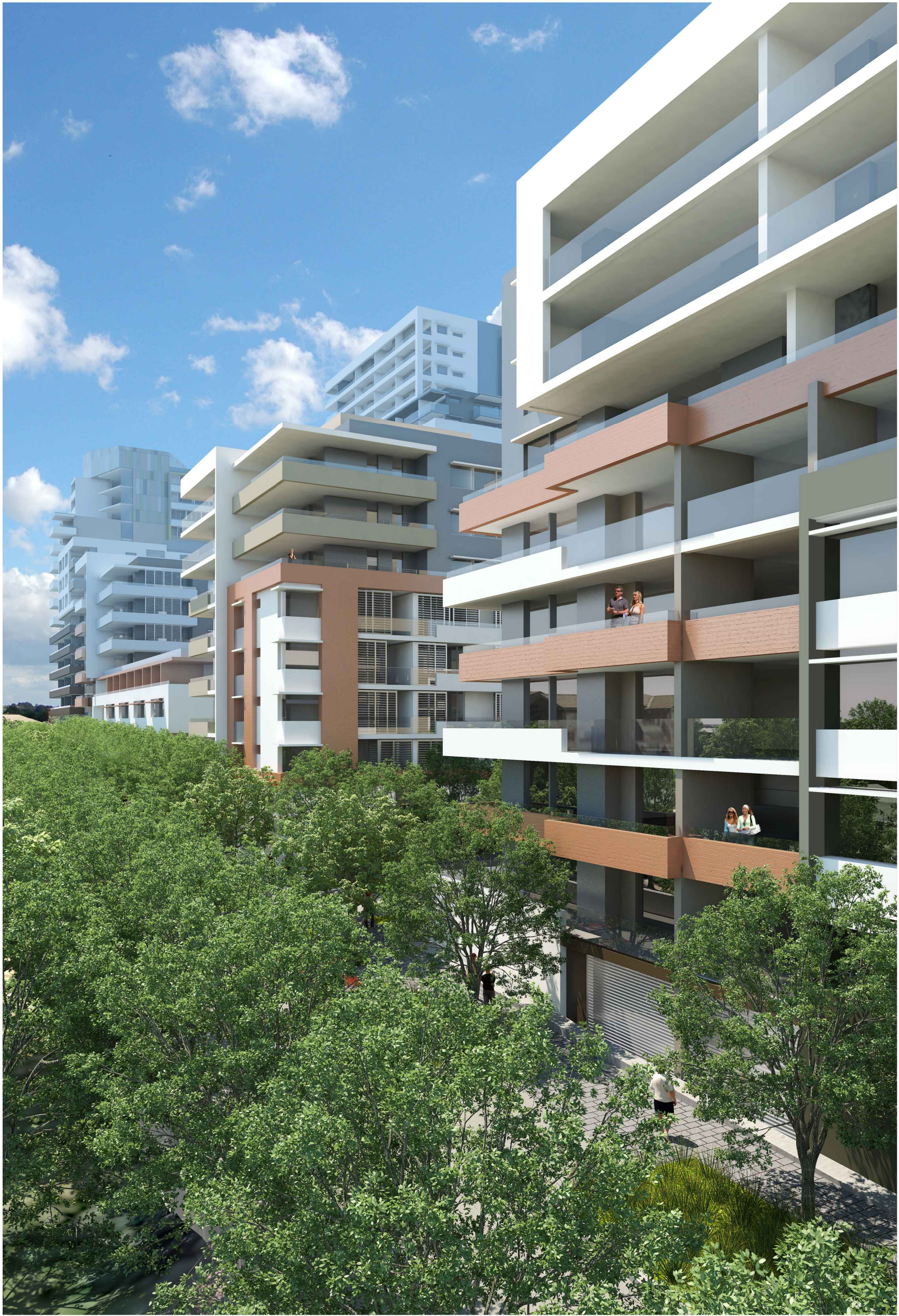
7 VIEW LOOKING ALONG PROPOSED DEDICATED ROAD NTS