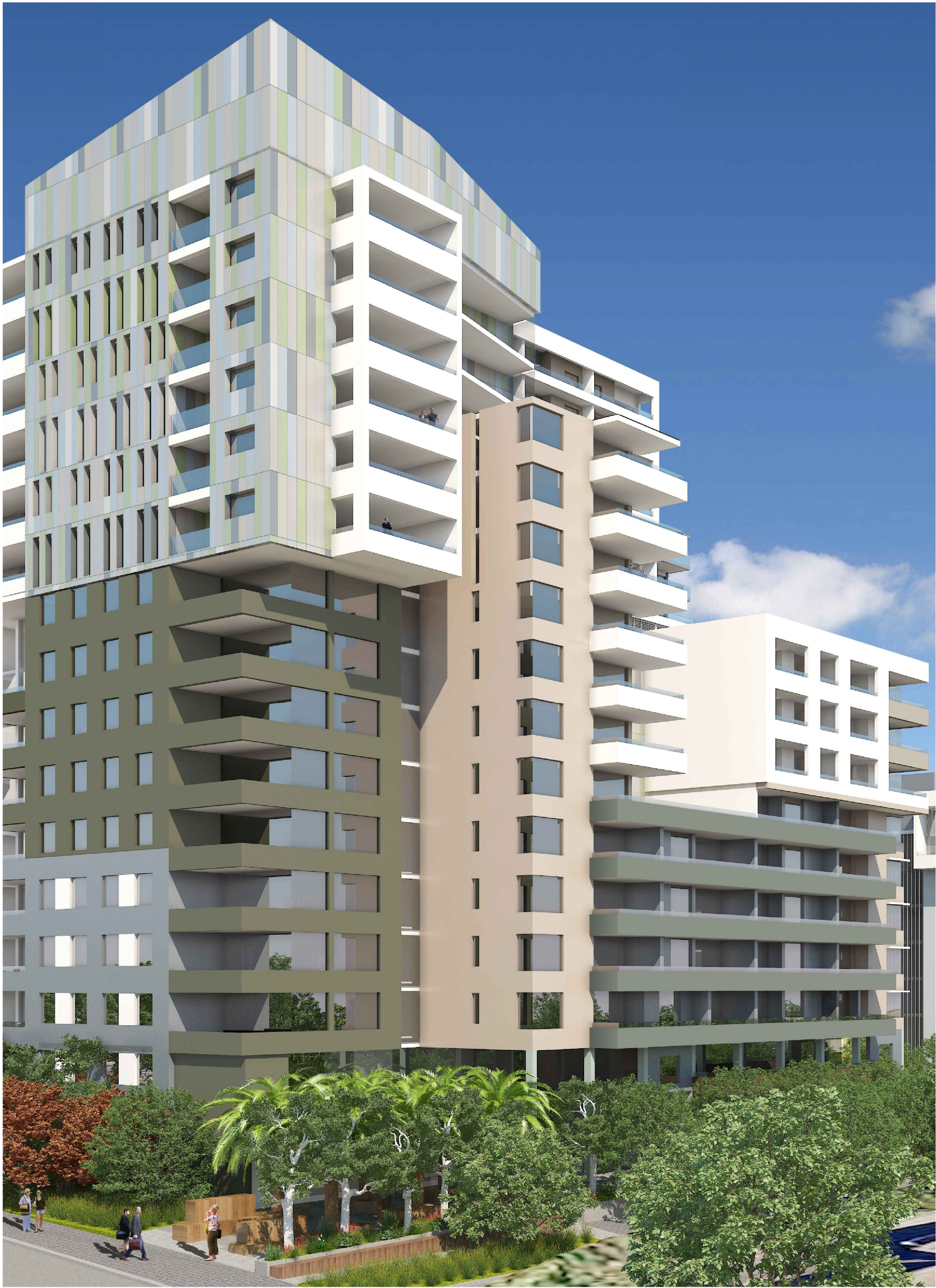
8 VIEW OF HERRING ROAD ENTRY + PLAZA NTS