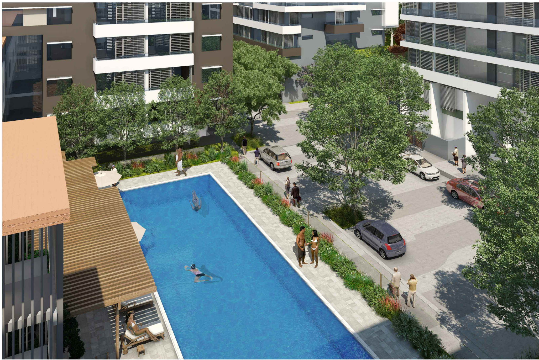
11 VIEW TO POOL GARDEN NTS