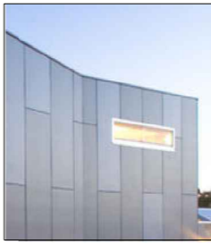
FRAMED SHEET CLADDING