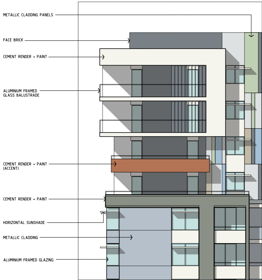
BUILDING H - PART WEST ELEVATION