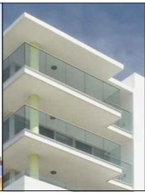
ALUMINIUM FRAMED BALUSTRADE