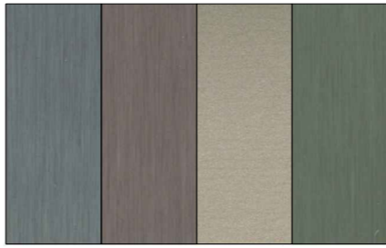
INDICATIVE METALLIC CLADDING PANEL COLOURS