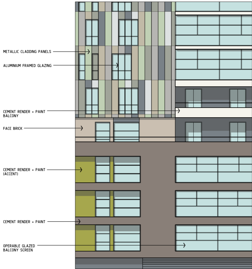
BUILDING W - PART SOUTH ELEVATION