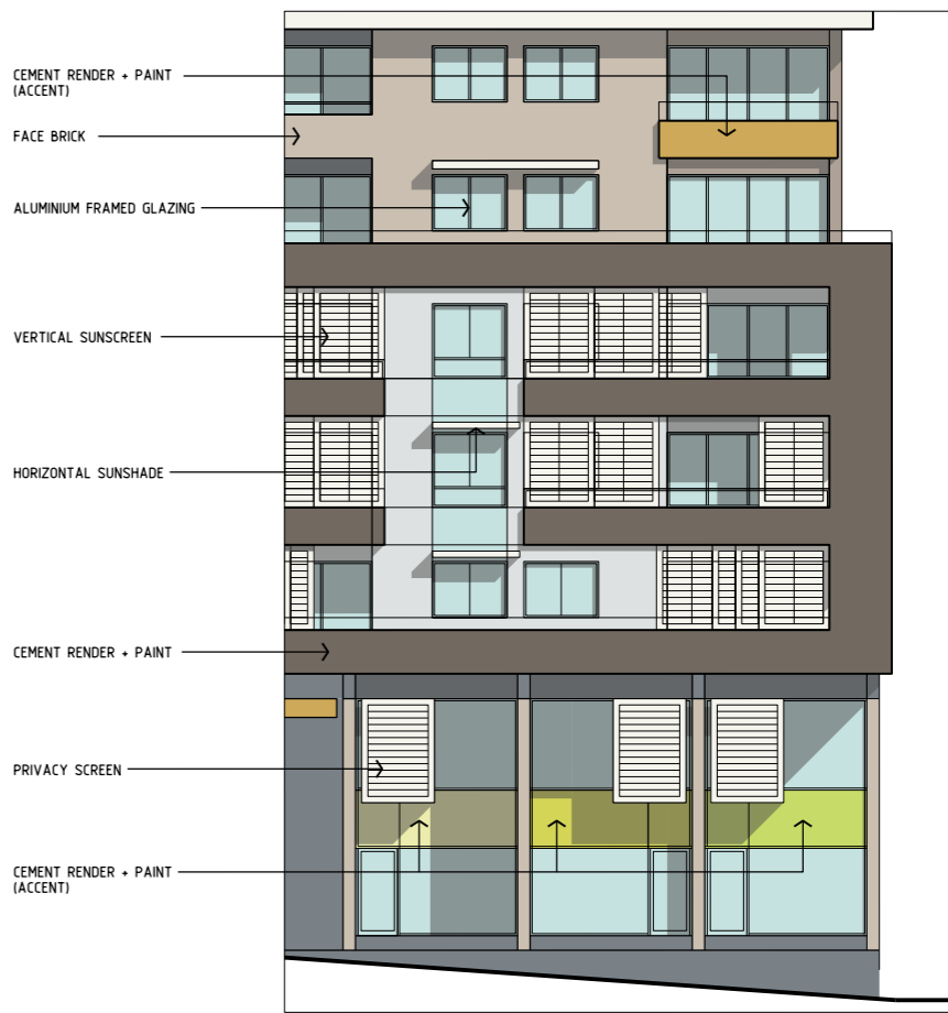
BUILDING W - PART NORTH ELEVATION