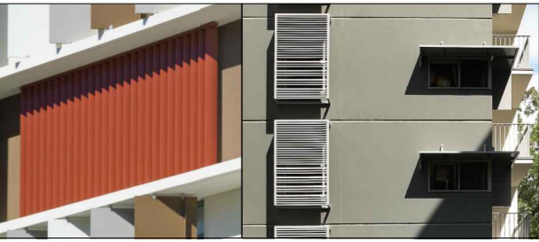
EXAMPLES OF SUNSHADES / PRIVACY SCREEN