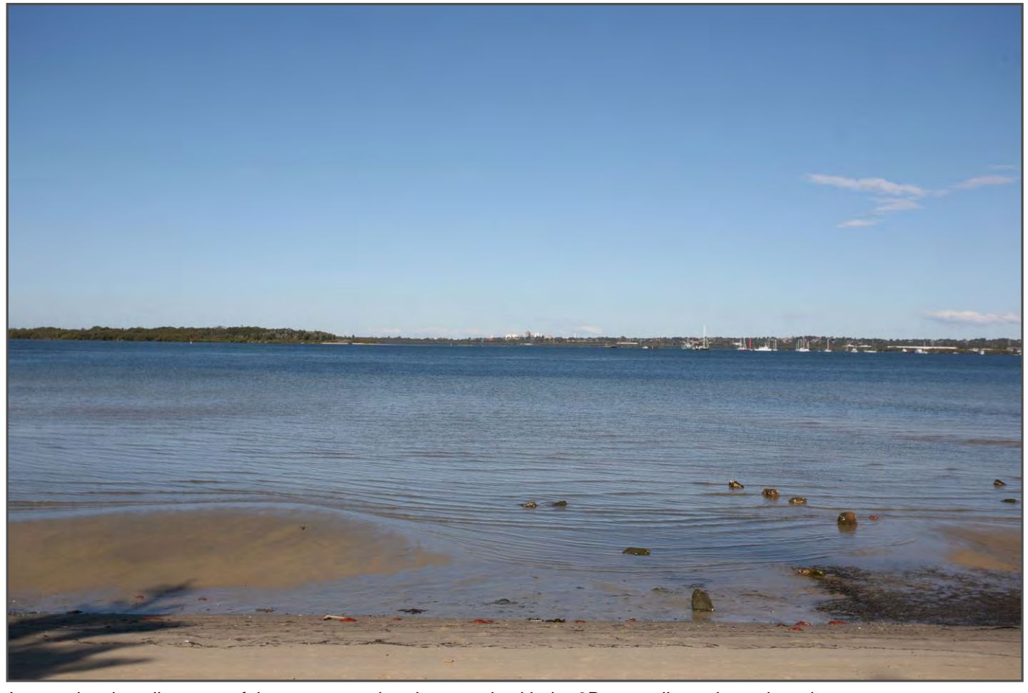
Image showing alignment of the camera to the photograph with the 3D suvey lines shown in red.

Date: 04/07/2011 12:49 PM Camera: Canon EOS 5D