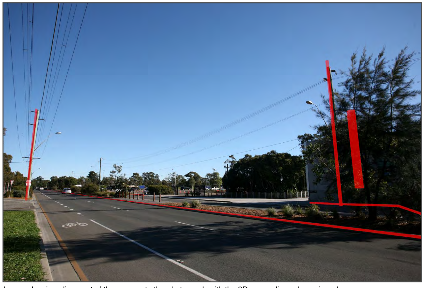
Image showing alignment of the camera to the photograph with the 3D survey lines shown in red.

Date: 09/07/2011 9:52 AM Camera: Canon EOS 5D