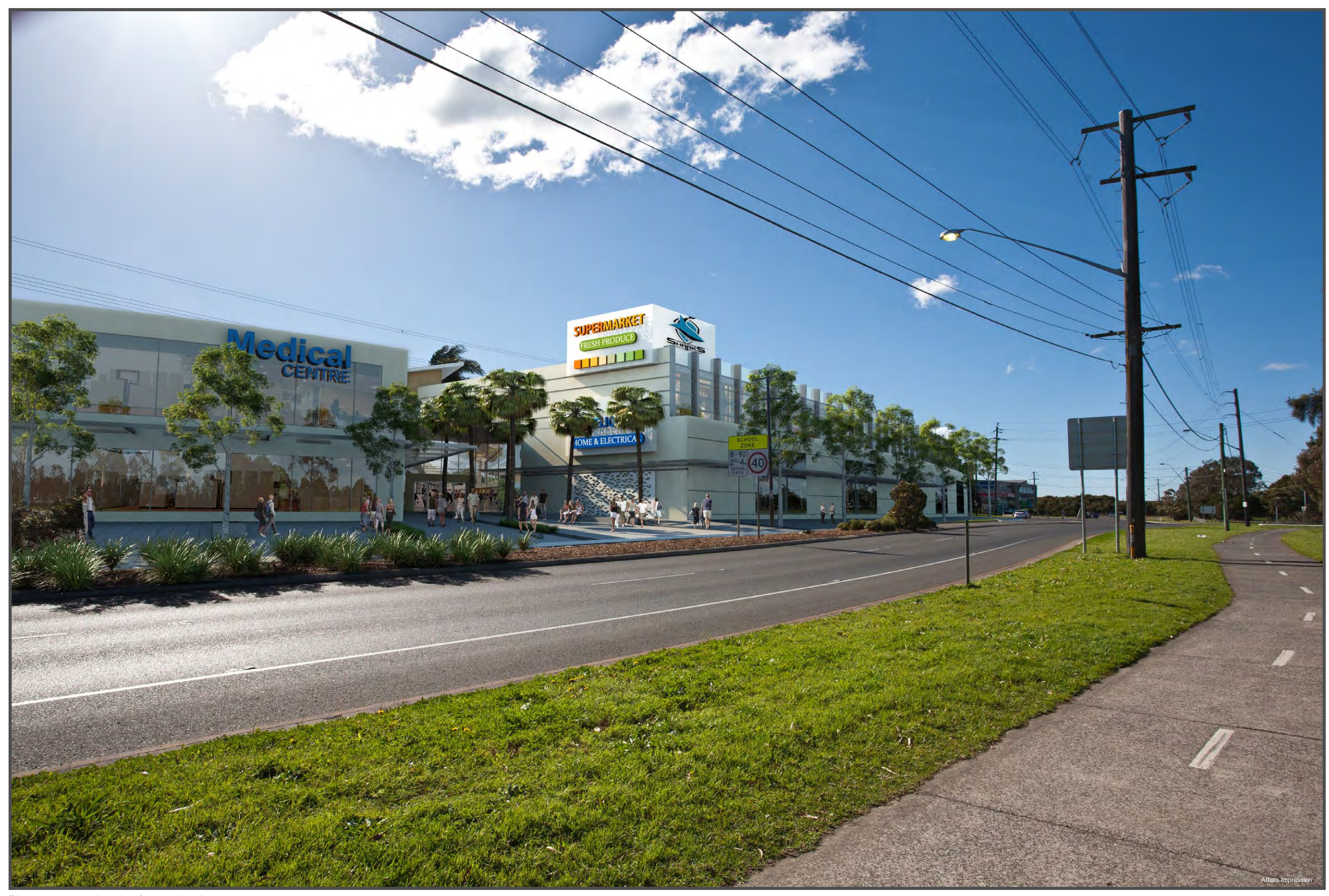
Photomontage showing future development