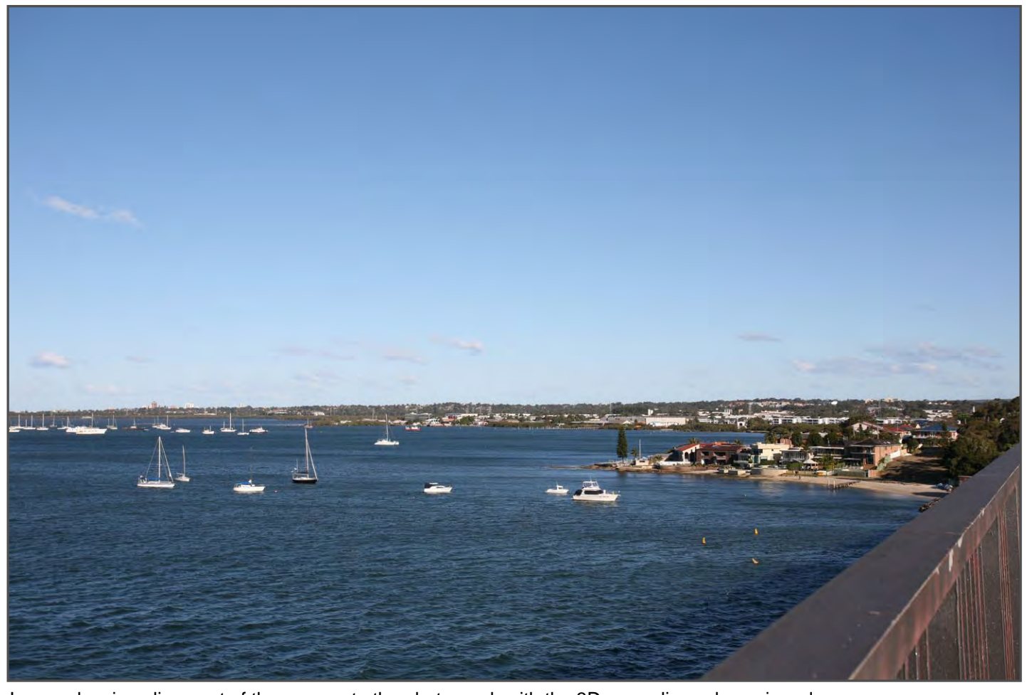
Image showing alignment of the camera to the photograph with the 3D suvey lines shown in red.

Date: 05/07/2011 2:26 PM Camera: Canon EOS 5D