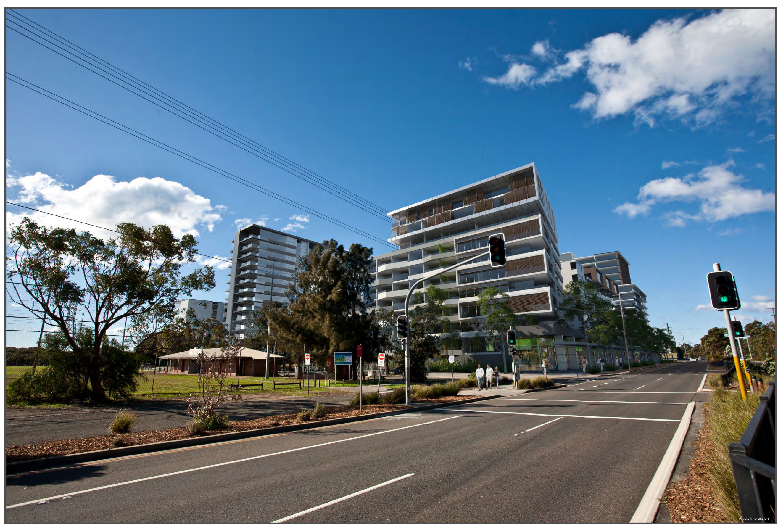
Photomontage showing future development

Cronulla Sharks Redevelopment Thursday 21st July, 2011 Page: 8