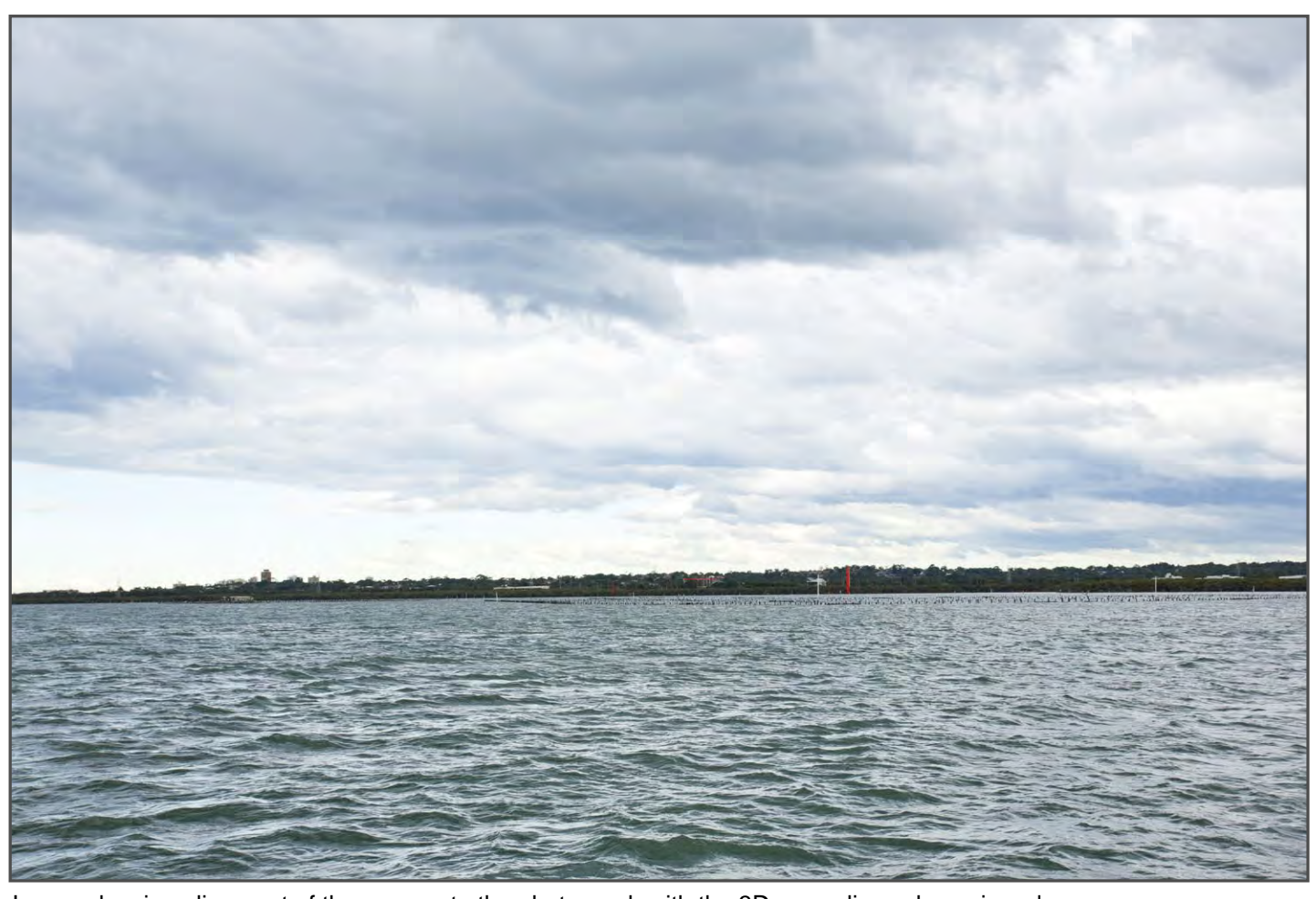
Image showing alignment of the camera to the photograph with the 3D suvey lines shown in red.

Date: 04/07/2011 1:36 PM Camera: Canon EOS 5D