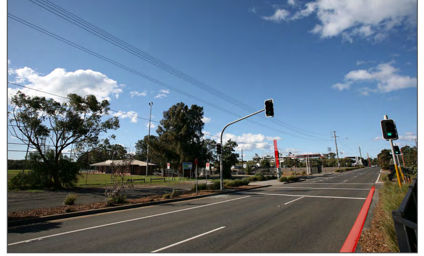
Image showing alignment of the camera to the photograph with the 3D survey lines shown in red.

Location: Captain Cook Drive - Surveyed point on kerb