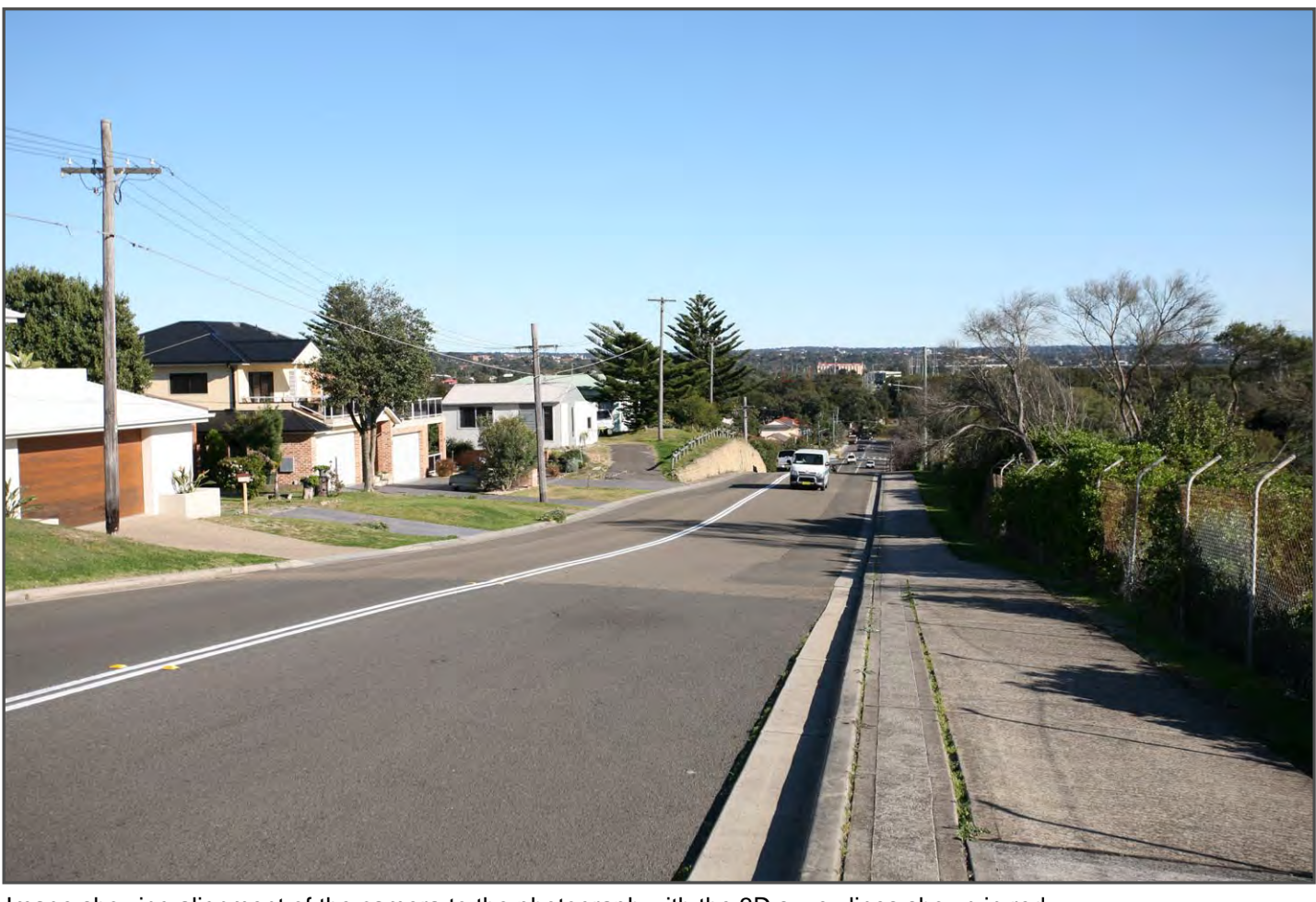
Image showing alignment of the camera to the photograph with the 3D suvey lines shown in red.

Date: 09/07/2011 10:04 AM Camera: Canon EOS 5D