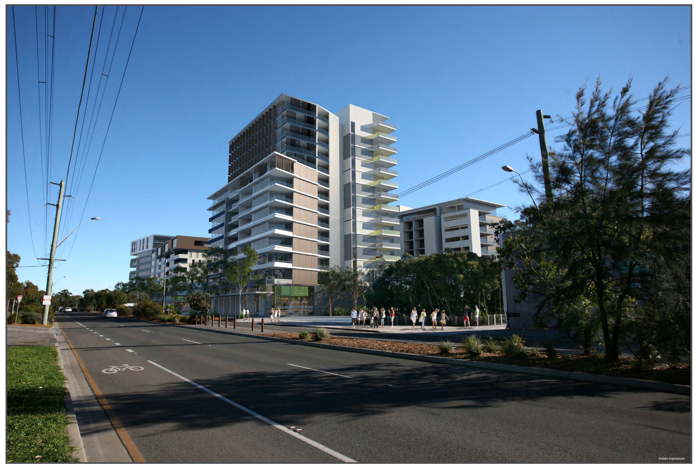
Photomontage showing future development