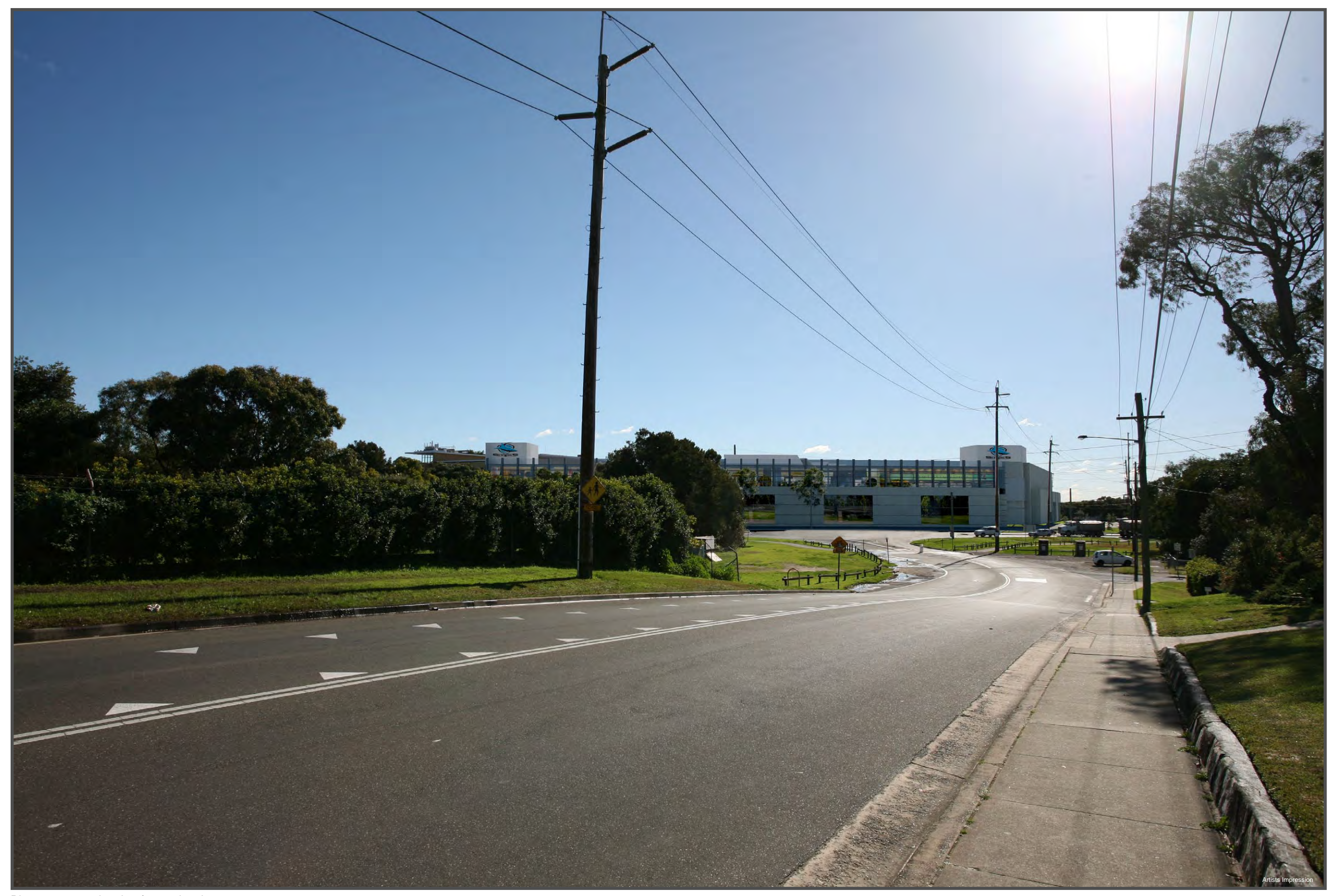
Photomontage showing future development