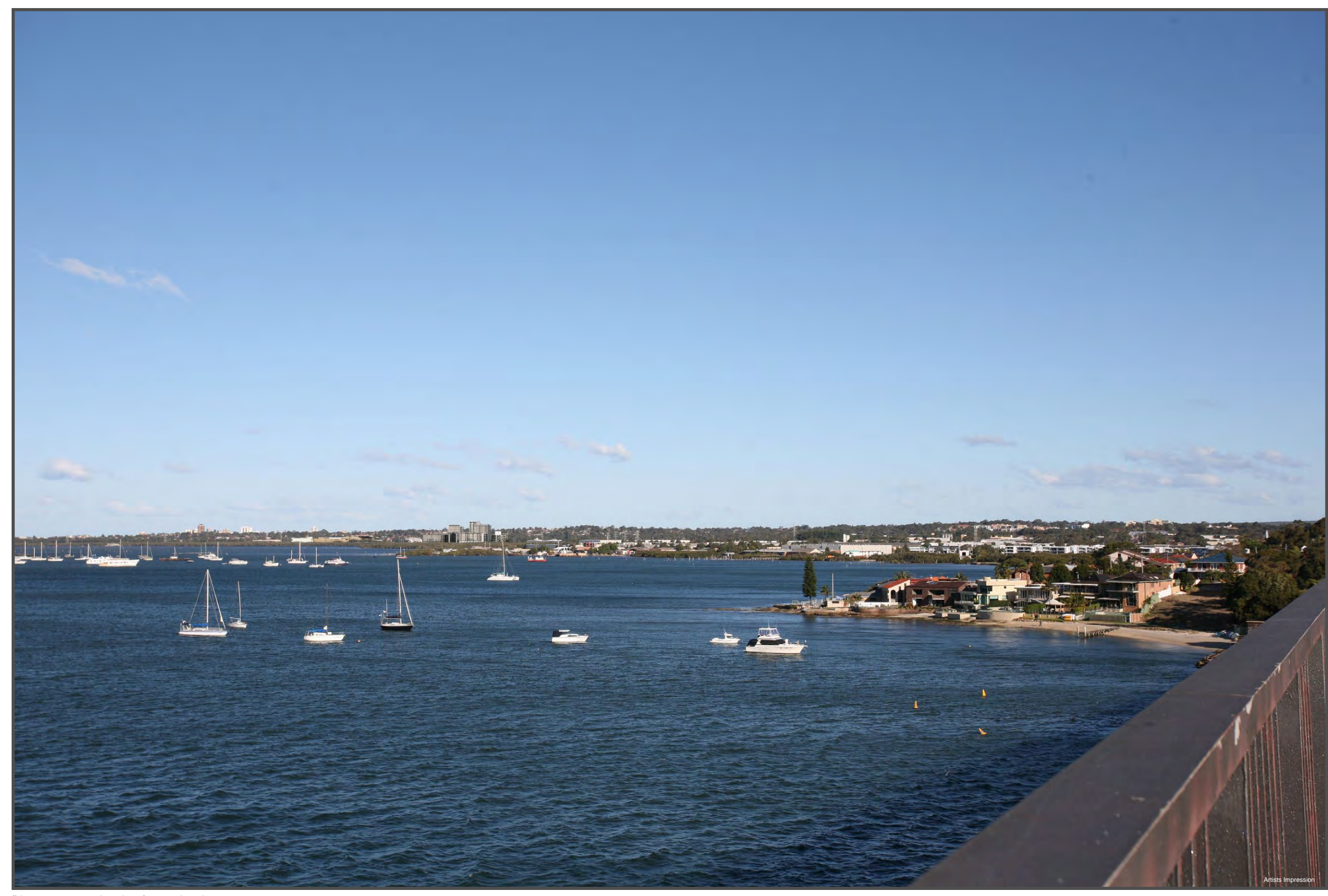
Photomontage showing future development