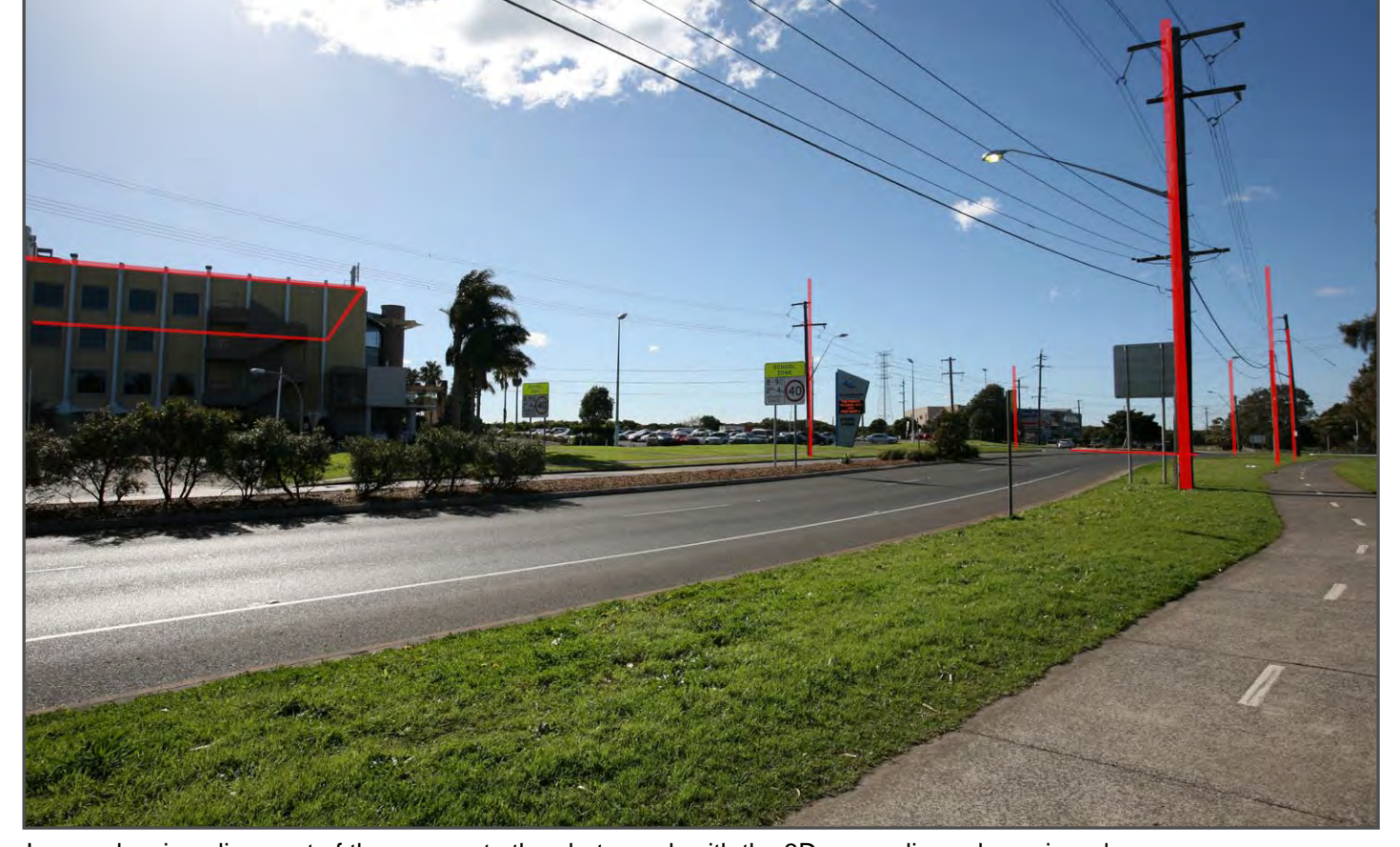
Image showing alignment of the camera to the photograph with the 3D survey lines shown in red.

Location: Captain Cook Drive - Surveyed point on footpath