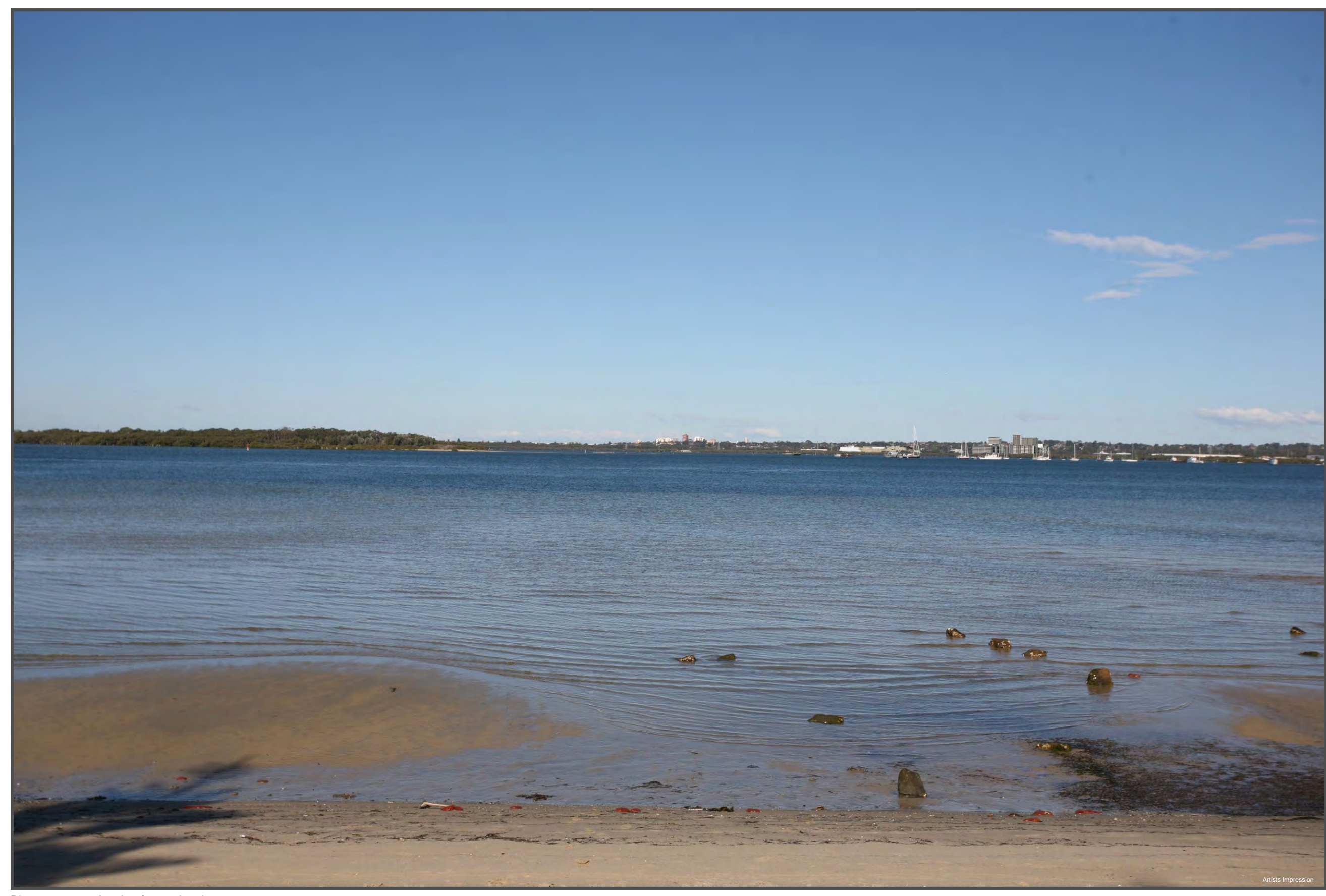
Photomontage showing future development