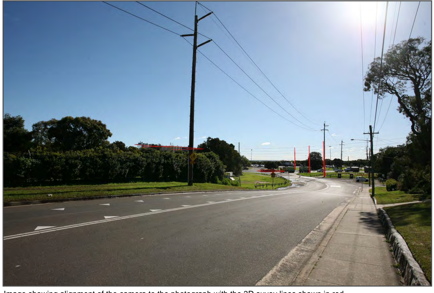
Image showing alignment of the camera to the photograph with the 3D suvey lines shown in red.

Date: 05/07/2011 11:27 AM Camera: Canon EOS 5D