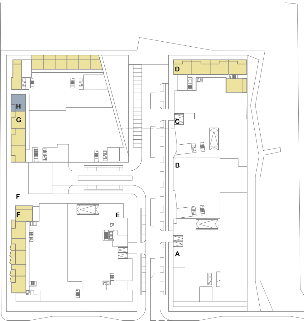
Lower Ground Level 01