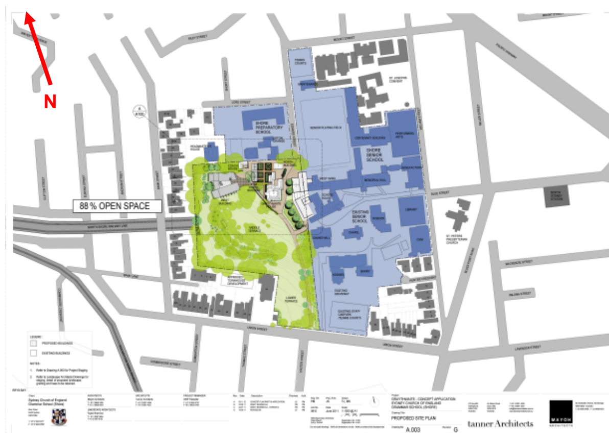
Figure 2 Proposed Site Plan

Figure 2 shows the proposed concept plan and the proposed buildings.