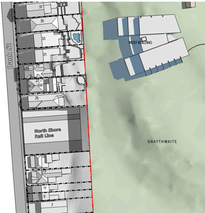
DECEMBER 21 9am