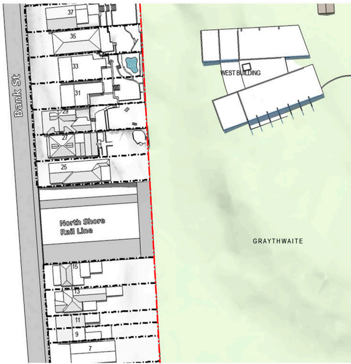
DECEMBER 21 12noon