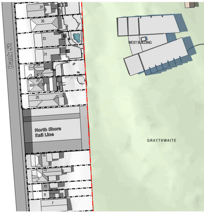
DECEMBER 21 3pm