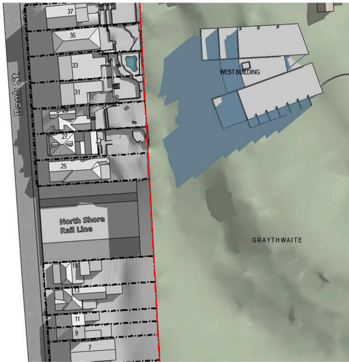
MARCH 21 9am