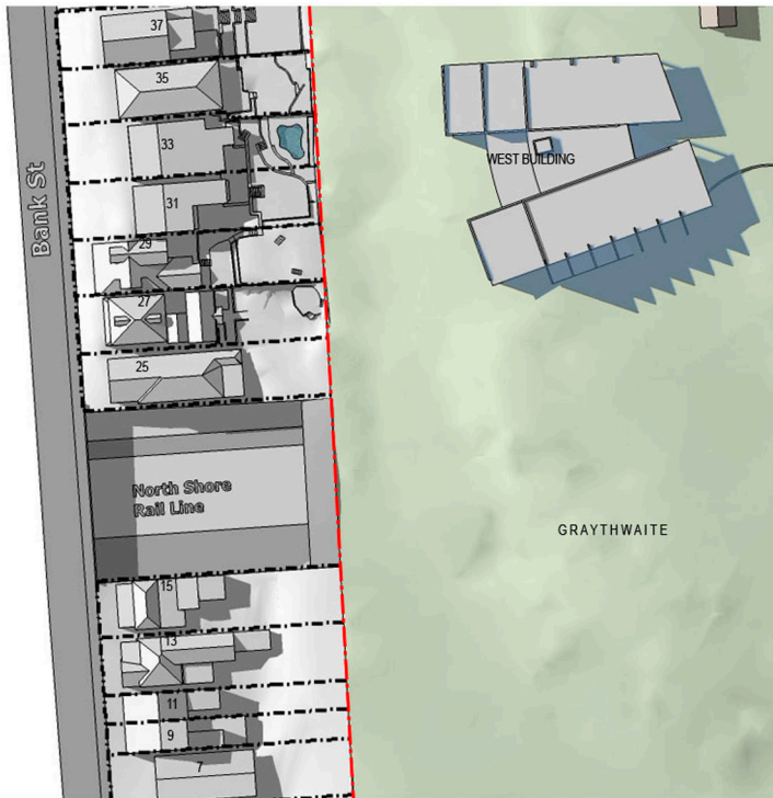
MARCH 21 3pm