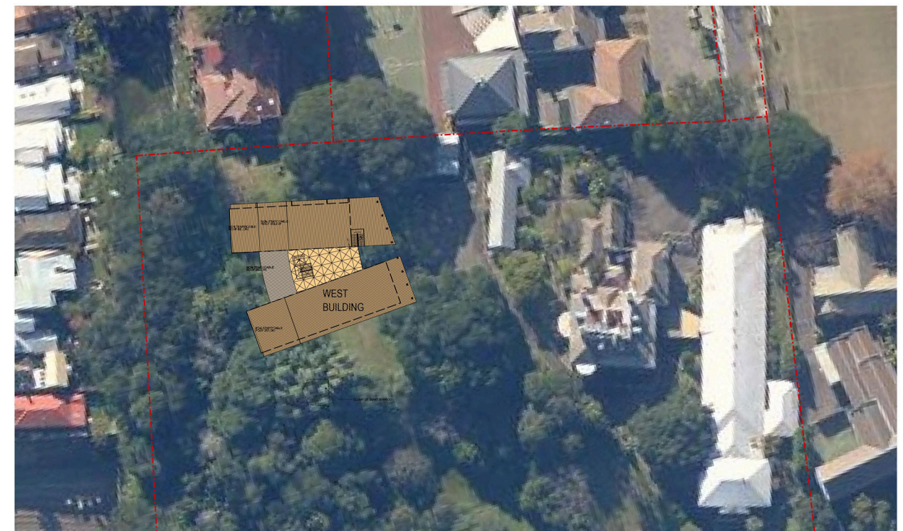
Aerial Photo with Proposed West Building Overlay

LEGEND: Difference Between Revision A and Revision G