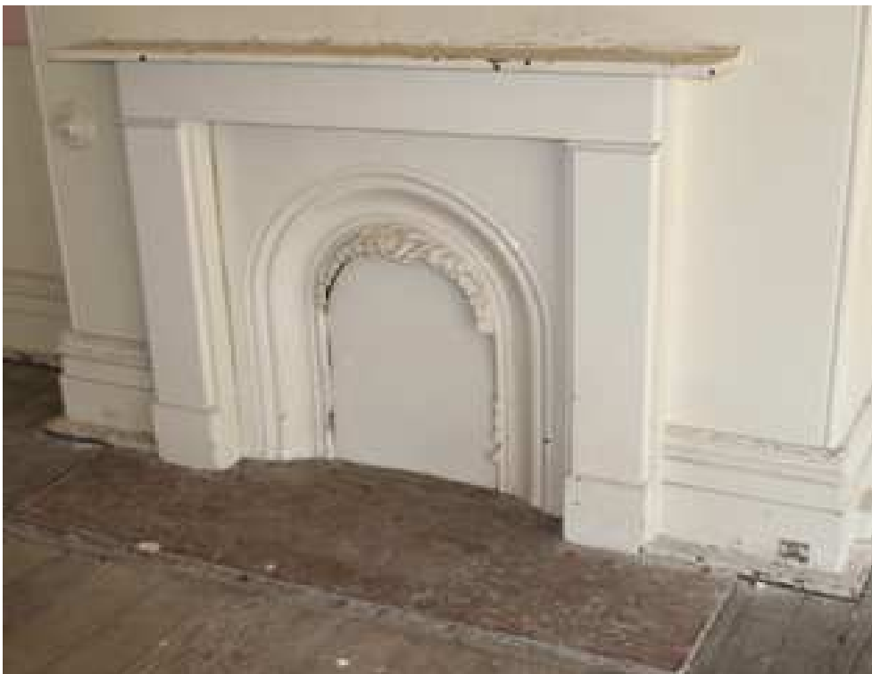
Room F3, fireplace