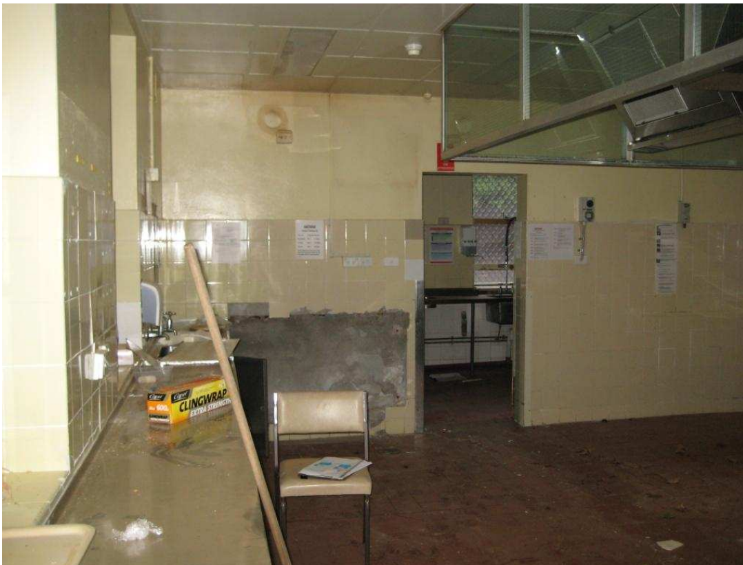
Room G7, looking north.