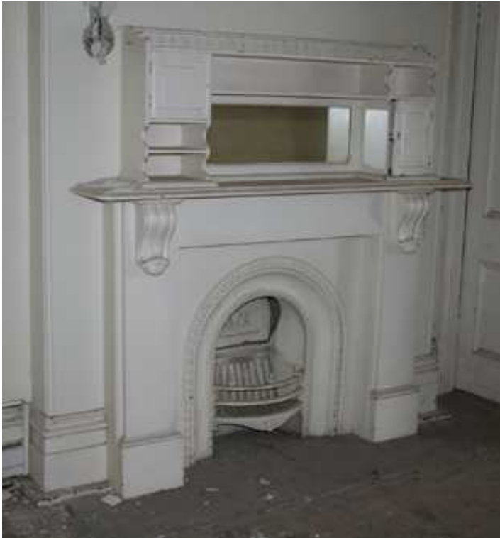
Room F8, fireplace