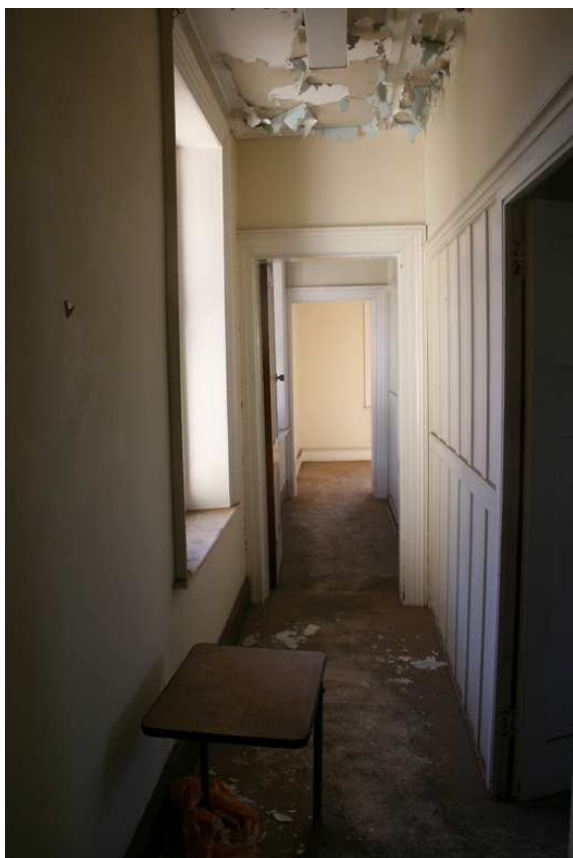
Room F10A. Looking north. The 1924 timber partitions and mid-twentieth century upper level infill are at right.