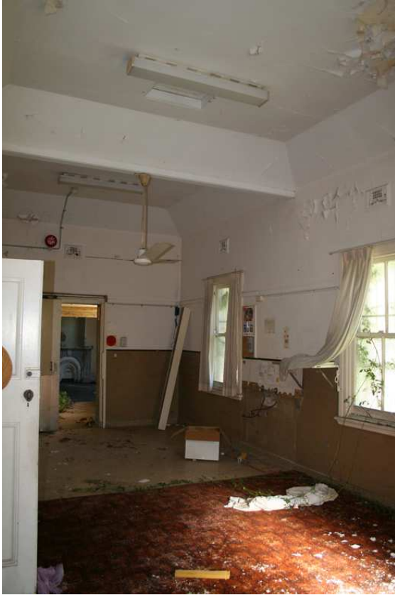
Room G8, looking south.