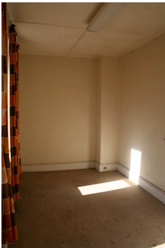
Room F12, looking east