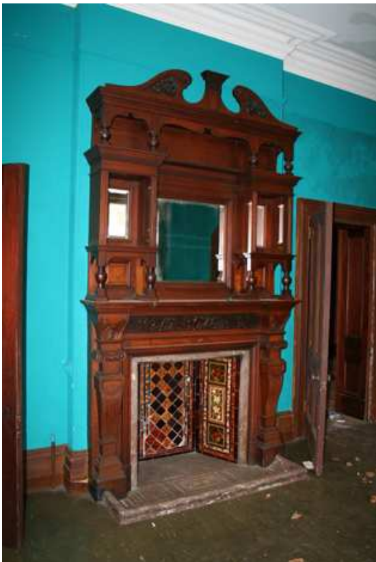
Room G6: Fireplace FP G6a