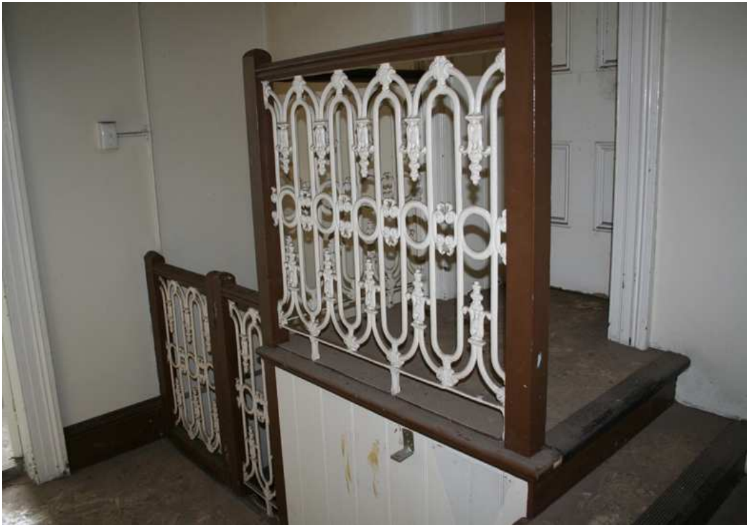
Room F14., stair 4 and stair 2