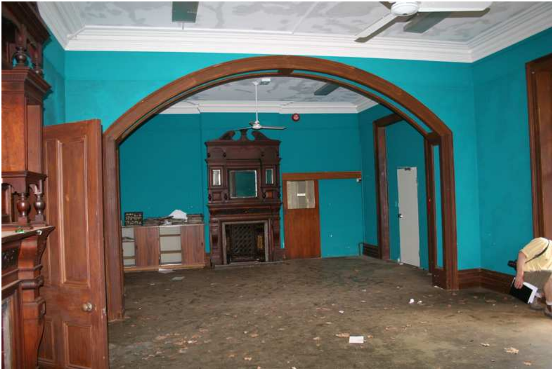
Room G6, looking north