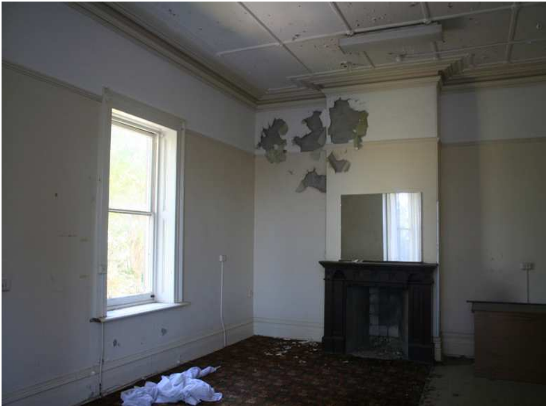
Room G1 looking north