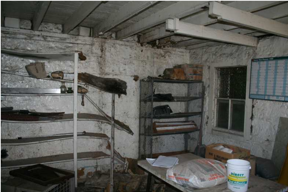
Room 19A, looking north-west