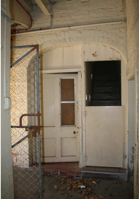
Room G16 looking at DG16.1 (left) and Stair 2 (at right behind door).