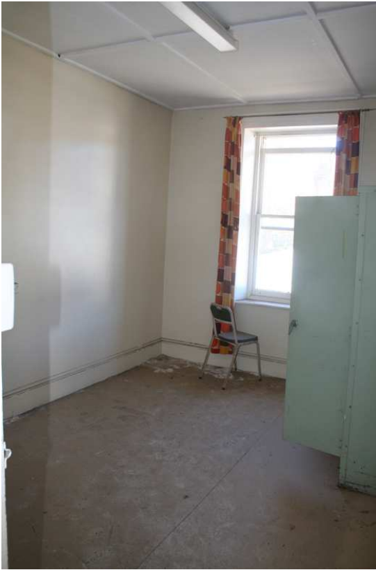
Room F11, looking east.