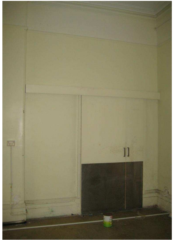
Room G3 looking north-west to the later doorway.