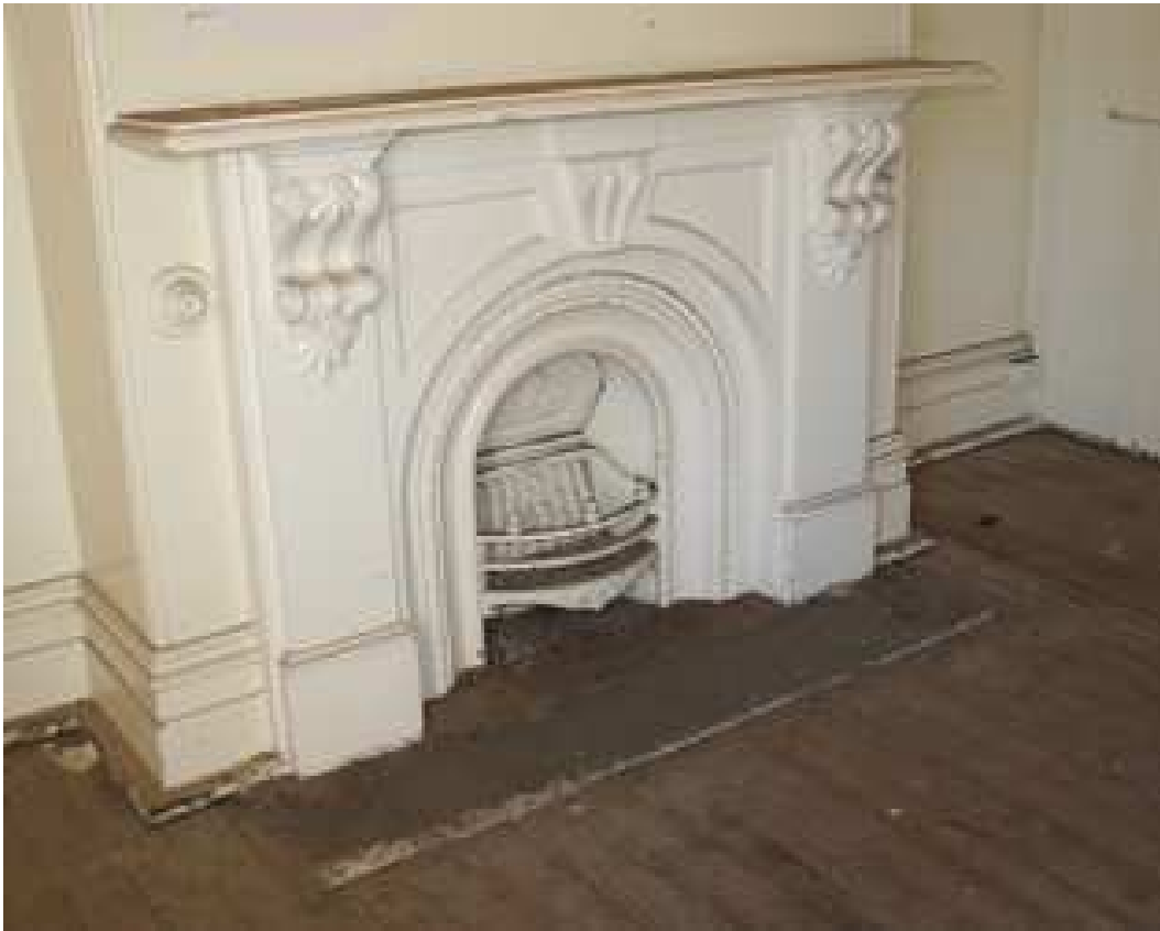
Room F2, fireplace