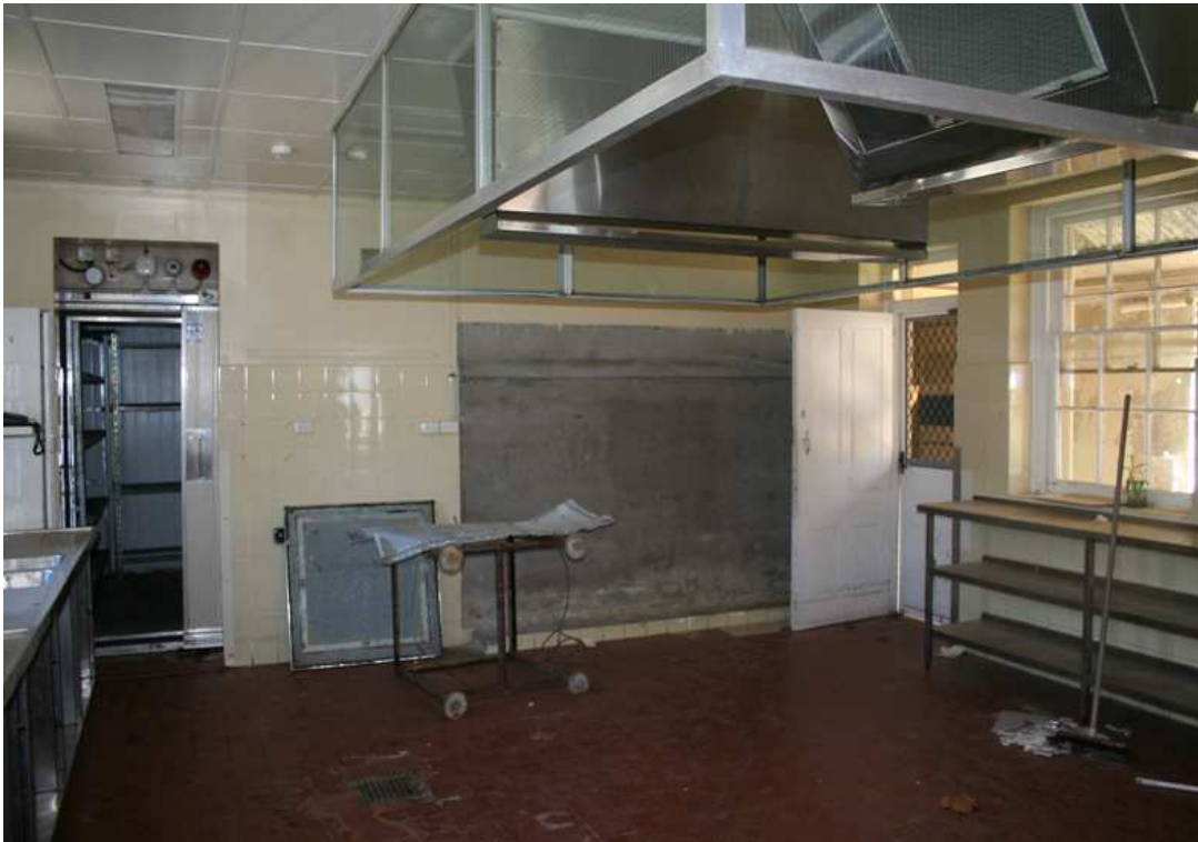
Room G7, looking south.