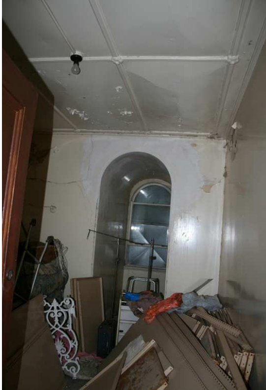
Room A4 looking east