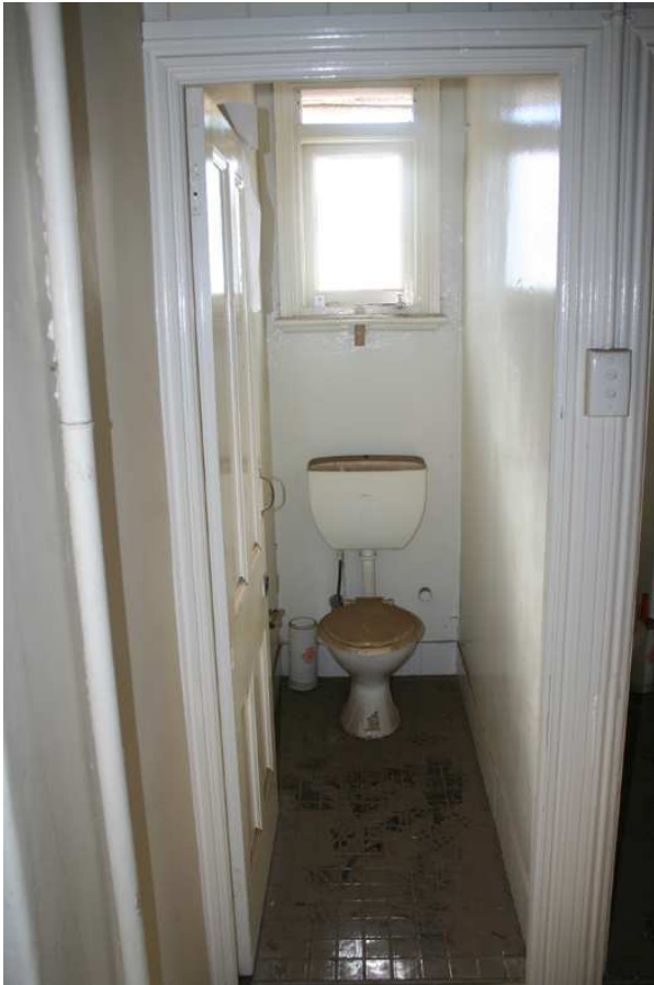
Room F14. Looking north