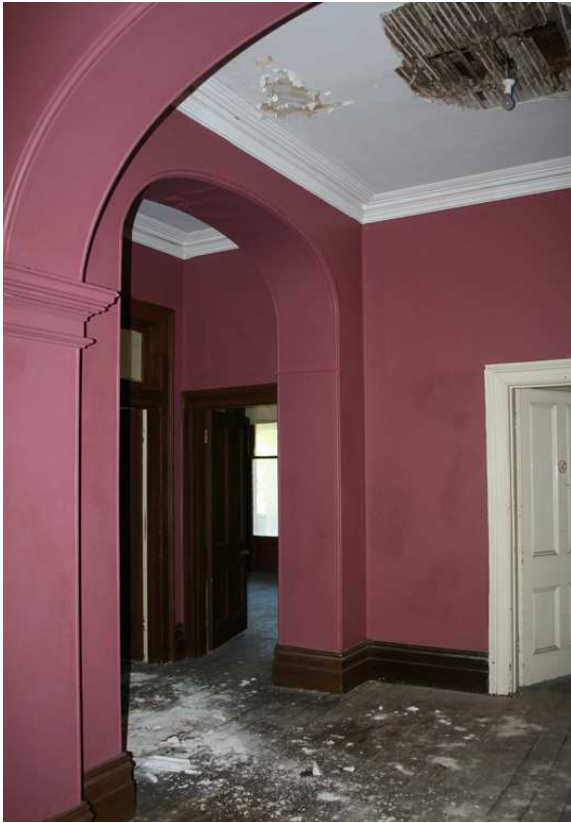
Room F9 looking south-west