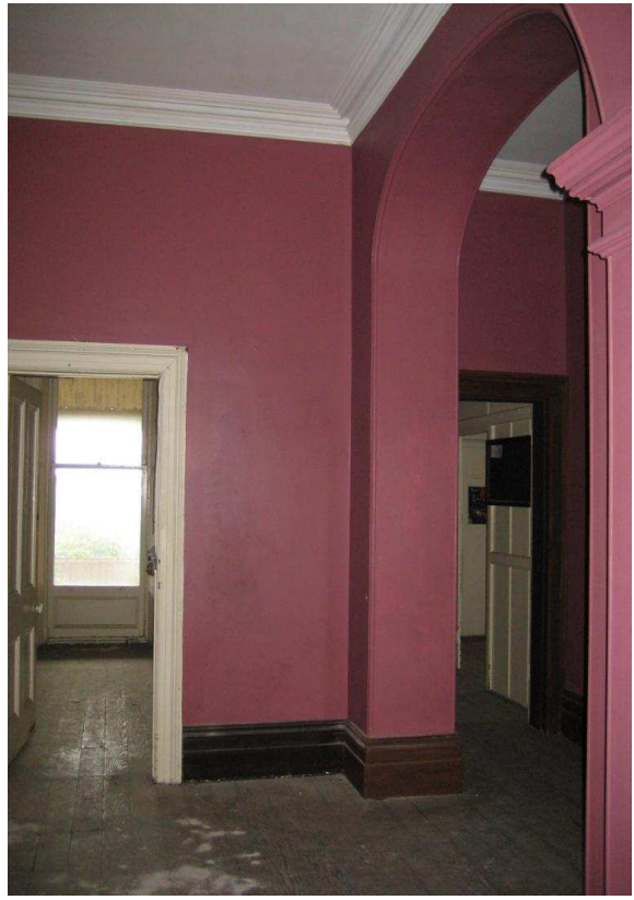
Room F9 looking south