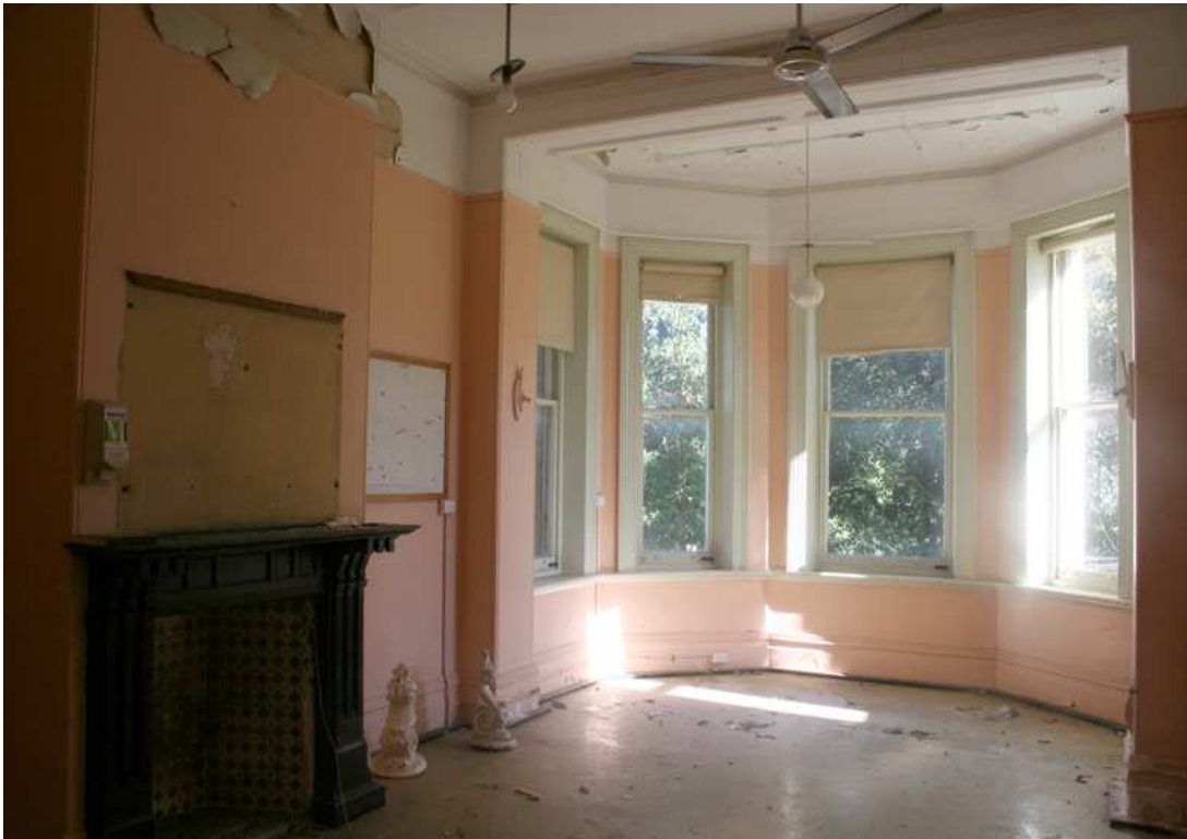
Space G2. Looking west