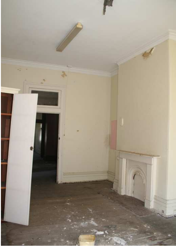
Room F3, looking east