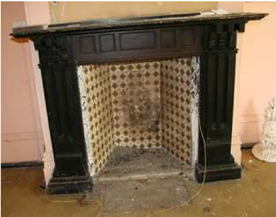
Room G2. Fireplace