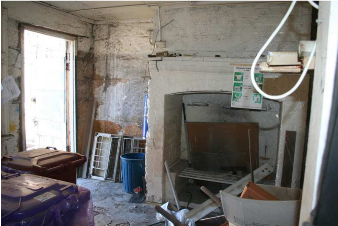
Room 19B, looking south