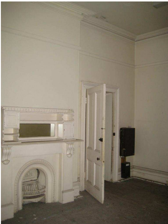
Room F8, looking north-east