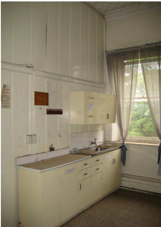
Room F2, looking south-west