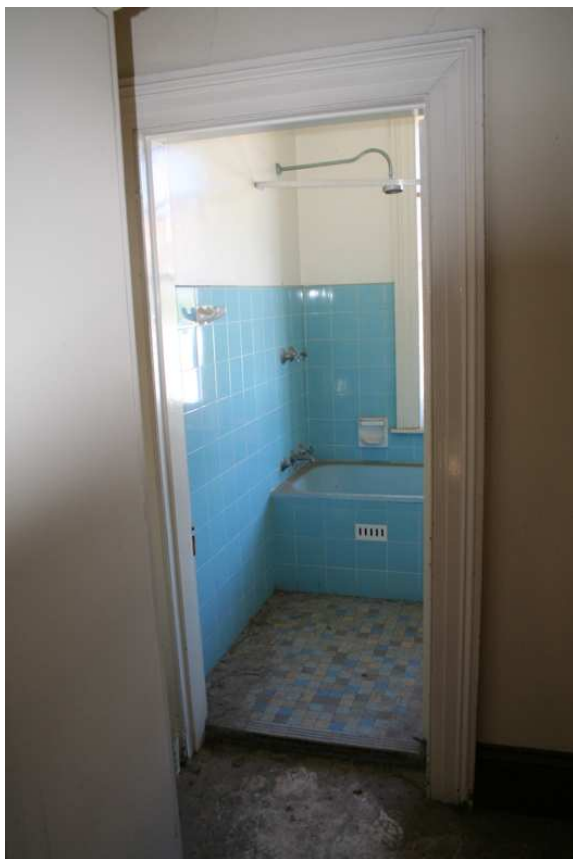
Room F13. Looking east into the bathroom.