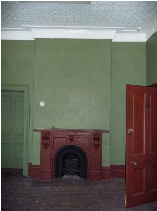
Room F6, looking west.