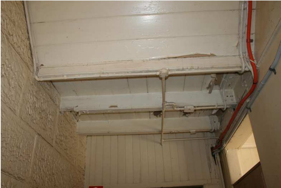
Room G15. Looking at soffit of Stair 3