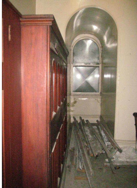
Room A1 with early joinery on the left