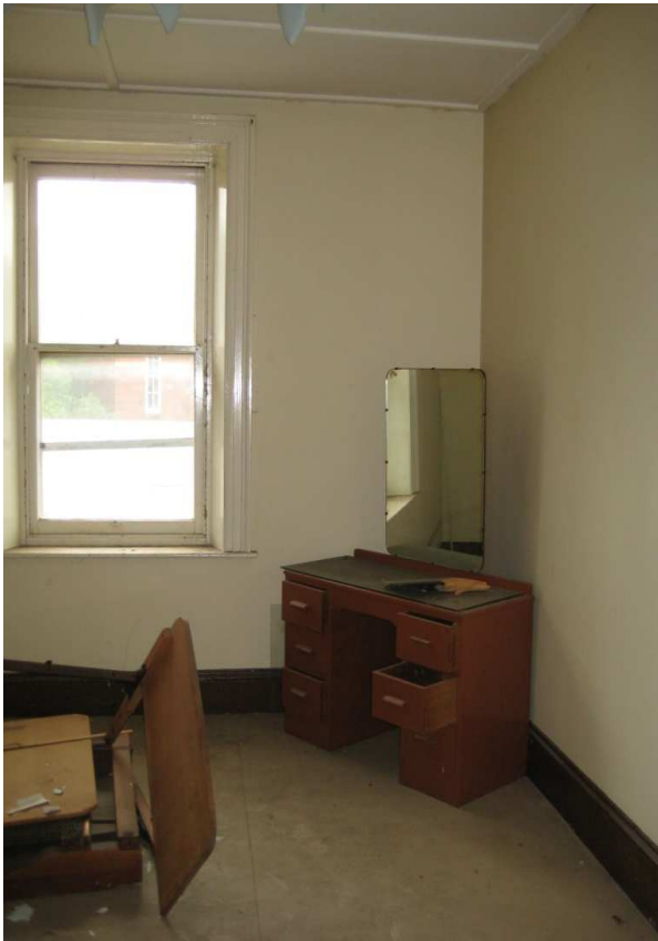
F10, looking east.