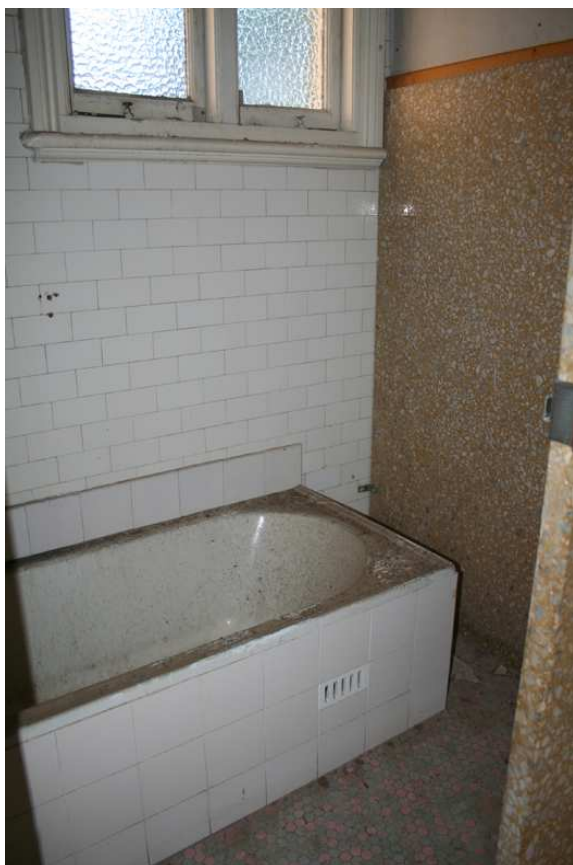
Room F16. Looking west