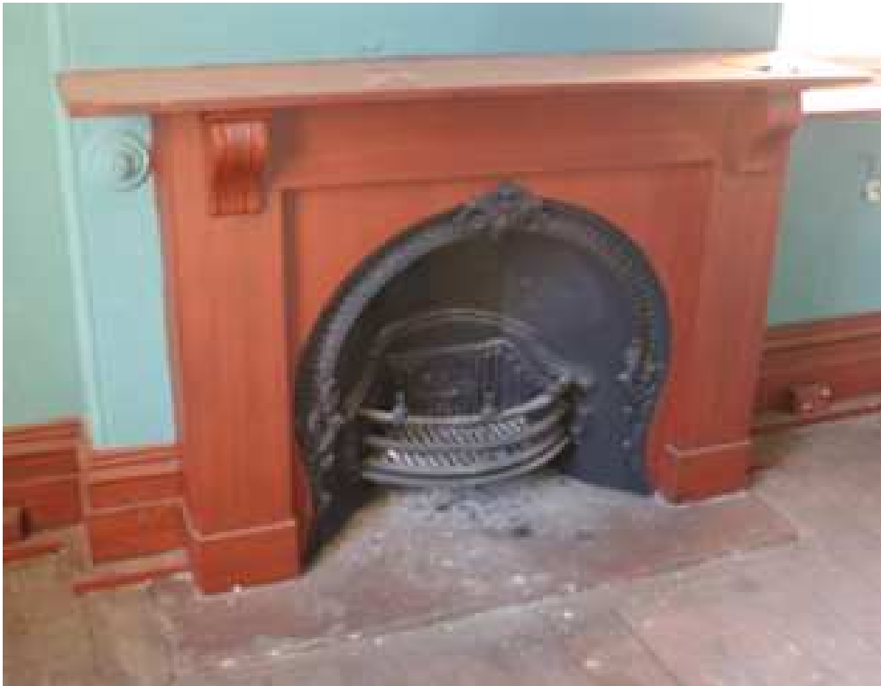
Room F4, fireplace