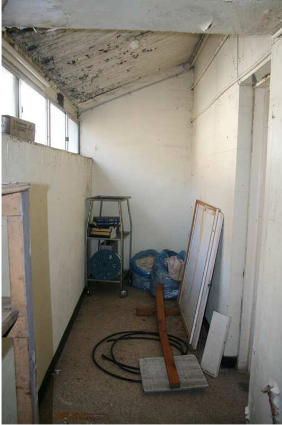
Room G18—looking south towards infill wall. Entry to the former massage room is at right.