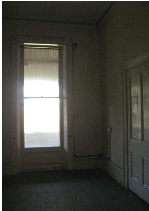
Room F5 looking south to the verandah