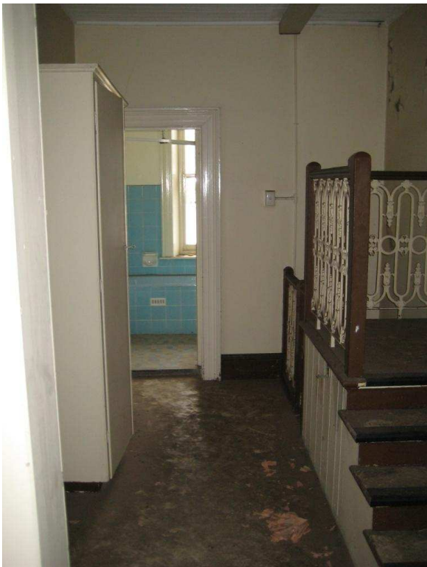
Room F14, looking east.