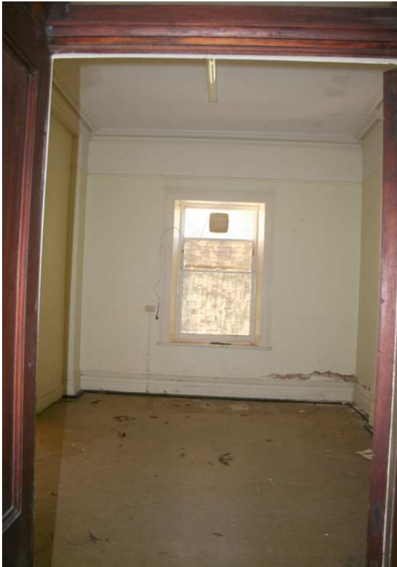
Room G3 looking west.