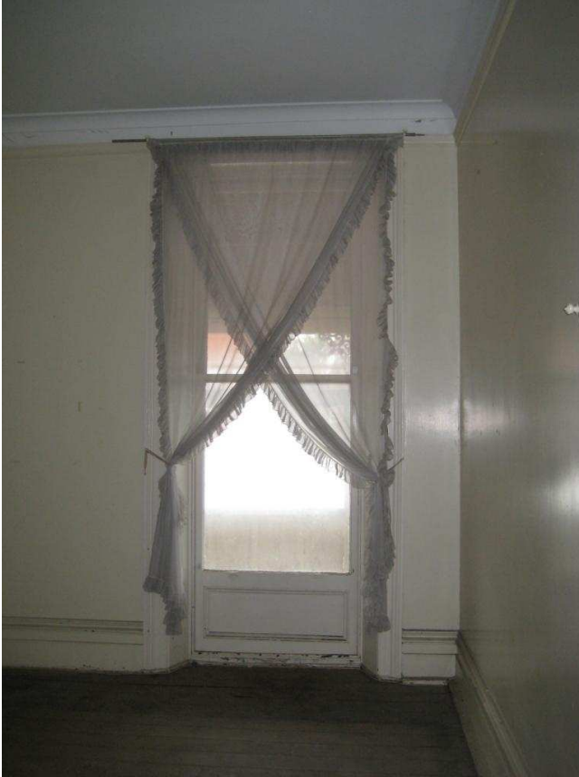
Room F7, looking east.