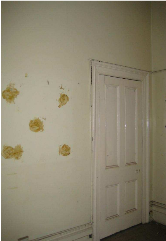
Room F5 looking southeast