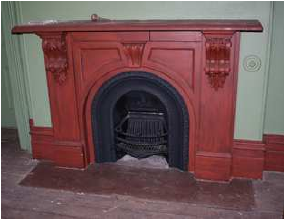
Room F6, fireplace