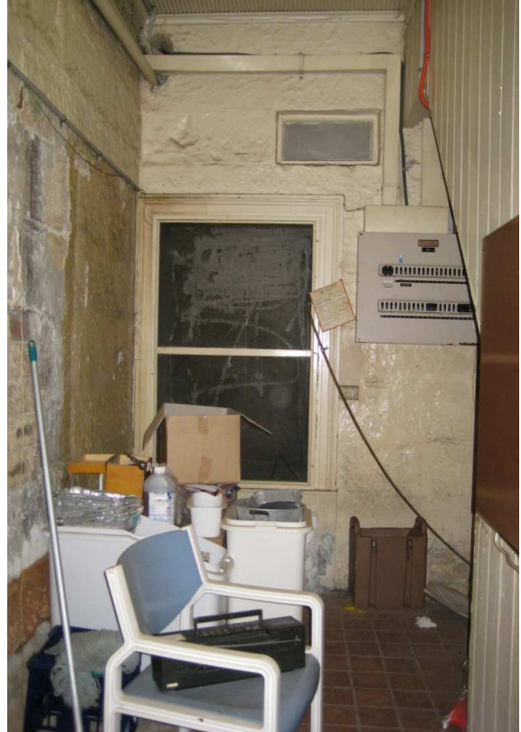
Room G16 looking east.