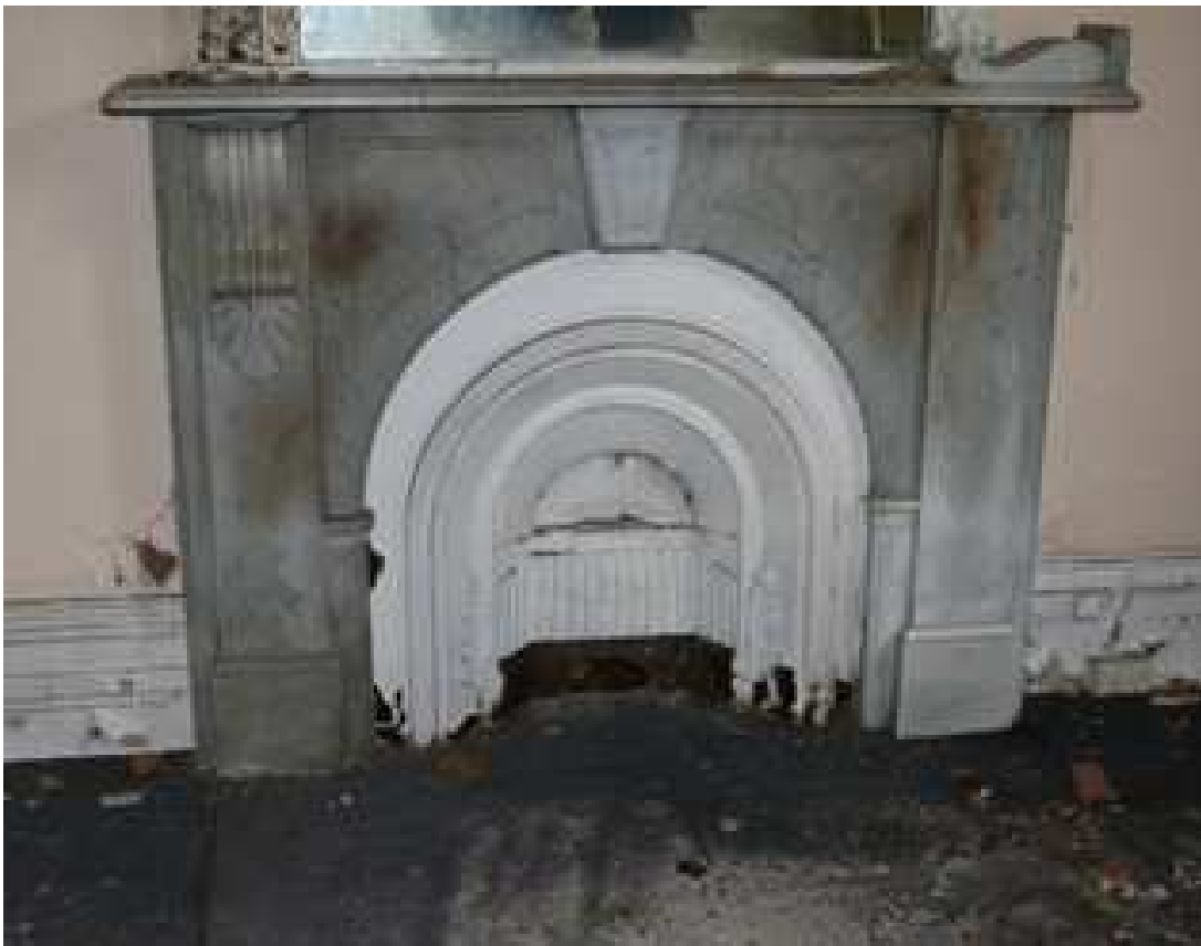
Room G4. Fireplace