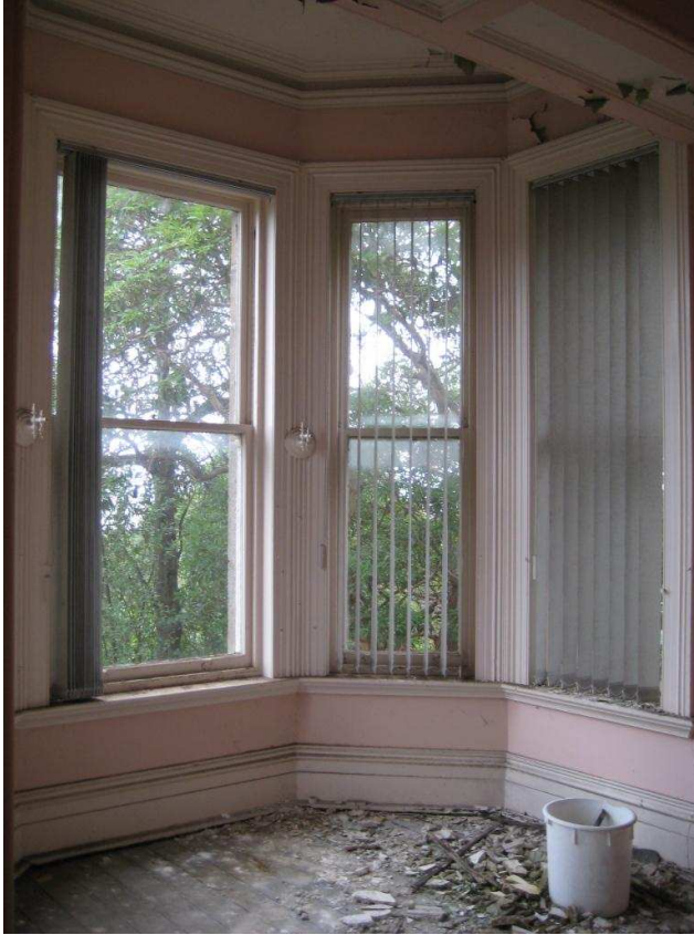
Room F1, bay window.