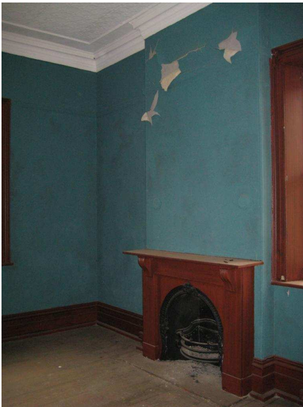
Room F4, looking north-west.