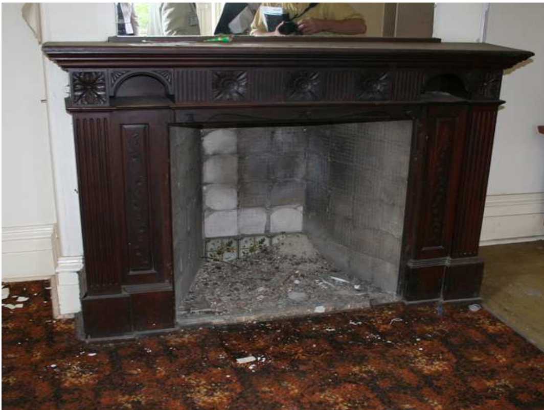
Room G1 Fireplace