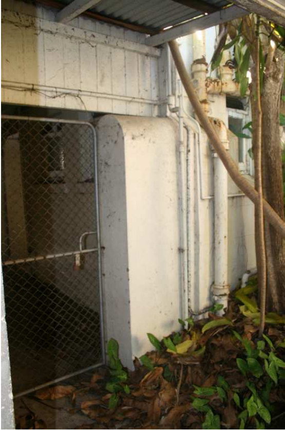
Room G10, remnant courtyard wall.