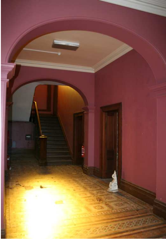
Room G5 looking north to the main stair.