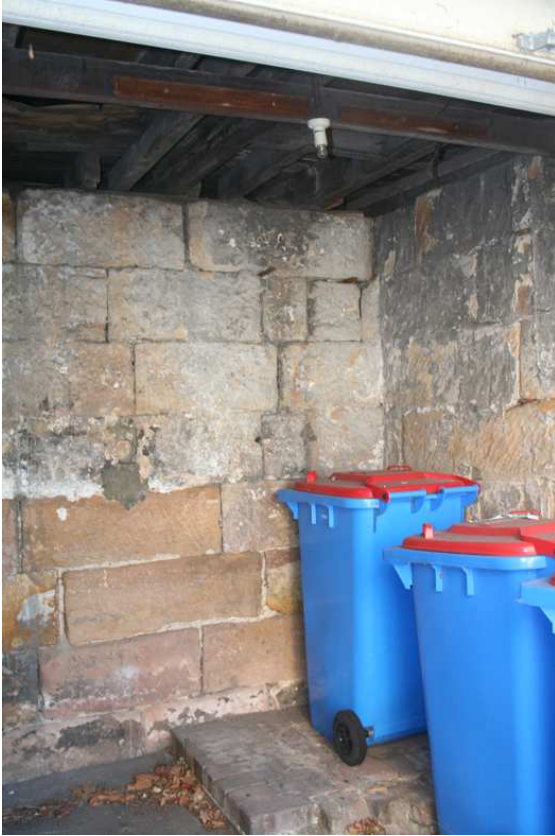
Room 19c, looking north-west.