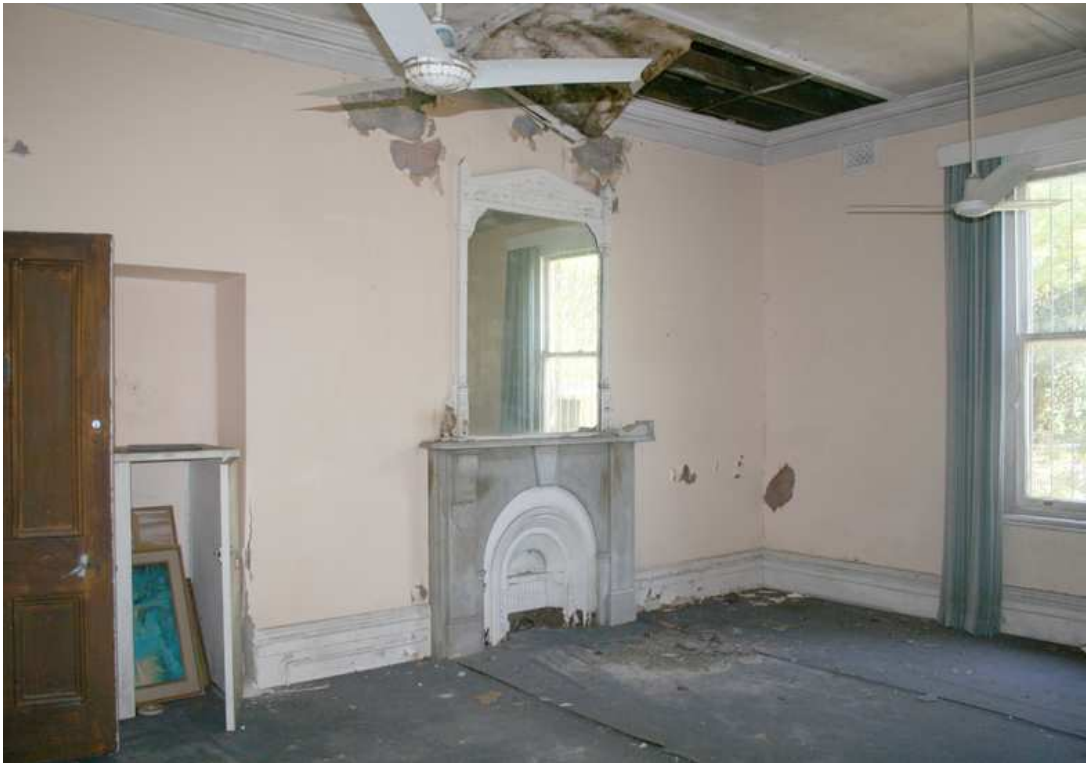
Room G4. Looking south-west