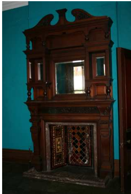
Room G6: Fireplace FP G6b