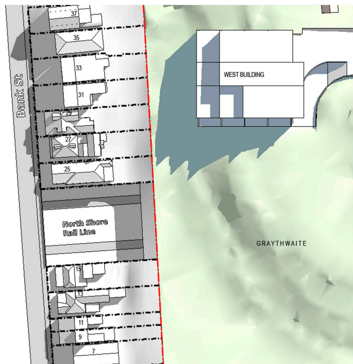
MARCH 21 9am