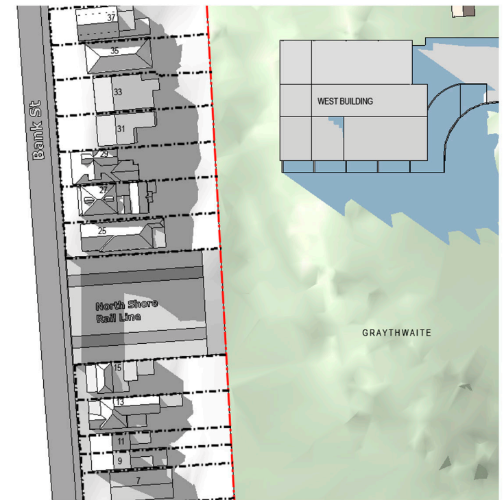
DECEMBER 21 3pm