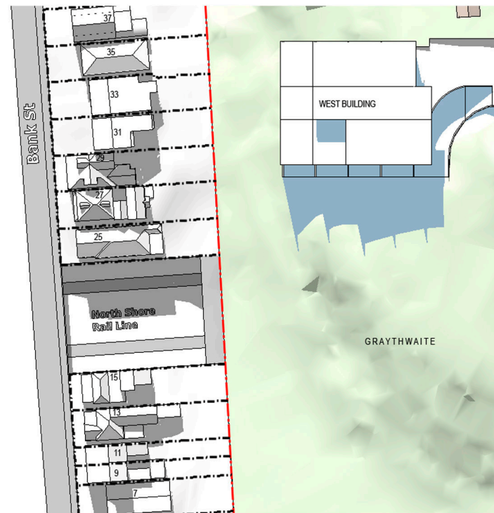
DECEMBER 21 12noon