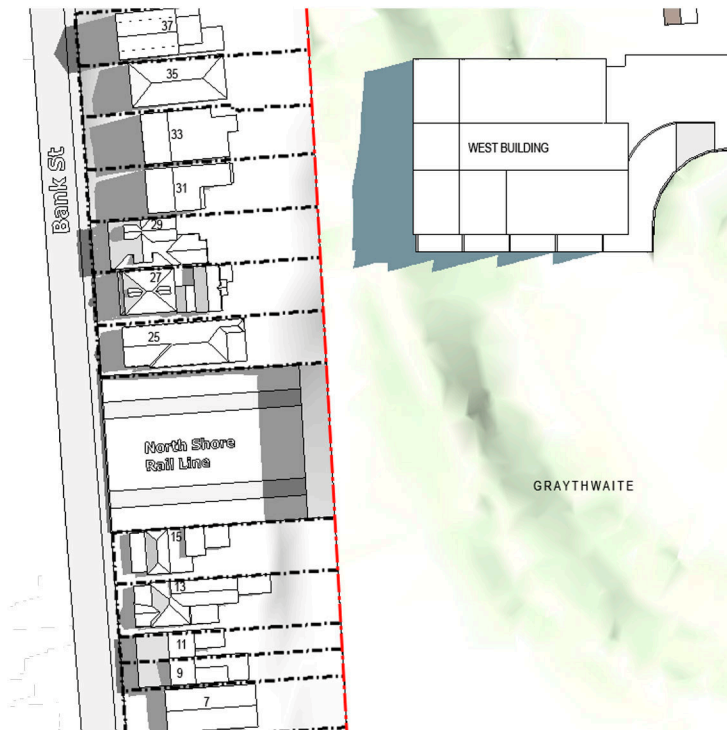
DECEMBER 21 9am