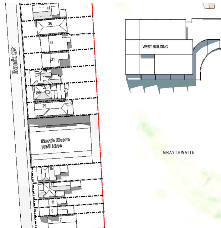
MARCH 21 12noon