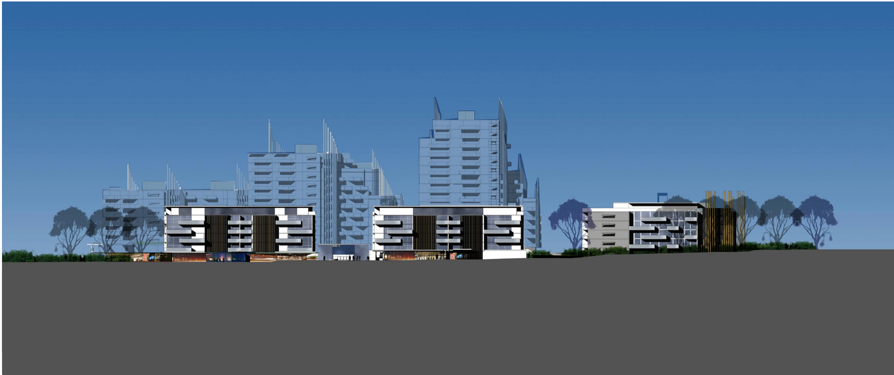
PRINCES HIGHWAY STREET ELEVATION - NORTH ELEVATION (SUBJECT TO CHANGE IN DETAILED DESIGN )