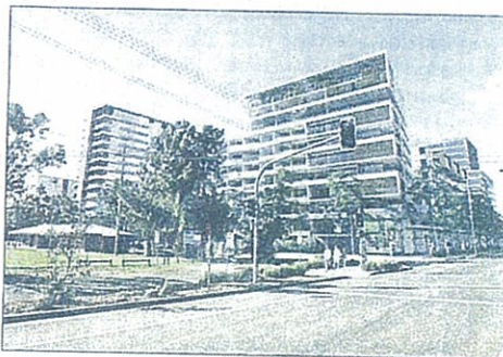
New homes: The proposed residential estate on the Sharks site.

In-principle agreement had been reached with the Transport Department for a bus route to service the location, the study said.