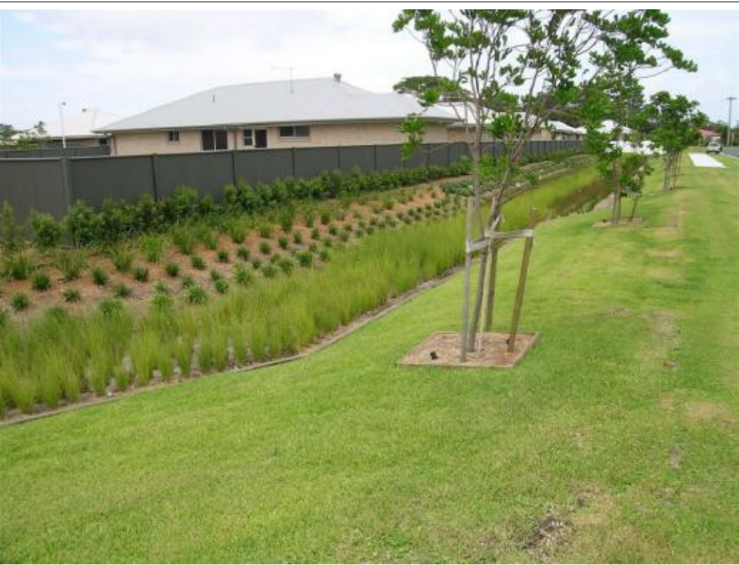
PHOTO 1: EXAMPLE OF RECENTLY CONSTRUCTED BIOFILTRATION BASIN WITH A WIDTH OF APPROXIMATELY 4m