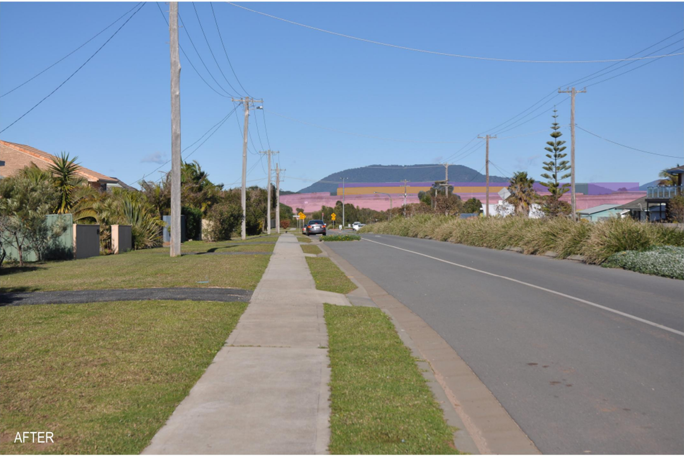
VIEW A: VIEW FROM OCEAN DRIVE ON APPROACH TO THE SITE FROM THE NORTH