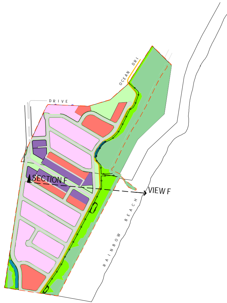
SECTION LOCATION 1:10000@A3