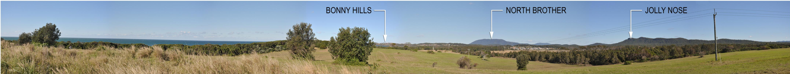
VIEW I: PANORAMIC VIEW FROM SITE

L:\14898_MILLAND_SEAWIDE\Planning\Photoshop\Exhibits 2010.03.15\14898_Exhibit_9D_View Analysis.psd