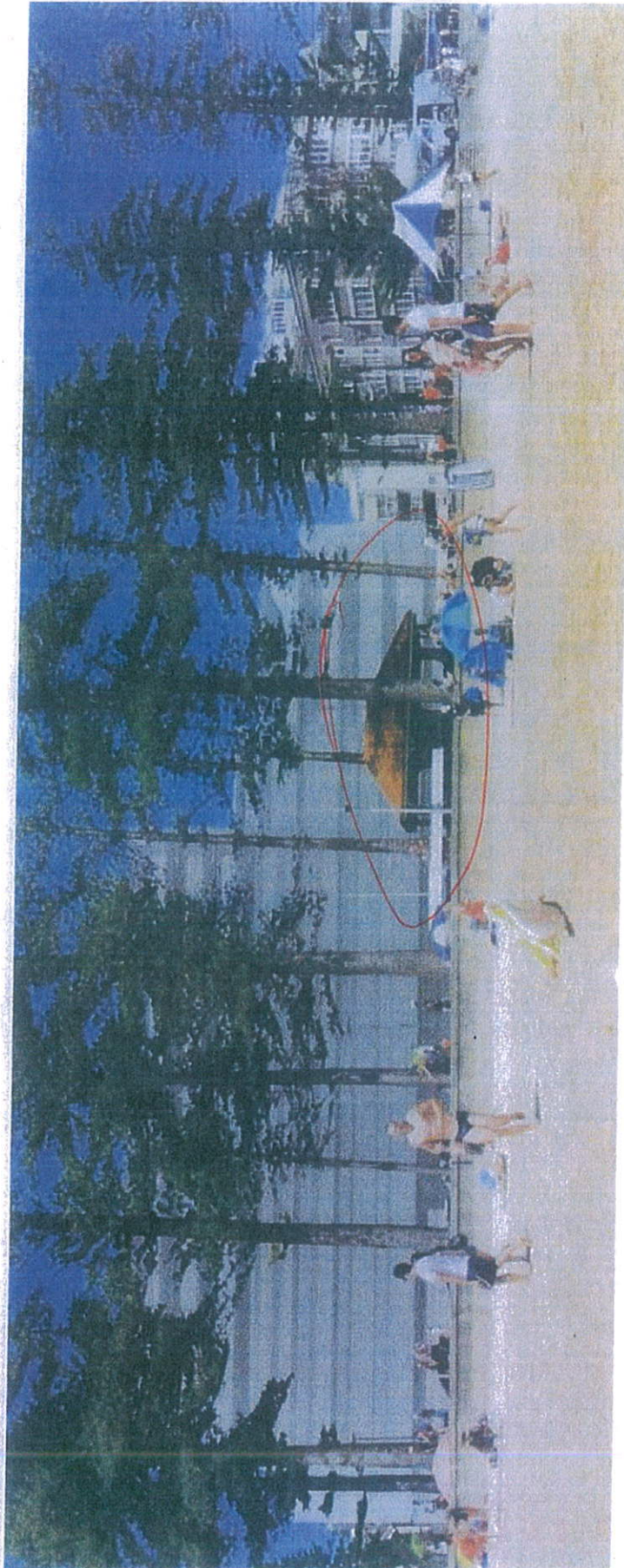
Figure 46 Existing and Proposed views from Manly Beachfront