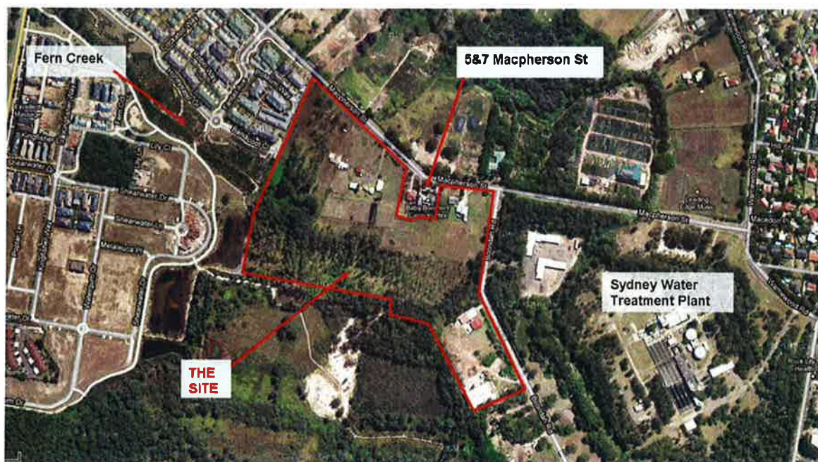
Figure 1: The site

The site locality and site boundary is illustrated in Figure 1