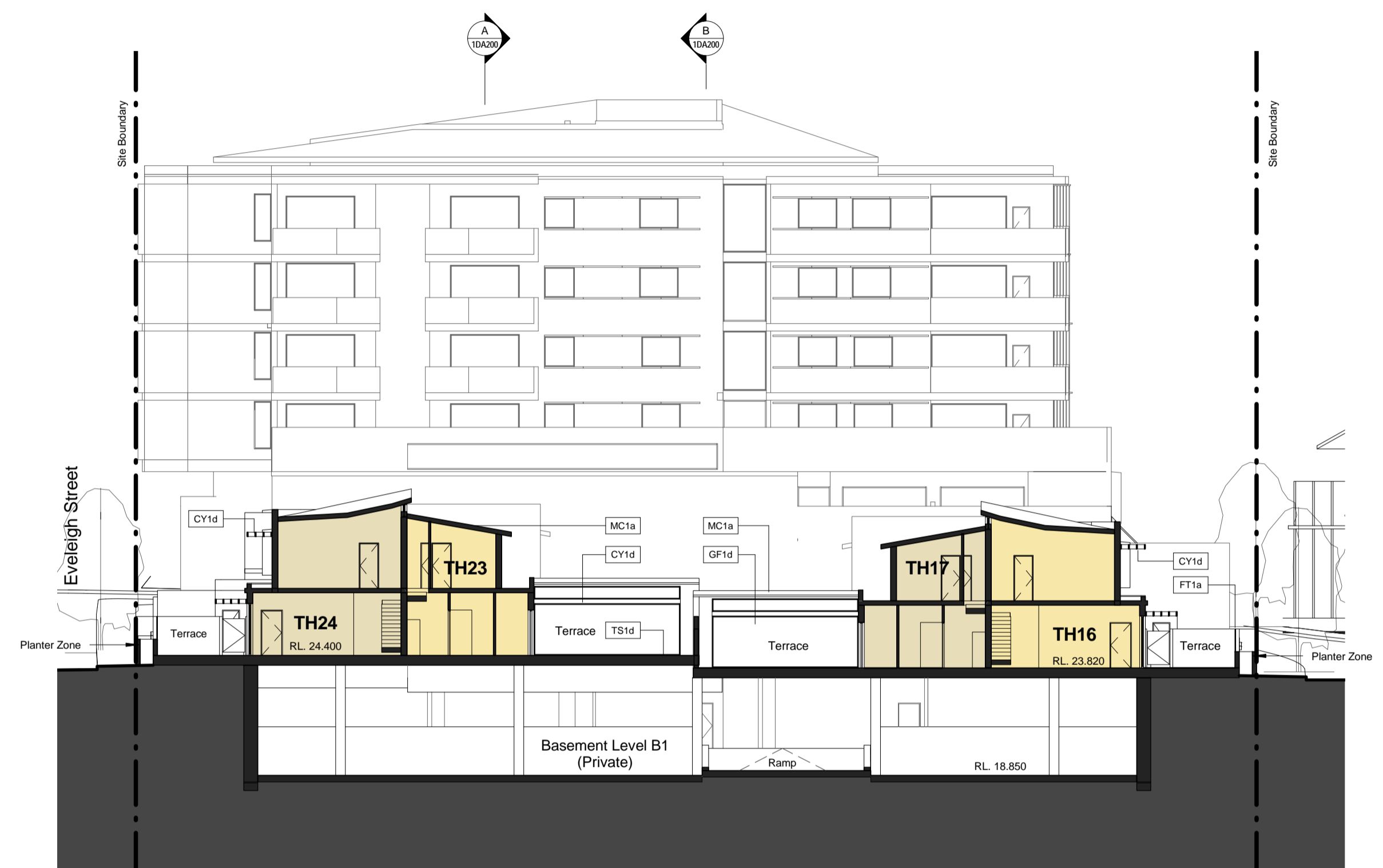
D Section 1 : 200