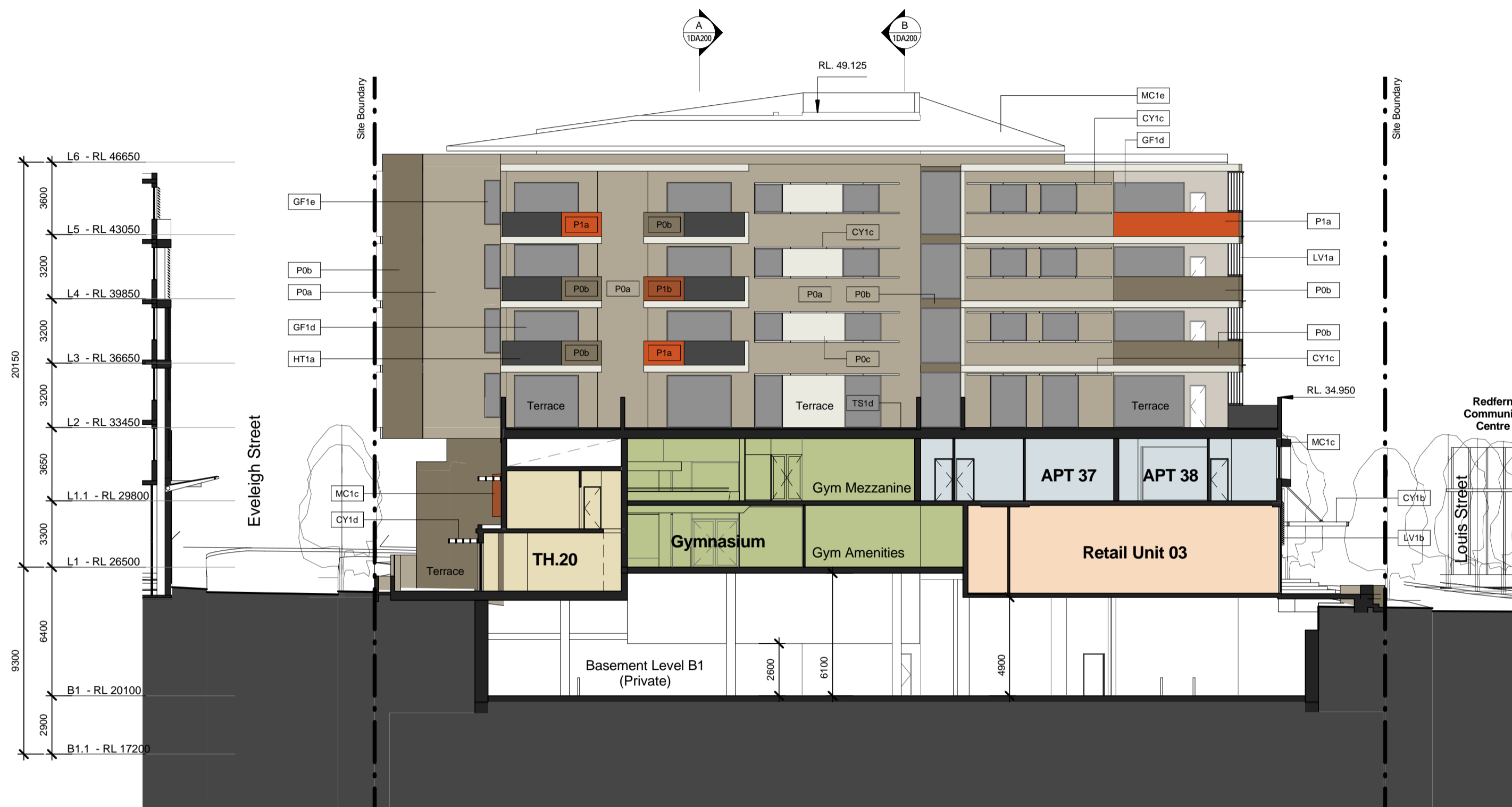
C Section 1 : 200