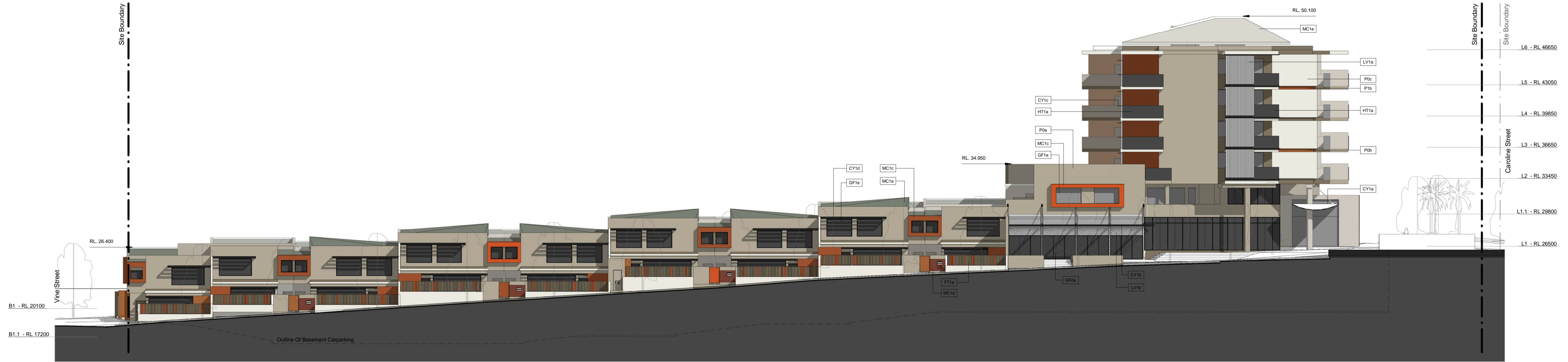
1 Louis Street (West Elevation) 1 : 200