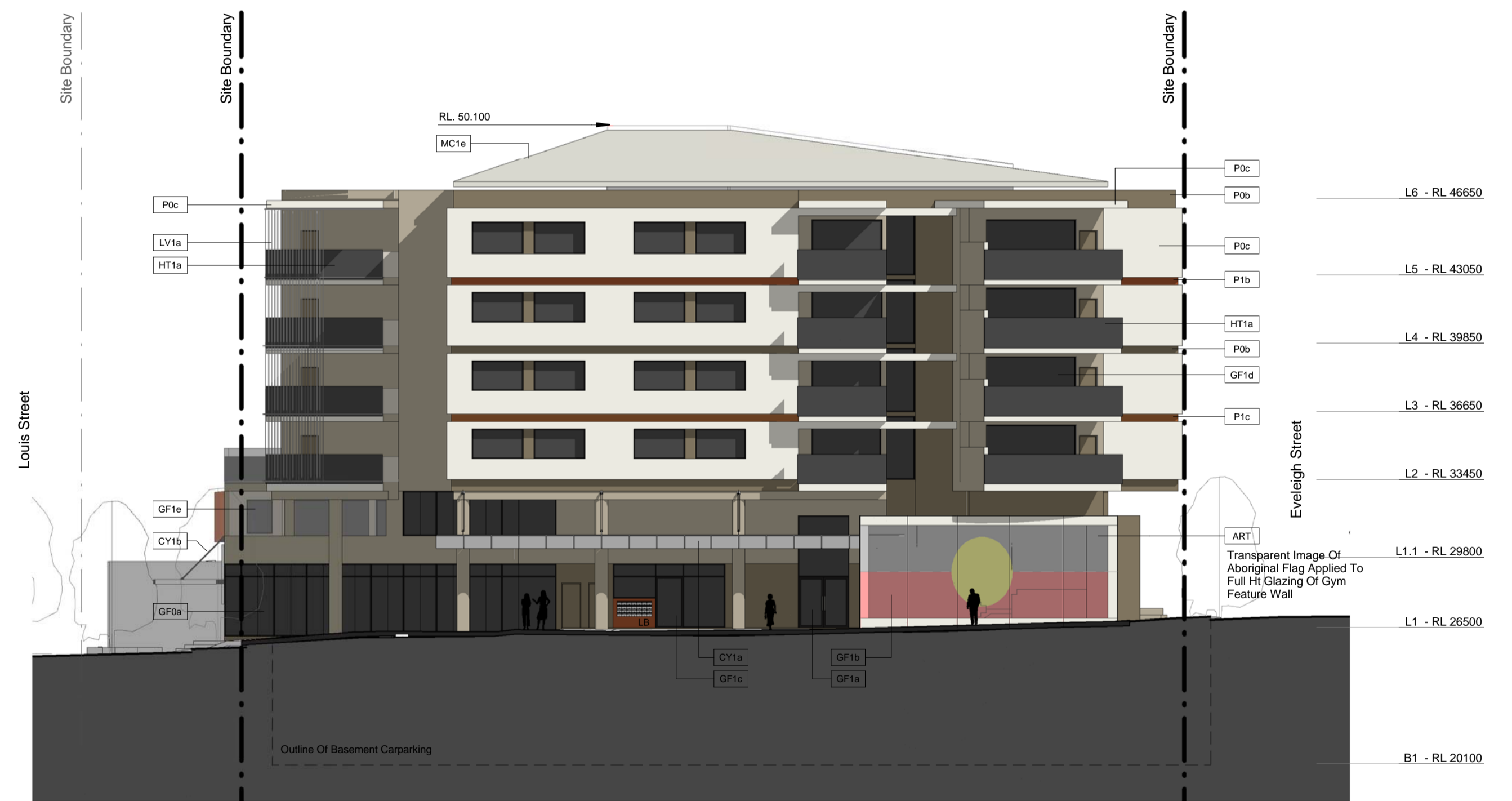
4 Caroline Street (South Elevation) 1 : 200

General Notes: Architectural Drawings To Be Read In Conjunction With All Other Consultants Detailed Drawings, Reports And Specifications. All Levels Indicated Taken To Australian Height Datum (AHD) Refer To 0DA900 For Abbreviation Schedule And Proposed Outline Colour Selections And Finishes Selections. Site Underlay Based On Survey Carried Out By Denny Linker For Previous Application and Subsequent Survey Work Carried Out By Daw & Walton Consulting Surveyors - Refer To Drawing 302895.