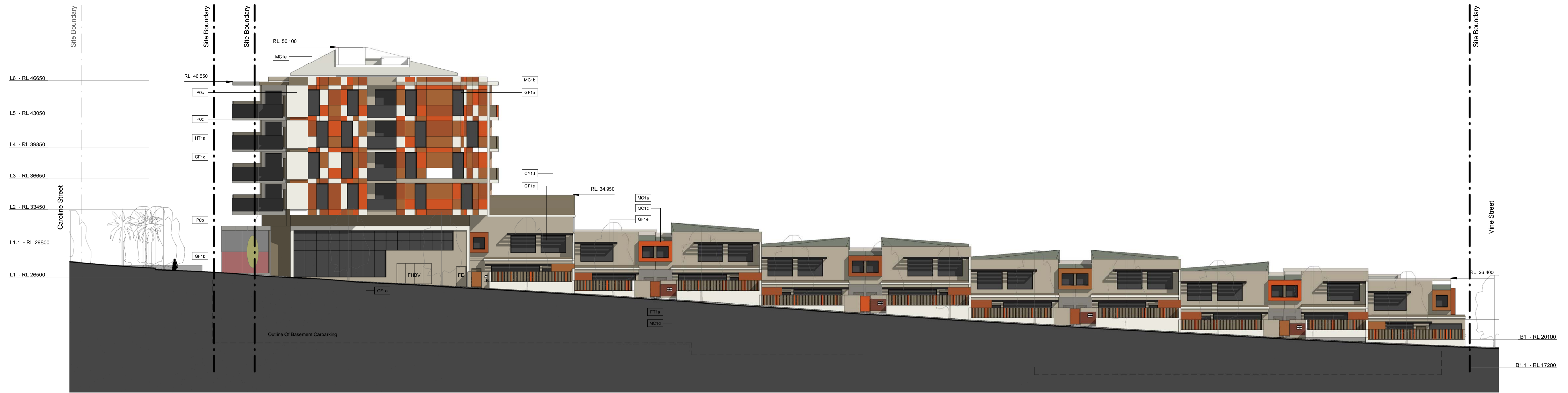
3 Eveleigh Street (East Elevation) 1 : 200