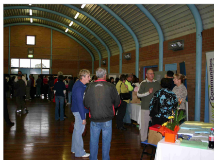
Community Information Day April 2007