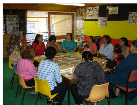
Workshops April 2007