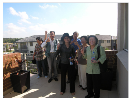
Bus Tours 2006 - 2007