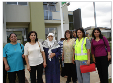
Bus Tours 2006 - 2007