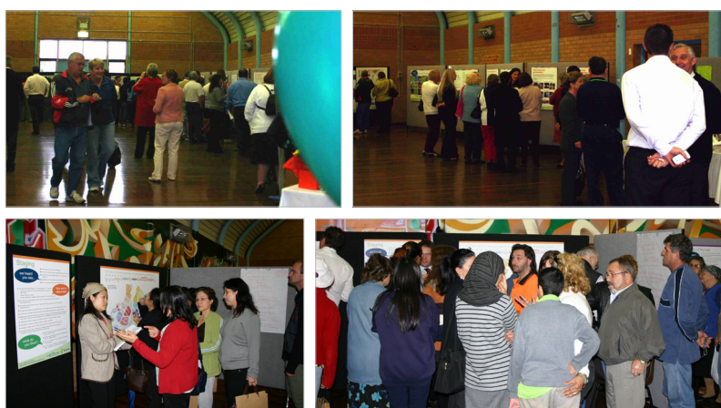
Community Information Day April 2007