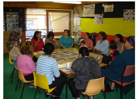
Capacity Building Workshop 7 March 2006