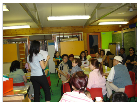
Workshops May 2007

During the information days, print materials were provided, tours were held, and workshops were conducted in main community languages.