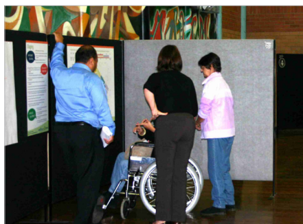
Community Information Day April 2007