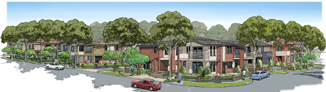
Example Perspectives of the New Bonnyrigg