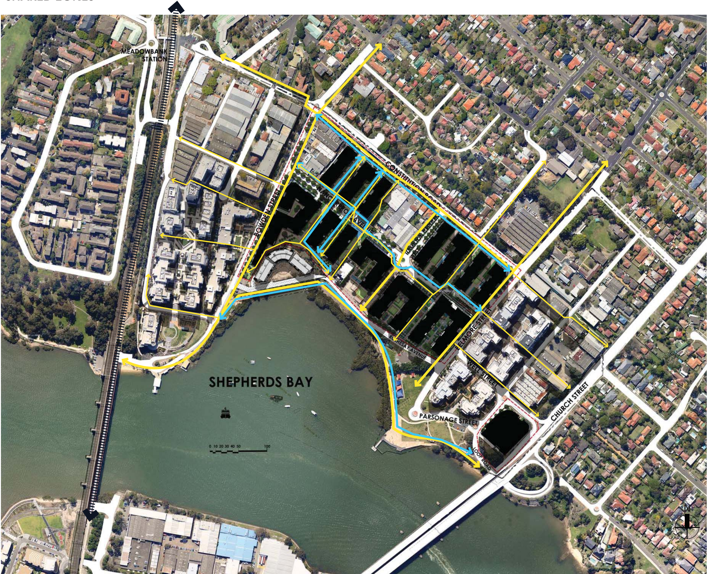
FIGURE 47. PEDESTRIAN AND CYCLE ACCESS PLAN

Recommended Development Principle Pedestrian ways, cycleways and shared zones across the Concept Plan site are to be provided generally in accordance with the Pedestrian and Cycle Access Plan and Report at Figure 47 .