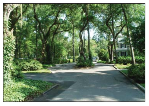
Individual lodge houses. Permanent residential & tourist

Existing house to be used as communal amenity building / function centre