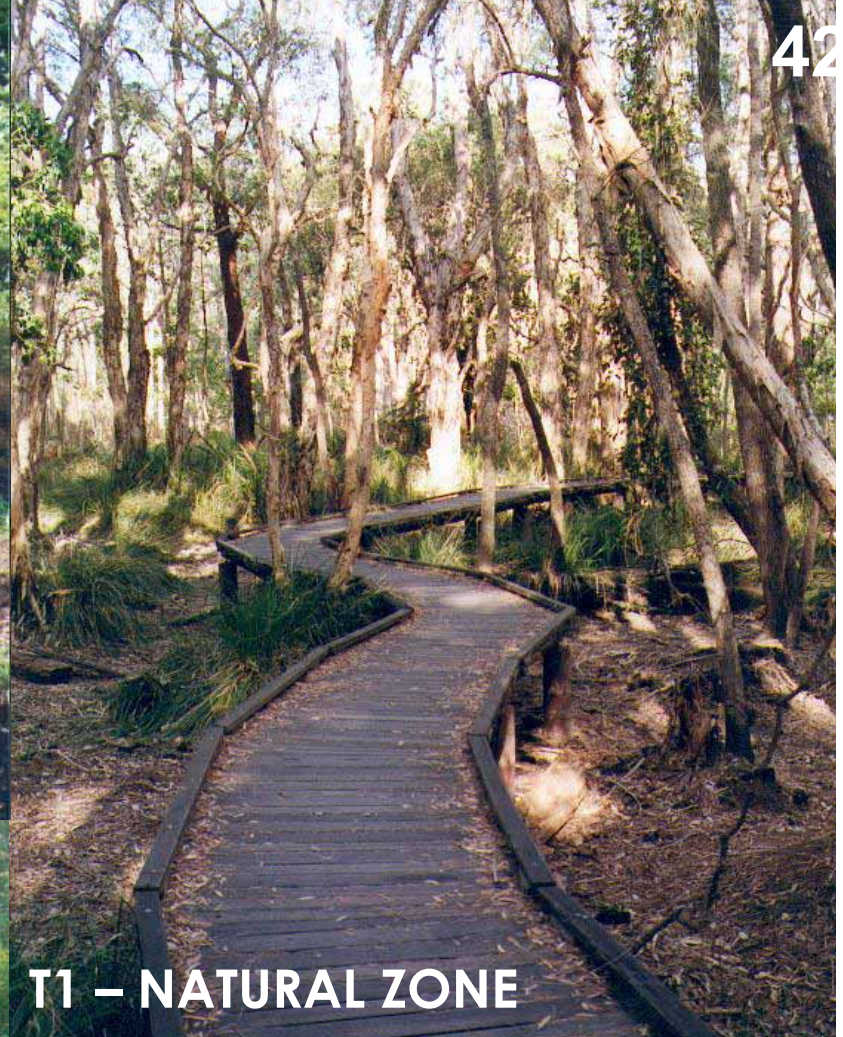
T1 – NATURAL ZONE