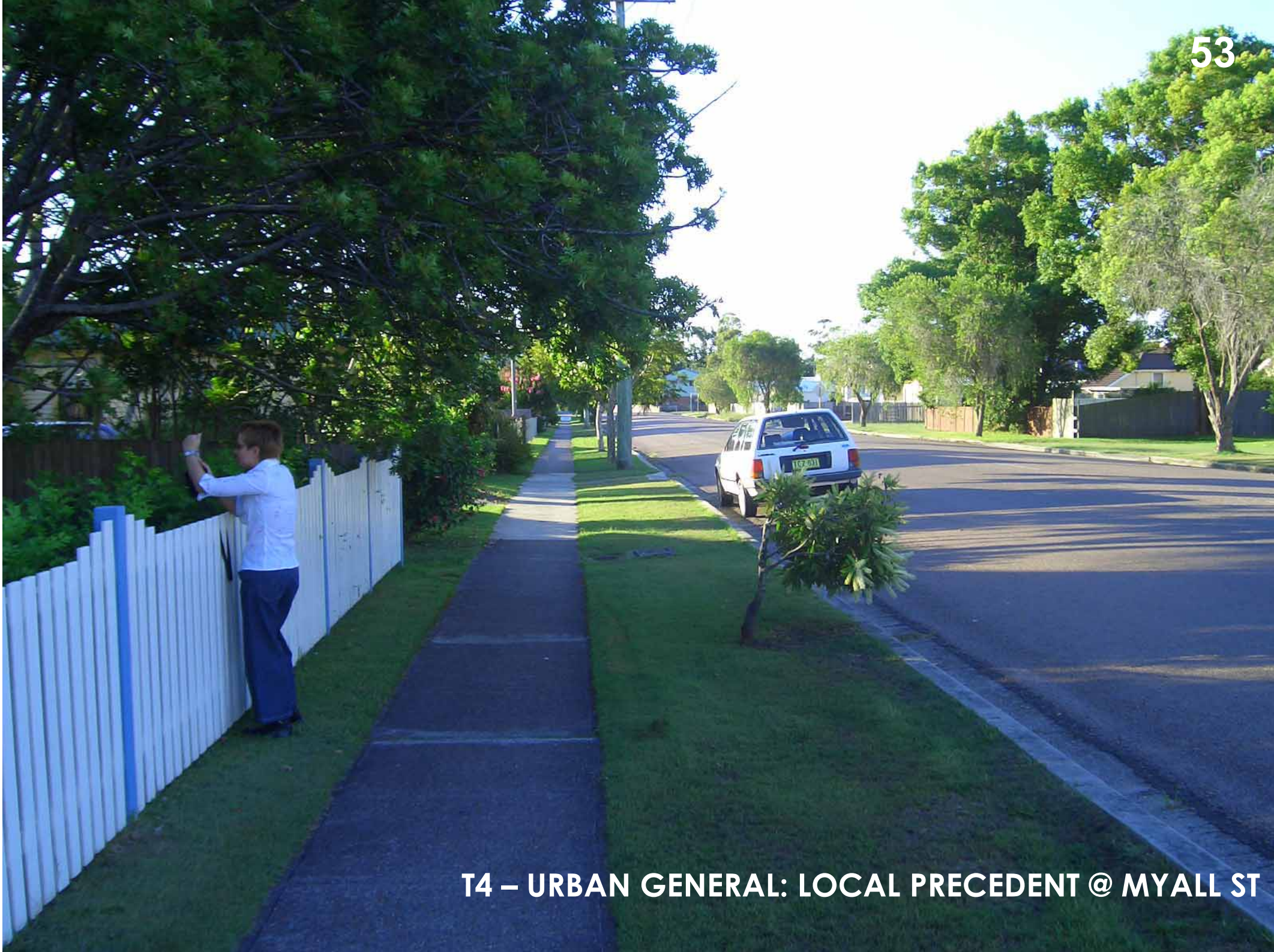
T4 – URBAN GENERAL: LOCAL PRECEDENT @ MYALL ST