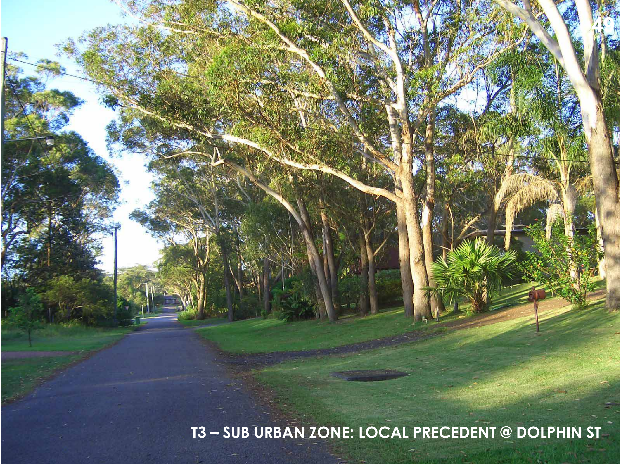
T3 – SUB URBAN ZONE: LOCAL PRECEDENT @ DOLPHIN ST