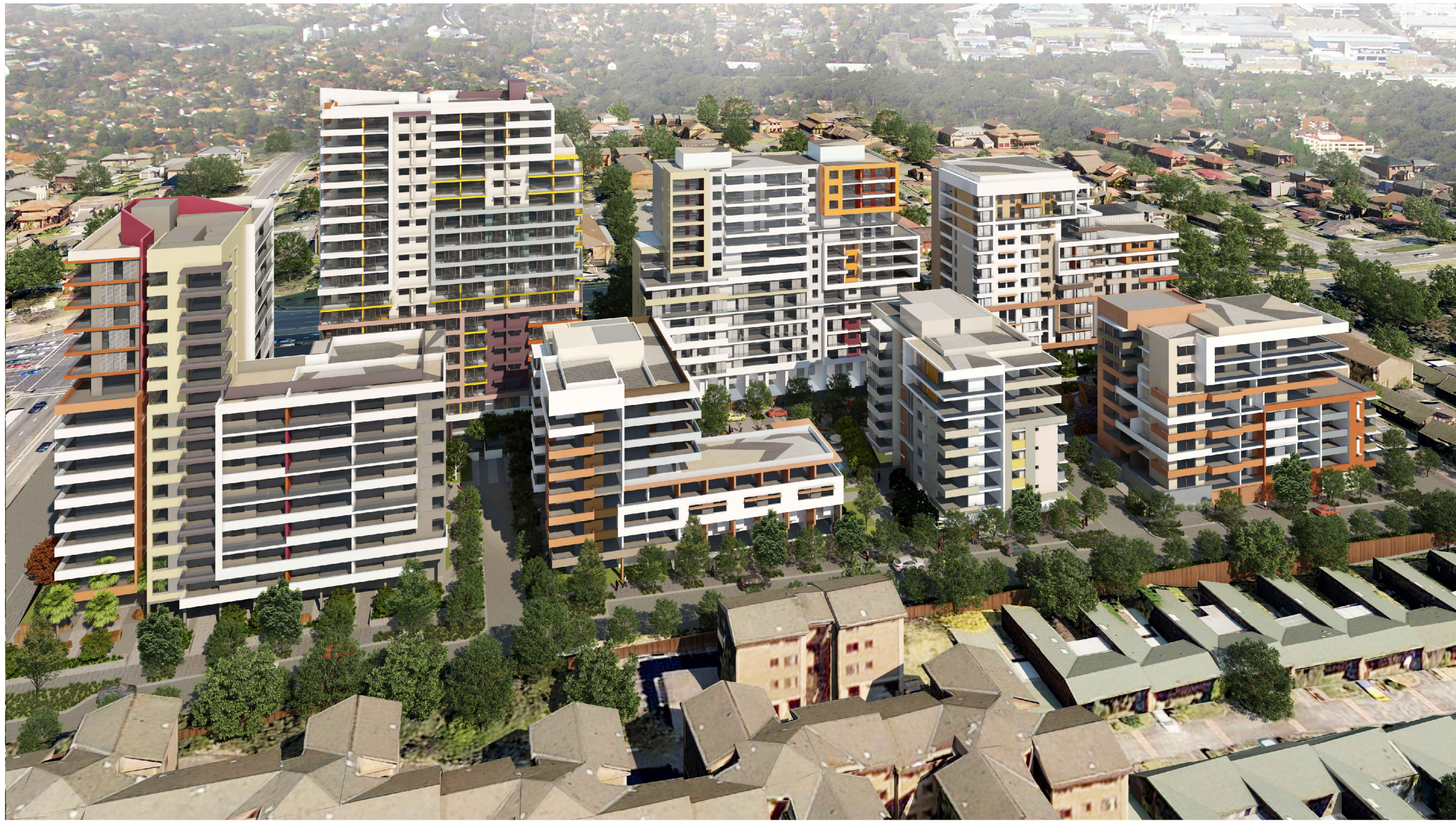
1 VIEW FROM NORTH EAST NTS