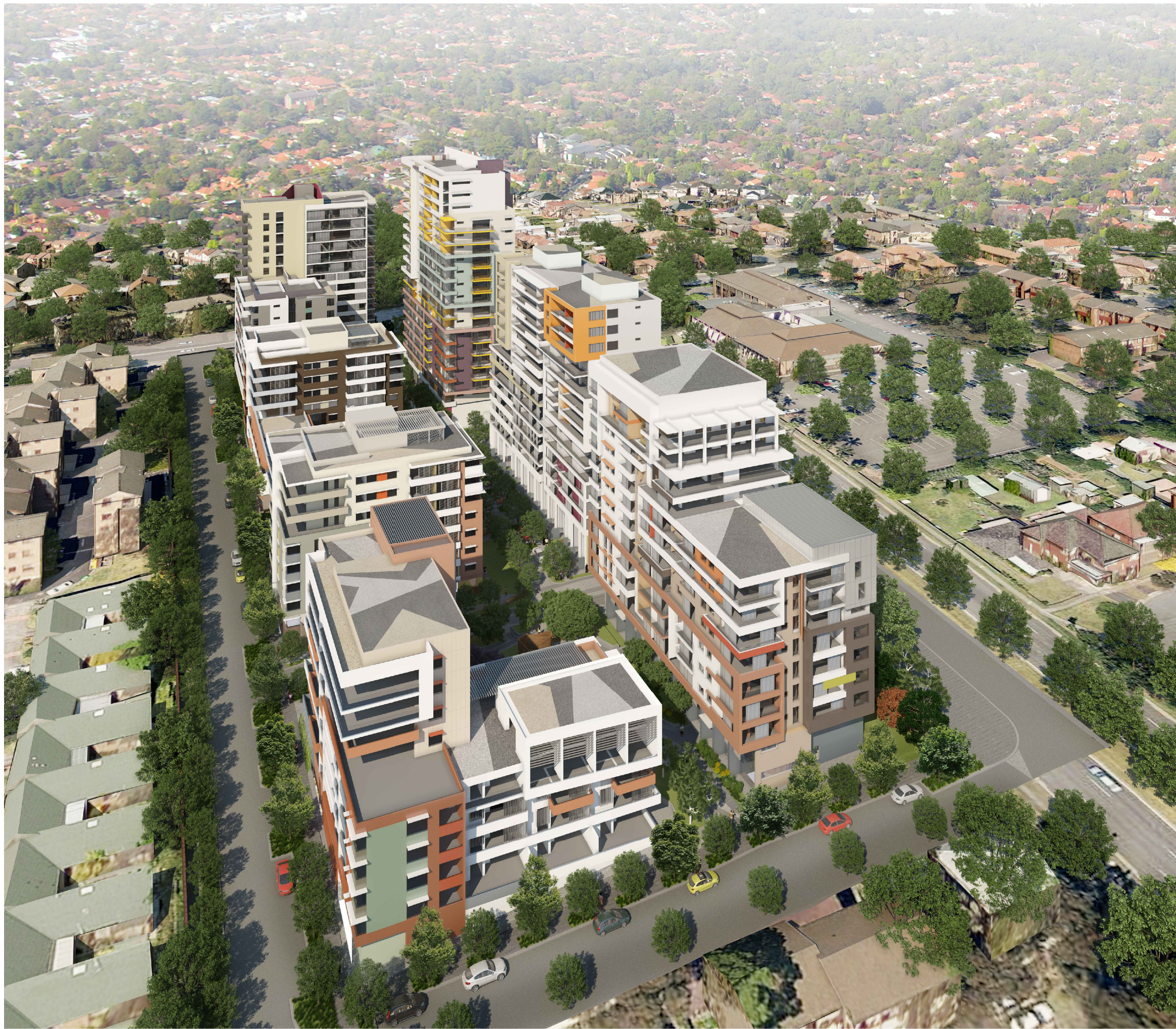
2 VIEW FROM NORTH WEST NTS