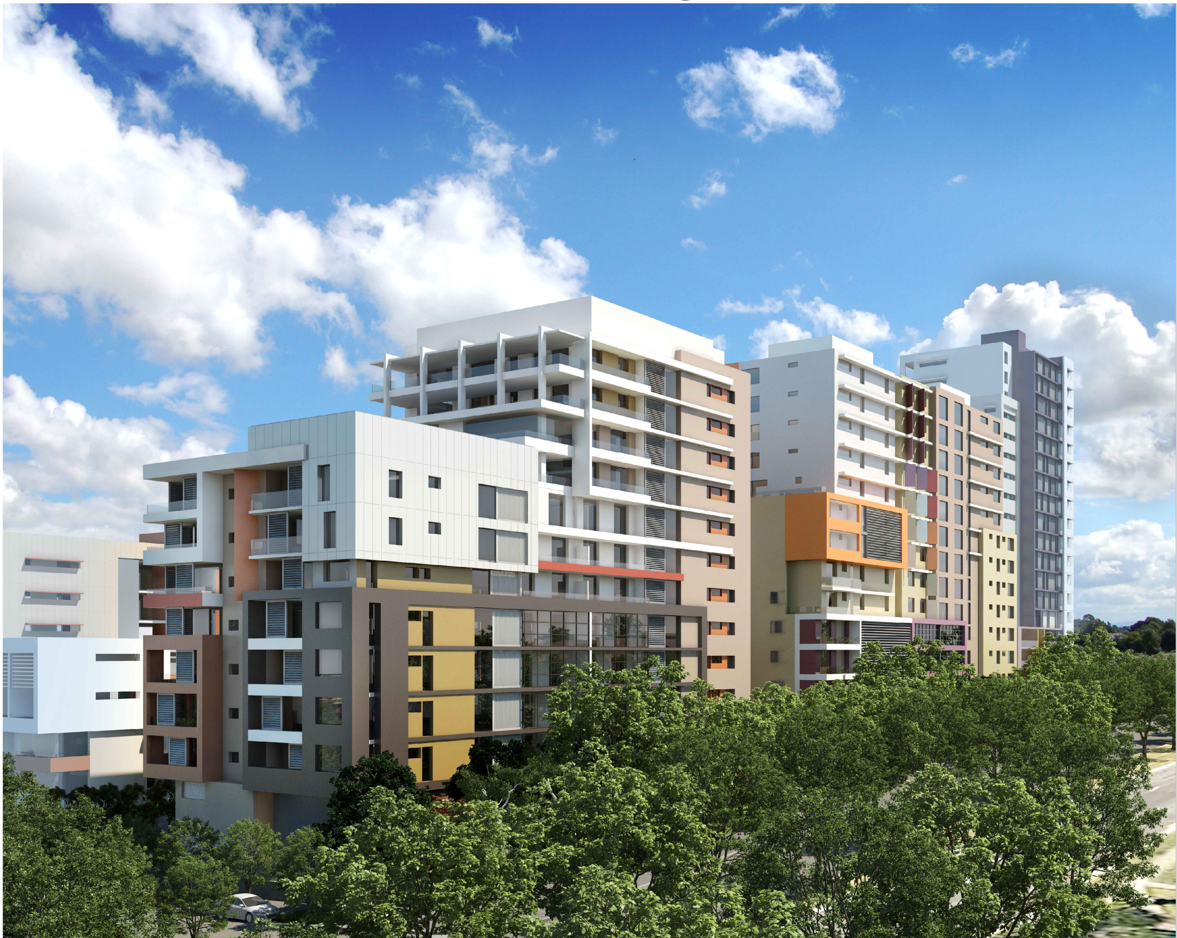
3 VIEW FROM EPPING ROAD NTS