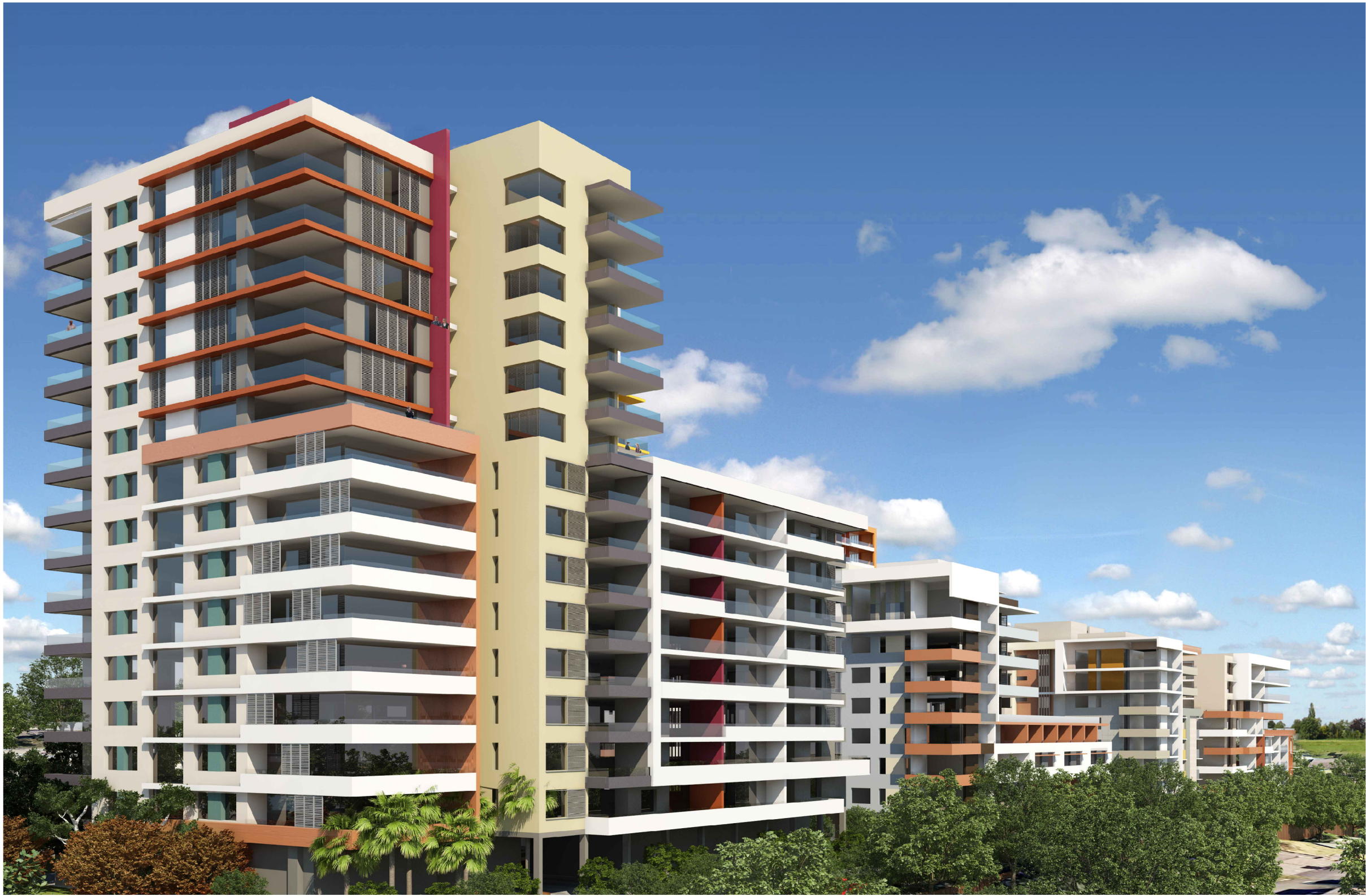
4 VIEW FROM HERRING ROAD LOOKING NORTH WEST NTS