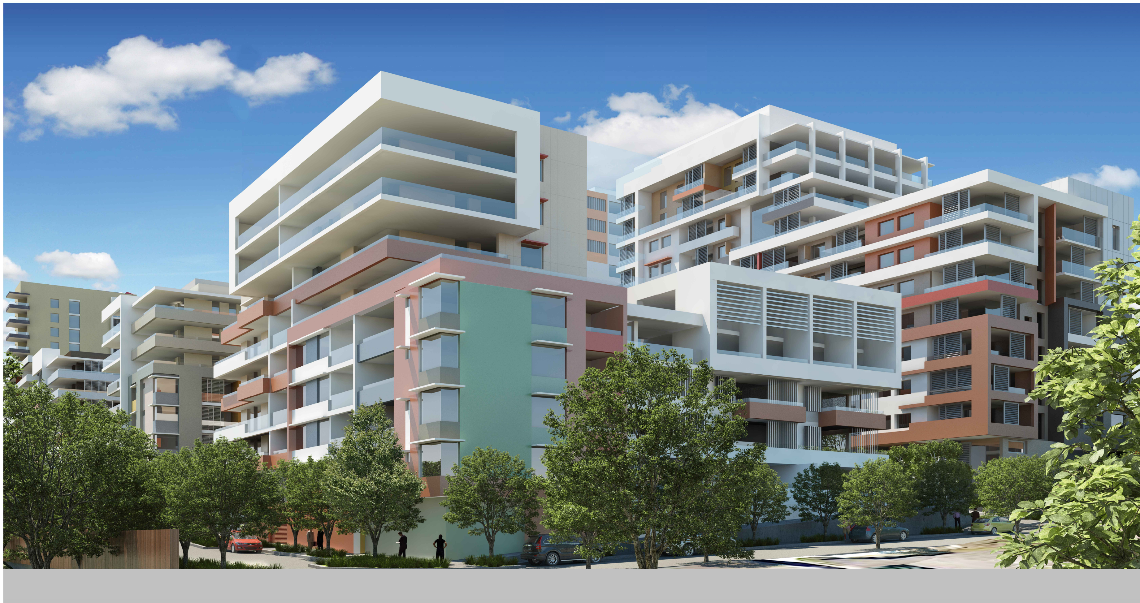
5 VIEW FROM NORTH WEST CORNER NTS