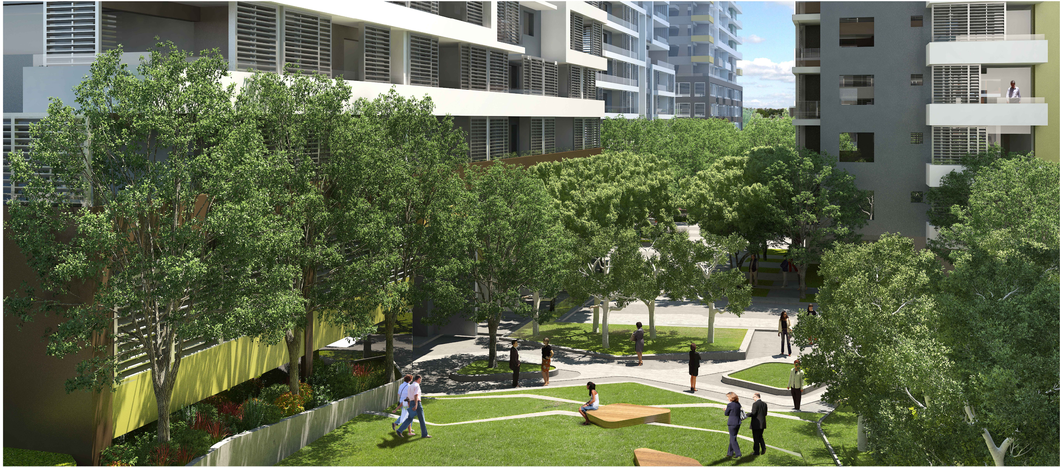
6 INTERNAL VIEW LOOKING NORTH WEST NTS