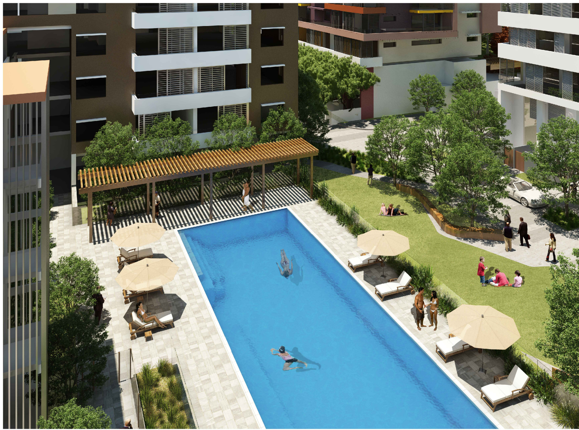
11 VIEW OVER POOL GARDEN + CENTRAL PARK NTS