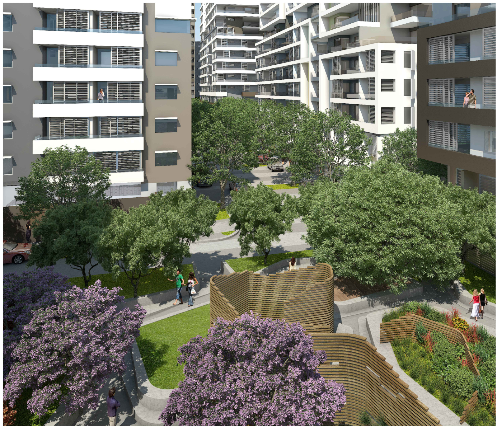
9 INTERNAL VIEW LOOKING SOUTH EAST NTS