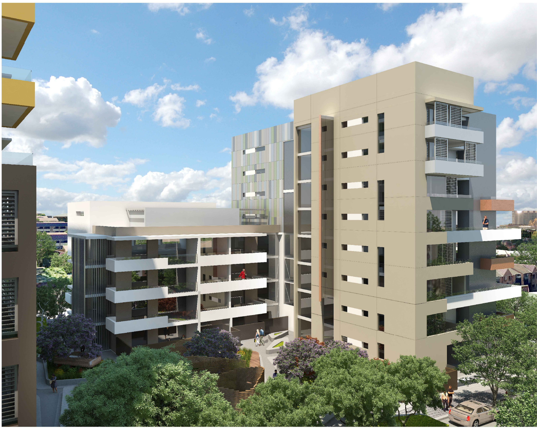
10 LOOKING NORTH NTS