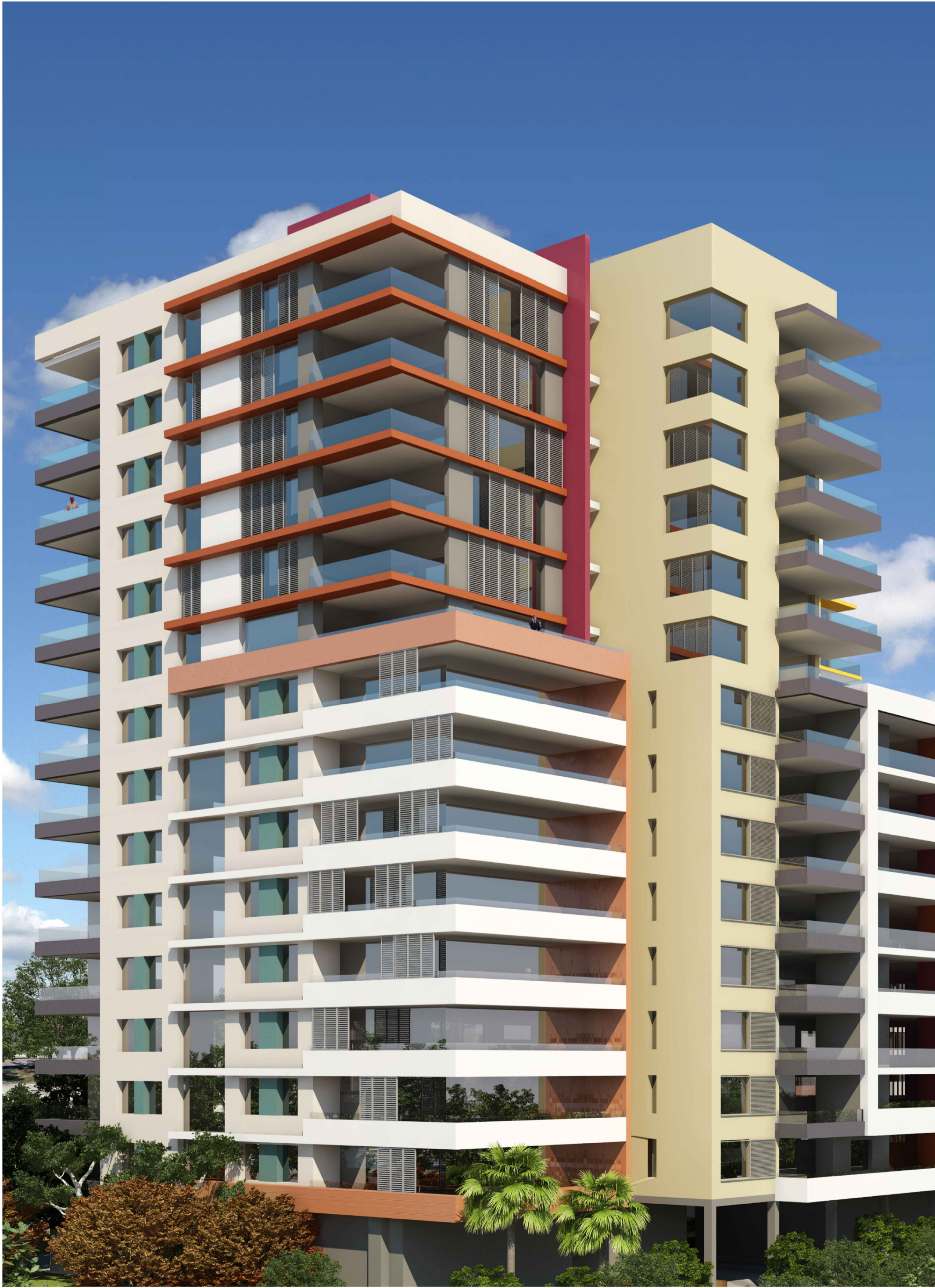
8 VIEW OF HERRING ROAD ENTRY + PLAZA NTS