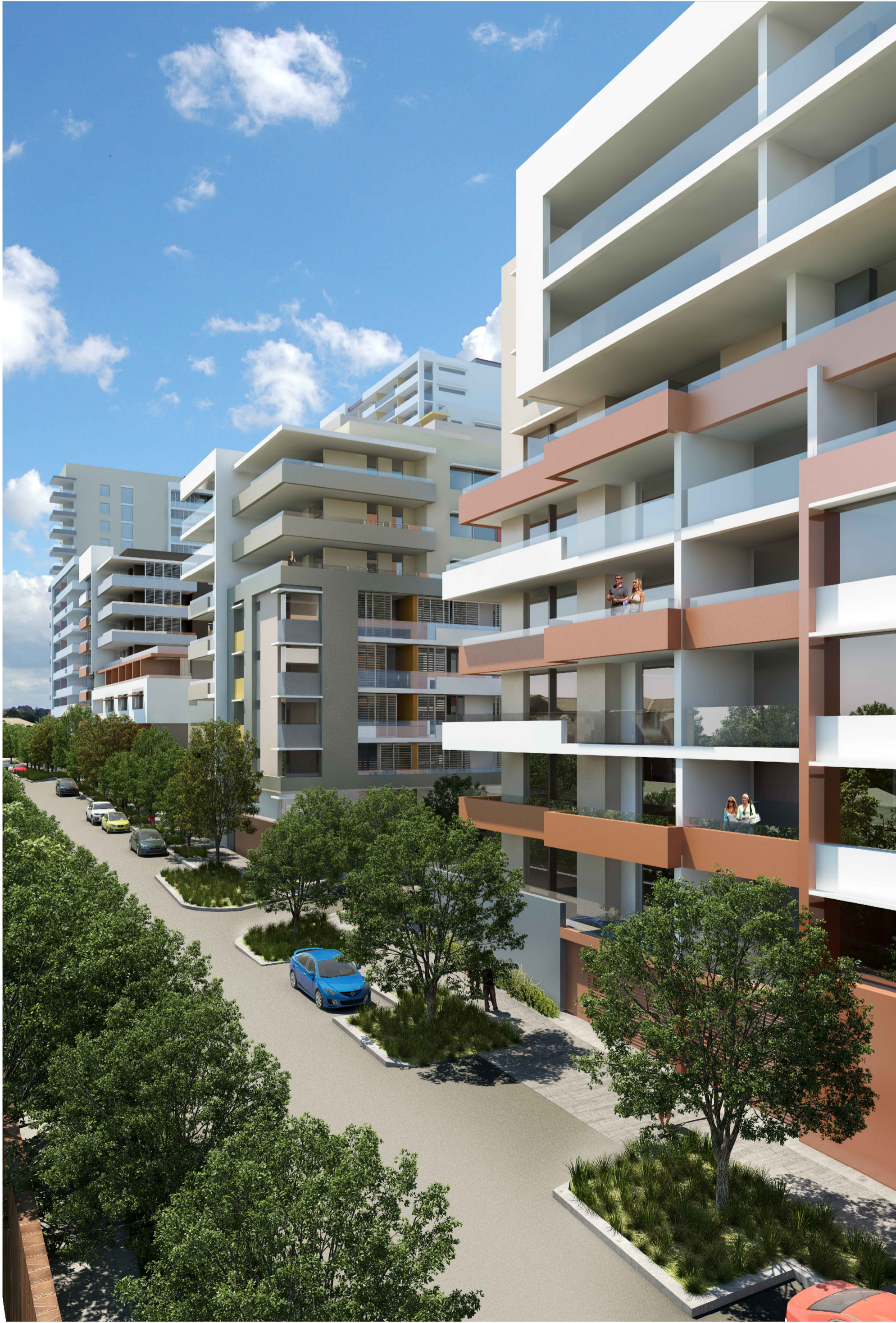
7 VIEW LOOKING ALONG PROPOSED DEDICATED ROAD NTS