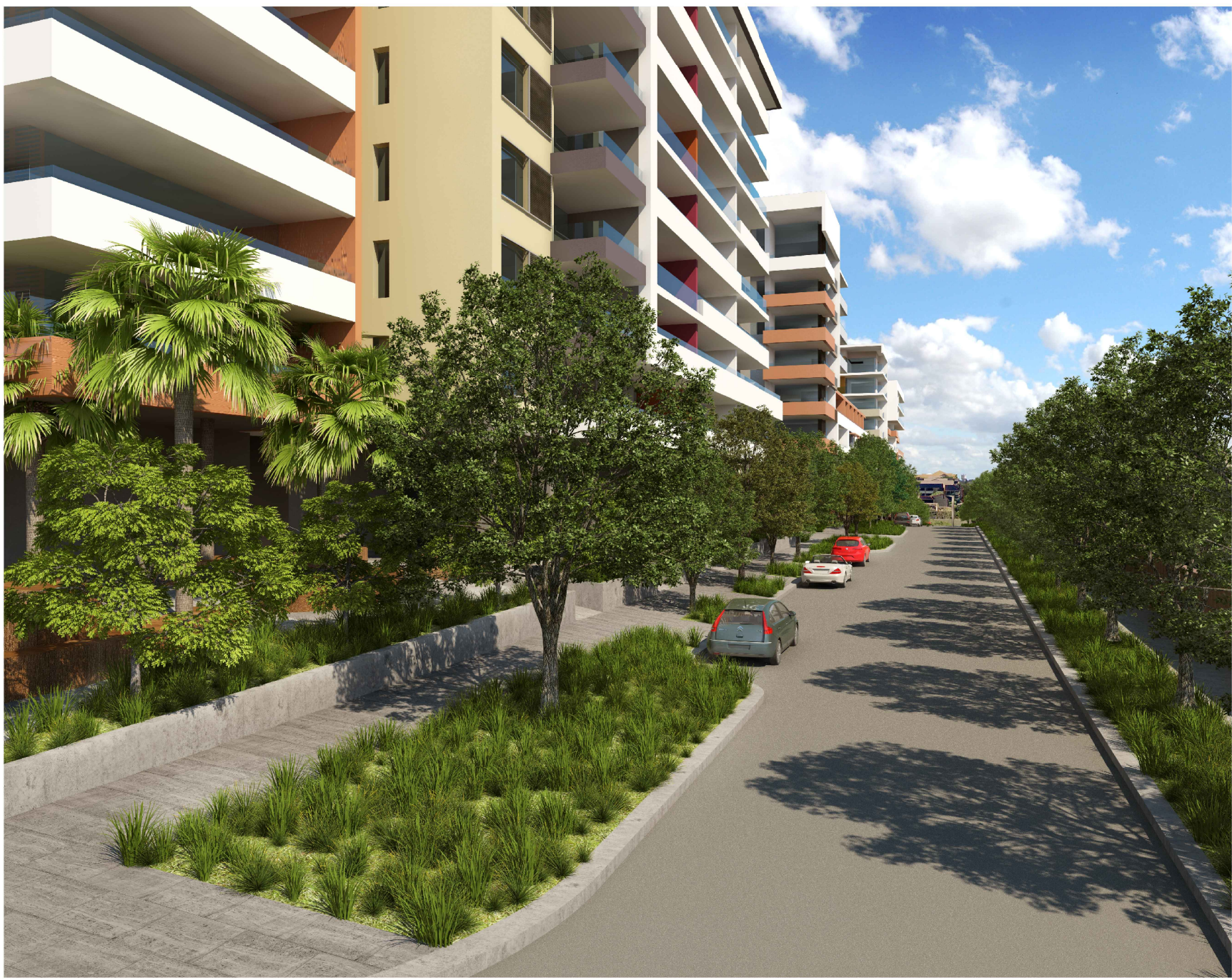
13 INTERNAL VIEW LOOKING NORTH WEST NTS