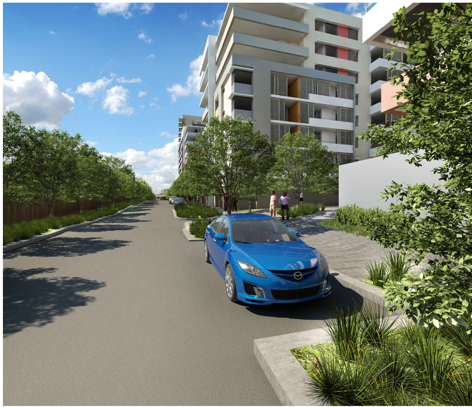
12 INTERNAL VIEW LOOKING TOWARDS HERRING ROAD NTS