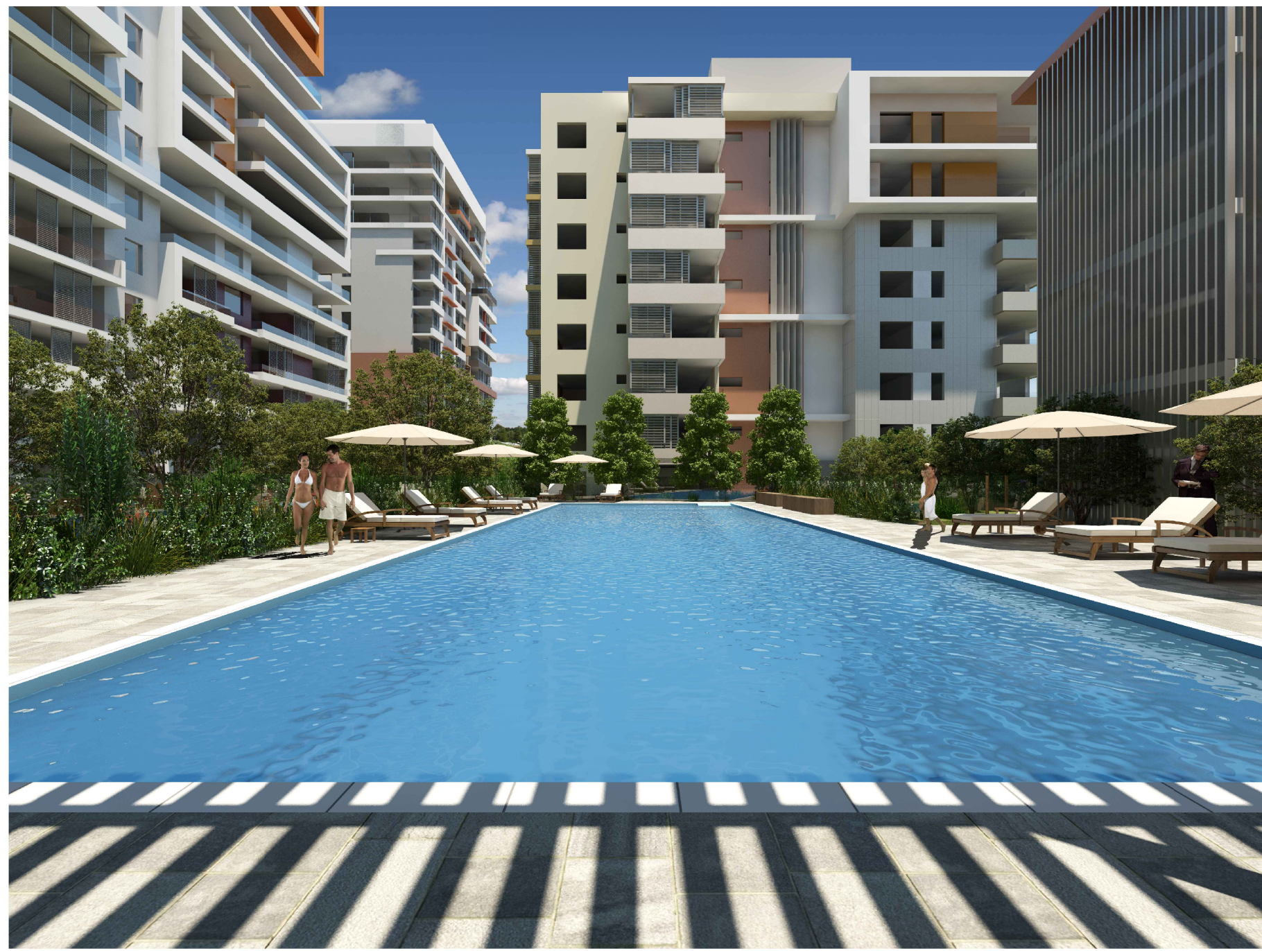
14 VIEW OVER POOL GARDEN NTS