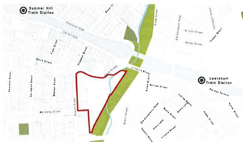
FIGURE 1. The Summer Hill Flour Mill site is located at 2-32 Smith Street, Summer Hill. Straddling the Council areas of Ashfield and Marrickville the site measures 2.47 hectares in area.