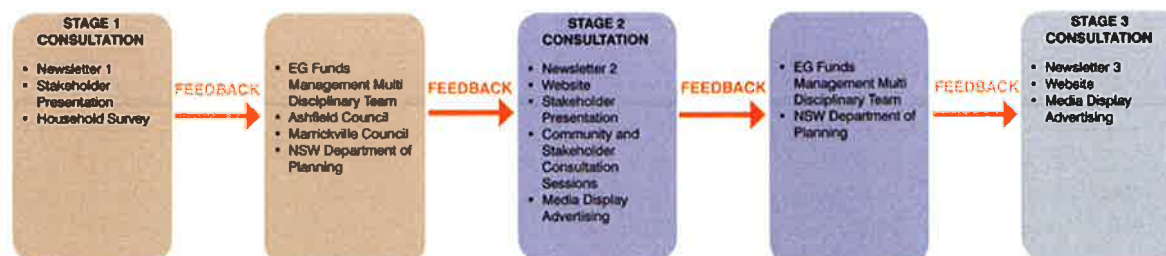
FIGURE 3 – CONSULTATION STRATEGY

Pending the approval of the Concept Plan by the NSW Department of Planning and Infrastructure Stage 3 initiatives will focus on explaining the final approved plan inclusive of any changes that may have been made in response to the Stage 2 consultation and formal public exhibition or otherwise requested by the department during the assessment process.