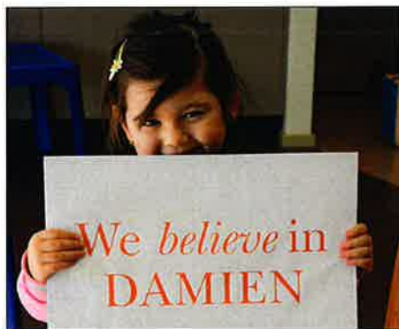
A young fan shows her support for Damien Leith.

"The first two years of life are the most important time in a child's emotional devel-