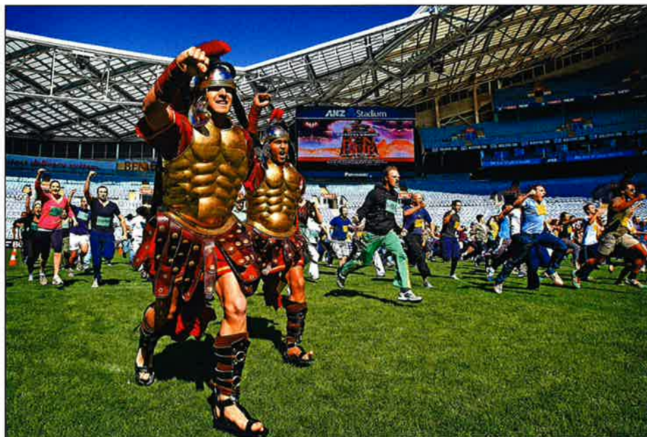
Wannabe gladiators audition at ANZ Stadium for the Ben Hur spectacular.