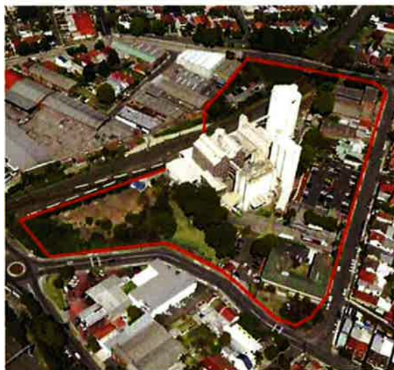
The flour mill (red border) area is adjacent to the Lewisham Towers site.

The development will be assessed by NSW Planning Assessment Commission, which is independent of the State Government.