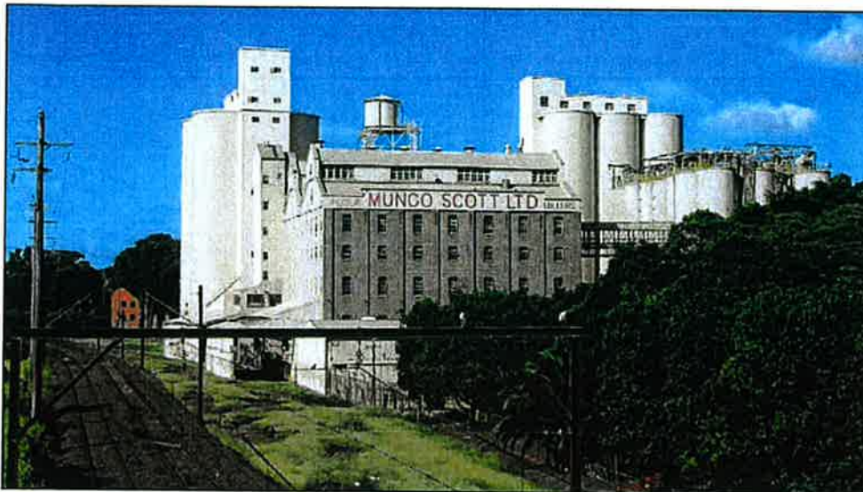
The flour mill site at Summer Hill.