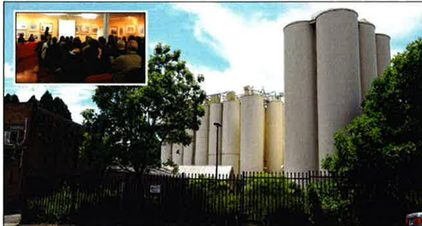
Proposals for the future of the Summer Hill Flour Mill site (main) are causing plenty of debate at consultation meetings (inset)

"This might include some amendments to our proposal."