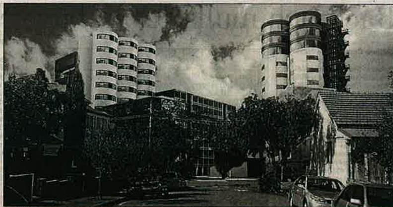
The concept plan for the Summer Hill four mill redevelopment in Sydney, next to a proposed light-rail station.

The Summer Hill project includes the redevelopment of six existing structures and the addition of two-storey and 11-storey buildings. Neighbouring the proposed Summer Hill light-rail station, it will have 280-300 dwellings, 2500-2800 sq m of retail space and 3500-4000 sq m of commercial space, along with open