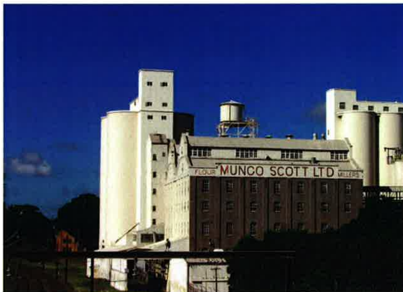
The flour mill (inside the red border and above) adjacent to the Lewisham Towers site.