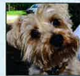
Name: Gilligan Age: 10 years Breed: Silky terrier

Gilligan is such a gentle gorgeous Silky boy. He is quiet and easy going and does not ask for much. Gilligan appreciates a quiet home life and loves people around. He really looks forward to his daily walk. He is very social with cats and dogs and is just a pleasure to be around. Gilligan is used to being left alone but certainly makes a big fuss of you when you come home. He weighs 5kg and is about 10 years old. His coat is low shedding and does need grooming. He comes desexed, C5 vaccinated, heartworm free and microchipped. His adoption cost is $350. To find out more visit DoggieRescue.com or call 9486 3133.