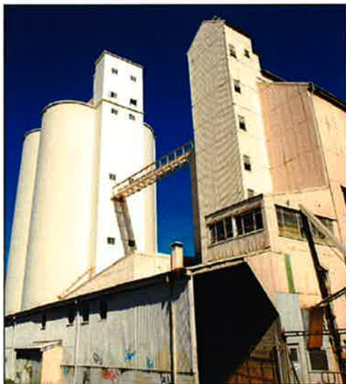
The Allied Flour Mill site at Summer Hill.