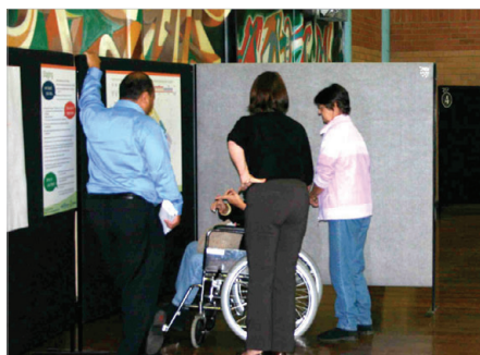
Community Information Day April 2007