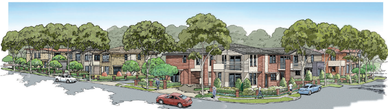
Example Perspectives of the New Bonnyrigg