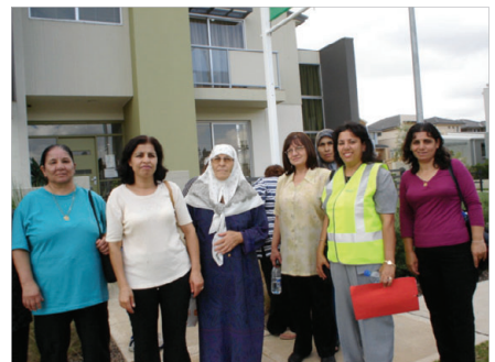
Bus Tours 2006 - 2007