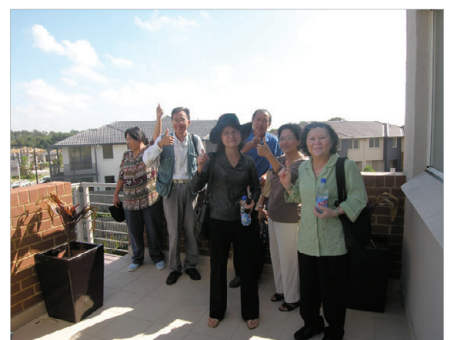
Bus Tours 2006 - 2007