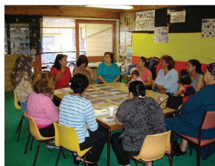
Workshops April 2007