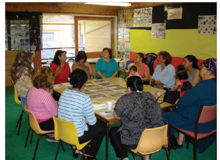
Capacity Building Workshop 7 March 2006