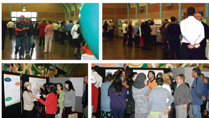
Community Information Day April 2007