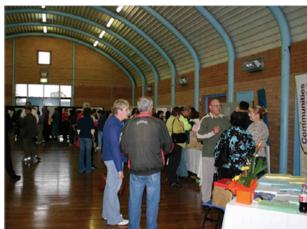
Community Information Day April 2007