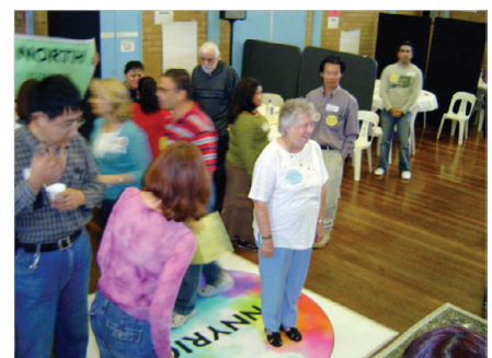
Speak Out - 2006