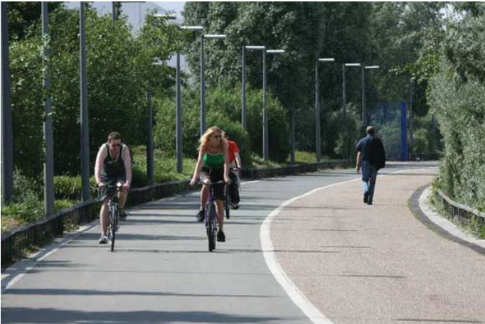
Shared path pedestrians and bicycle