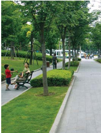
Street edge planting, ASPECT Studios image library