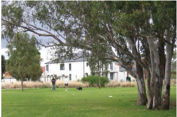
Open lawn landscape with trees