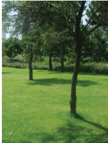
Open lawn landscape with trees